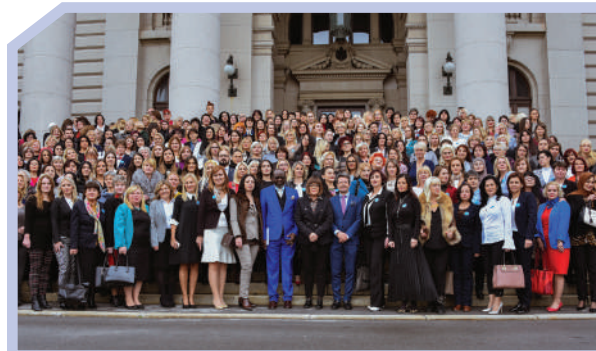
Conference of the Women's Parliamentary Network