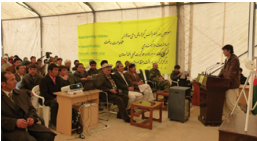
UNAMA Third Dai Kundi Annual Reporting Conference in Afghanistan on January 2012.

Public consultations: As noted in Section VI above, parliamentary committees should be engaging civil society and the public as they consider draft laws and conduct inquiries. Such consultations can range from the informal (such as public forums and reporting sessions) to the more formal (e.g., public hearings); and from the technical (e.g., surveys) to the simple (e.g., requests for submissions via SMS). Consultation can also come in the form of virtual engagement, including online feedback, surveys and social media.