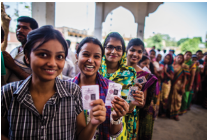
UNDP India India elections 2014.

tasking an existing committee to undertake a specific inquiry into an issue. If there is no committee with subject matter jurisdiction, or when an inquiry may require more dedicated resources, a parliament may also choose to establish an ad hoc or special committee with a specific, singular mandate to undertake an inquiry and then disband upon completion of its work.