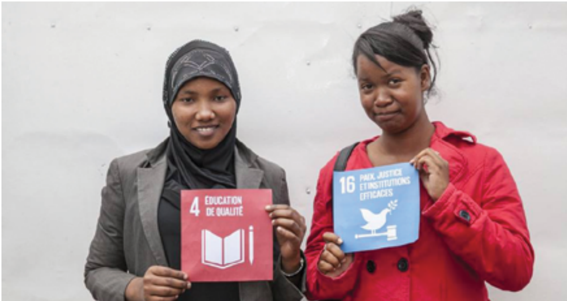
UNDP Madagascar Youth raise Global Goals at Social Good Summit in Madagascar on September 2015