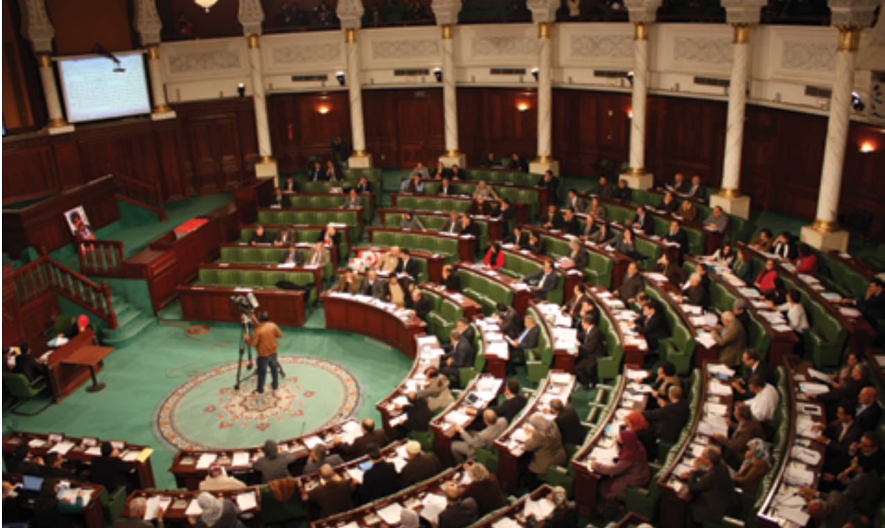
UNDP Tunisia Debates of the Tunisian Constitution, 20th January 2014.

Ideally, proposed draft laws dealing with development-related issues will explicitly identify whether and how they support Agenda 2030 and specific SDGs and their targets. This could be included in the explanatory memorandum to the draft law and in the speech introducing the draft law. Currently, however, this is not common practice. To address this, parliaments themselves may wish to commission an SDG Impact Analysis from their own parliamentary secretariats to identify how the proposed draft law impacts on SDG achievement. Alternatively, the rules of procedure can be amended to require the sponsor of the law to produce such an analysis when the draft law is introduced. Some countries already undertake socio-economic, environmental, and gender impact assessments of draft laws. Lessons learned indicate that such a process can be systematized through the adoption of a simple checklist, which can then be applied by the parliamentary secretariat to each draft law produced for consideration. Parliamentarians can then use this information to identify areas for amendment.