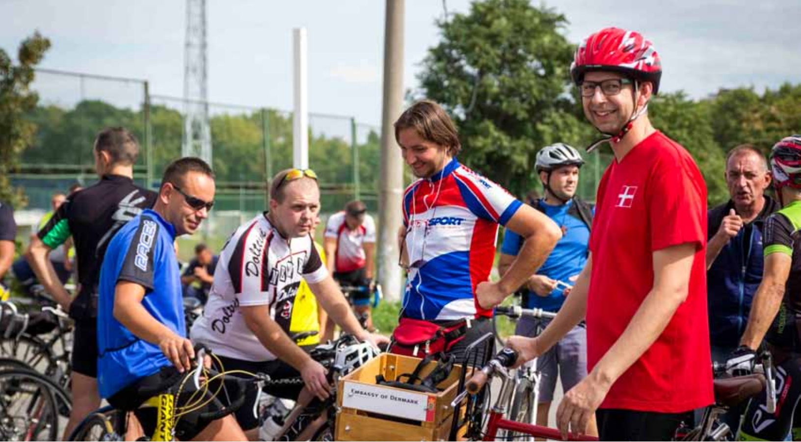
▲ Cycling ride during UNDP's European Mobility Week from Banjica to Topcidarska Zvezda square (UNDP Serbia)

It also needs to consider the long-term climate change and disaster risks that cities are likely to be exposed to and to envision a role for municipal authorities and mayors as champions and facilitators of action rather than as reactive administrators of change. Many forward-thinking city leaders around the world are already shifting to such forms of governance, as has been seen in cities as diverse as Medellin in Colombia, 40 Makassar in Indonesia 41 and Seoul in South Korea. 42