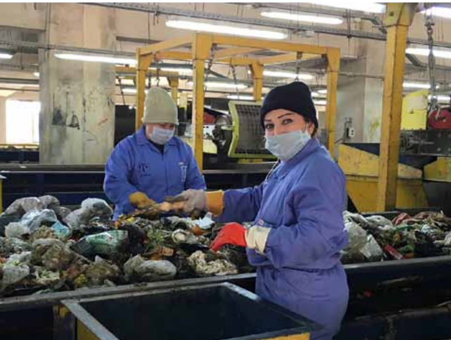
▲ UNDP creates of solid waste removal and disposal jobs to help maintain a clean environment

earn livelihoods and assimilate into cities. The degree to which cities allow space for and encourage informality is important to consider when fostering a climate of entrepreneurship. Allowing space for informality encourages a business climate that drives job creation and innovation. Balancing the vibrancy and diversity of informal businesses against the need for structure and efficiency is a delicate choice that many growing cities grapple with.