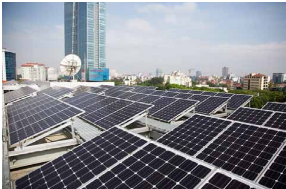
▲ Solar photovoltaic rooftop installations in Hanoi

These choices raise the question not just about the financial calculus of these investments in sustainable and resilient energy systems, but also about the added policy and technical complexity of planning for and instituting municipal codes for energy efficiency and incentive mechanisms or policies for renewable energy investments such as feed-in-tariffs. These complexities often lead capacity-constrained developing countries to opt for well-tested solutions such as grid