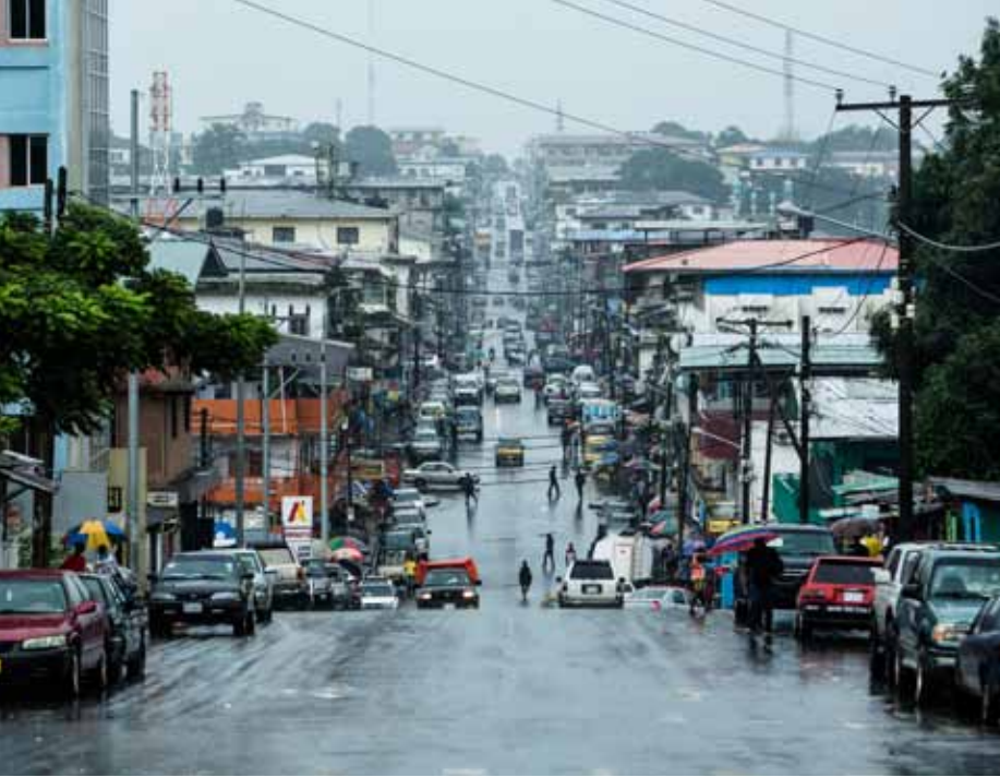
▲ Monrovia, Liberia, during Ebola quarantine

ment 61 recognizes that cities are the primary destination for most migrants and that a sustainable response to migration pressures therefore needs to focus on strengthening the municipal, economic and social capacities of cities to accept (and, where necessary, integrate) large numbers of migrants from different socio-cultural and economic backgrounds. This requires not just basic services (housing, health care, education, jobs), but also a broader approach that includes addressing inclusion and the risk of conflict, equity, voice and participation, fiscal planning and development financing systems, economic development, national and regional coordination, and joint action mechanisms.