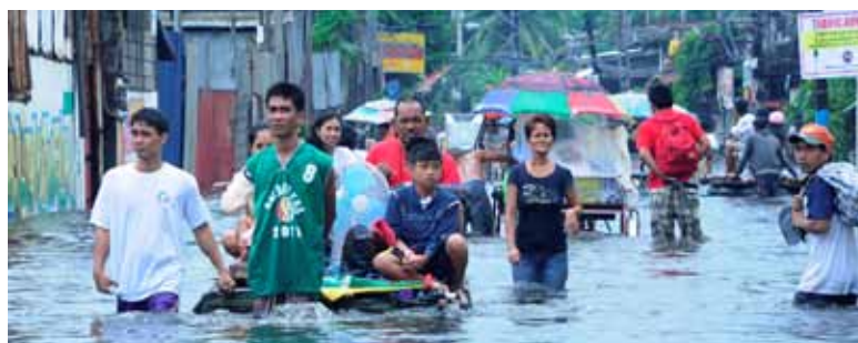
▲ Obandeños walk in the flooded streets of Obando, Bulacan, in the aftermath of Typhoon Ondoy (Ketsana). UNDP is working to decrease Filipinos' vulnerability to natural hazards and increase their resilience.