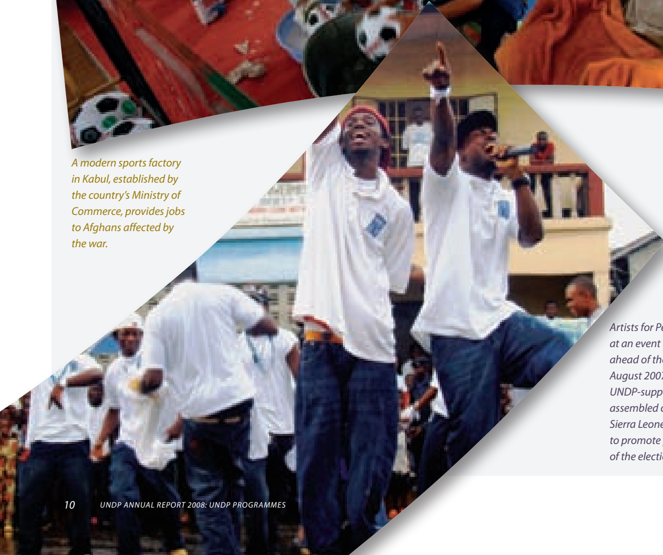
Artists for Peace perform at an event in Sierra Leone ahead of the historic August 2007 elections. The UNDP-supported initiative assembled over a dozen Sierra Leonean musicians to promote peace ahead of the elections.