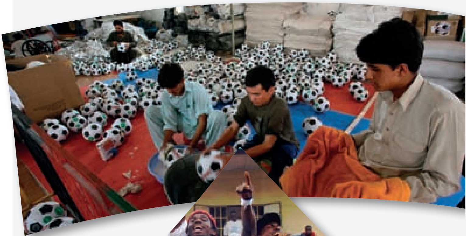
A modern sports factory in Kabul, established by the country's Ministry of Commerce, provides jobs to Afghans affected by the war.