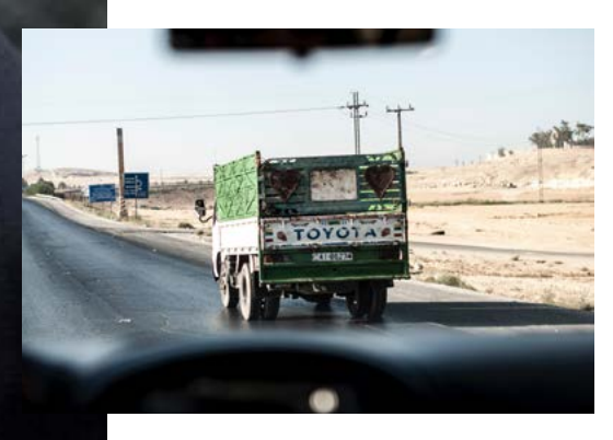
Driving in Syria.

I was sad hearing that. Women under ISIS are meant to be a 'baby factory'. They go after girls who have only just had their period for first time. They want to make many children and then teach them to be terrorists. There are many women who were passed from fighter to fighter, stuck in a cycle like a rotating trophy. That disgusted me. I came to the conclusion that ISIS was really not Islam.