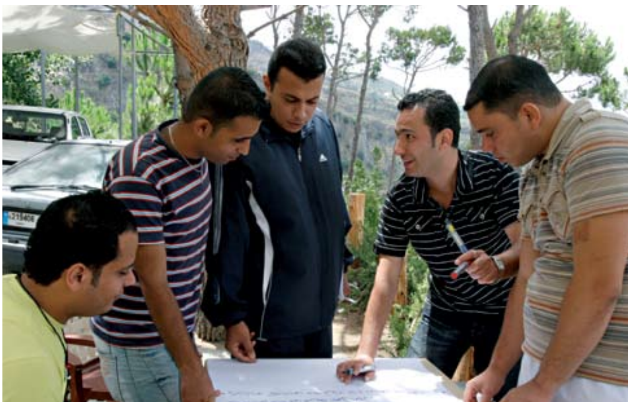
In partnership with the Governments of Italy and Lebanon, UNDP is supporting dialogue between Lebanese and Palestinian youth in the country's northern region.

in the use of the system and the database was linked to the country's Corporate Affairs Commission for regular updates on newly registered companies. The project also published a report that provided an analysis of collected taxpayer data, a listing of potential taxpayers and strategies for improved tax compliance.