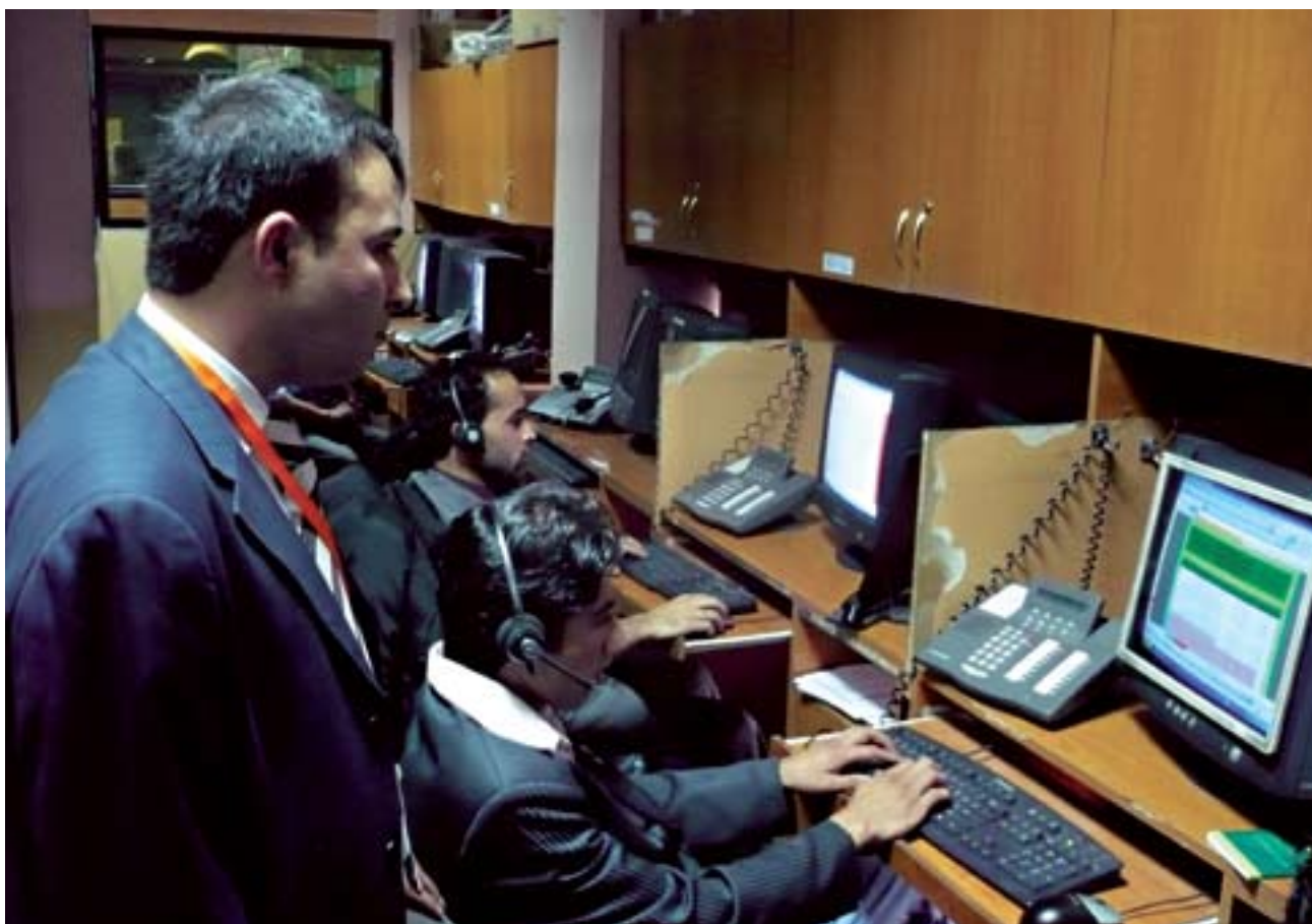
A UNDP-supported election call centre in Afghanistan received nearly half a million calls by the end of 2008.

UNDP has a number of initiatives that address governance issues on both a broad regional level, as well as national and local levels. In 2008, UNDP provided a combination of technical, financial and policy support to nascent or struggling democracies, including the Maldives , Papua New Guinea and Tanzania . The Deepening Democracy in Tanzania