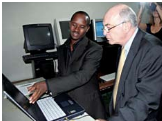
Former Administrator Kemal Derviş visiting a joint UNDP and Microsoft initiative in Rwanda that is developing the capacity of technical support units serving the Parliament.

In Viet Nam , the UN began a policy-level engagement on climate change, recognizing that Viet Nam is one of the countries most affected by climate change effects, especially sea-level rise, as highlighted in UNDP’s 2007/2008 Human Development Report Fighting Climate Change: Human Solidarity in a Divided World . In 2008, the UN contributed substantively to the development of the National Target Programme on Responding to Climate Change, giving technical advice, funding national technical advisers and national consultations and facilitating consultations with the international community.