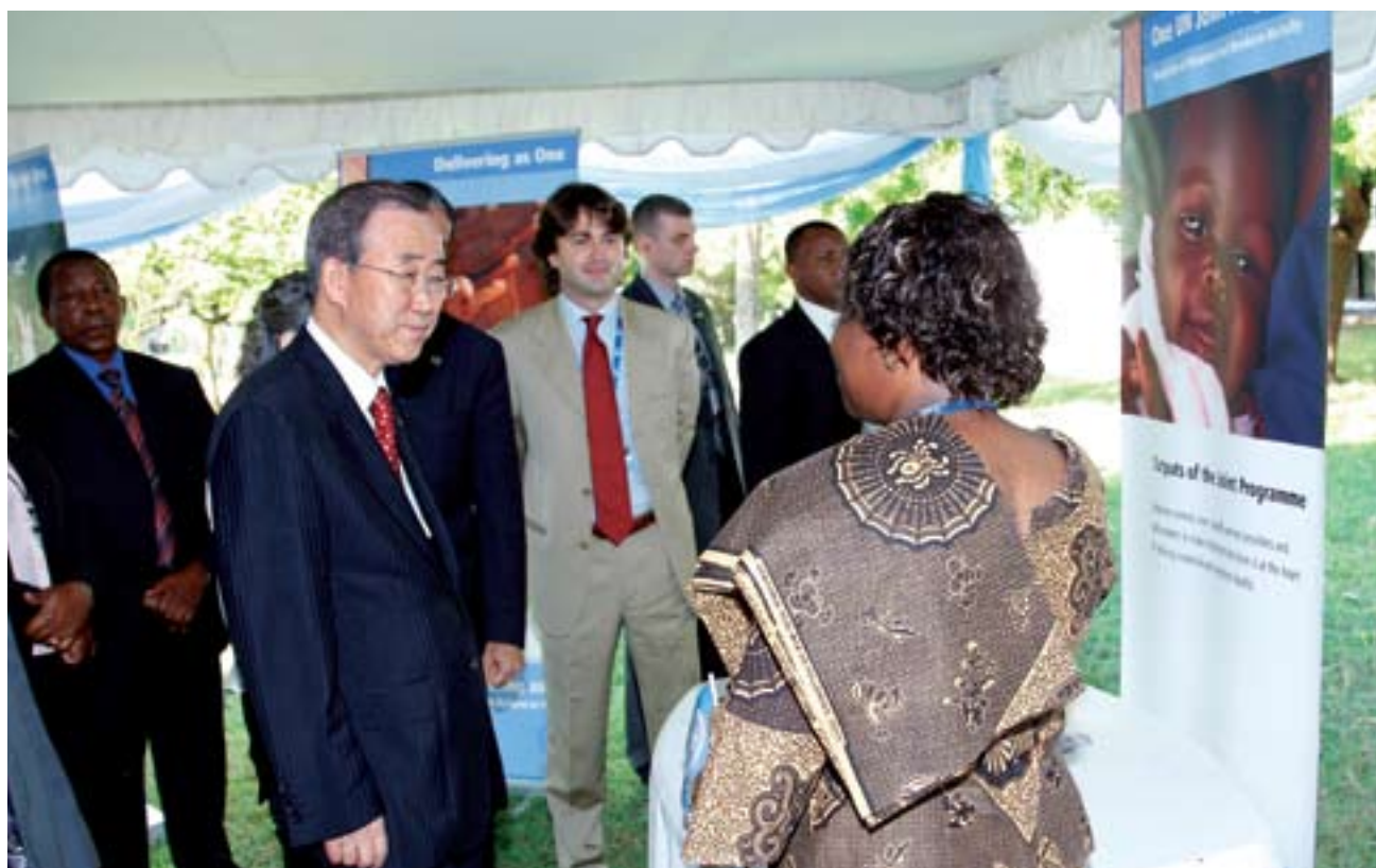
Secretary-General Ban Ki-moon visits a “Delivering as One” exhibition in Tanzania.

As the manager of the Resident Coordinator (RC) system, UNDP, with its UN partners, remains fully committed to ensuring that the UN development system works together more coherently, enabling the UN to be a more effective development partner in contributing to a marked improvement in the lives of the people in the countries it serves. UNDP also recognizes, with its UN development partners, that coherency and effectiveness must be underpinned by national ownership and alignment with national agendas and systems; a process of joint