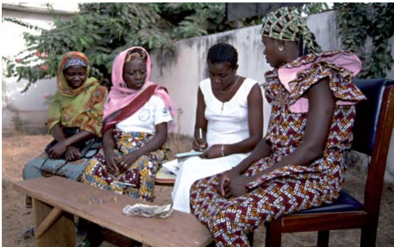
A credit officer from a UNCDF-supported microfinance institution collects loan repayments and advises women entrepreneurs in northern Togo on better business practices.

global partners to address some of the most immediate challenges presented by the food, fuel and financial crises, and will continue to play a lead role in developing strategic options for addressing the longer term implications of these crises. The Strategic Plan is playing a vital part in this, providing a clear and coherent blueprint for UNDP's development action. The Plan will continue to set UNDP's overall strategic vision and development, management and resource priorities and will include, for the first time, specific indicators and targets for development, UN coordination and management results, an innovation that will help keep the organization on track and focused in the challenging times ahead. Specifically, the Plan defines UNDP's operational activities