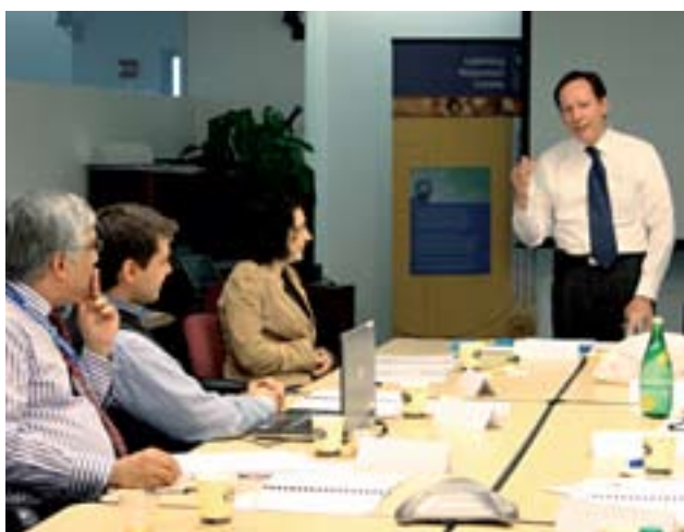
UNDP's Learning Resources Centre conducted dozens of training sessions for staff in 2008.

UNDP's human resource strategy takes as its point of departure a simple conviction: that human resources is about people and people are the core asset of UNDP. It directly responds to internal and external changes that impact the work environment and it addresses the human resources priorities of the Strategic Plan. In order for UNDP to clarify expectations for staff and set clear standards for performance it developed and put into practice a Competency Framework in 2008. In developing a gender action plan, renewed focus has been given to the development and retention of women. The human resources strategy also responds to issues flagged by UNDP's Global Staff Surveys and other staff consultations. The Surveys have reflected high scores in terms of staff pride for where they work and what they do although work/life balance and workplace pressure remain a key staff concern. Improvements during the Strategy period will build on advancing flexible working arrangements as well as on staff well-being initiatives like improving work/life balance and UN