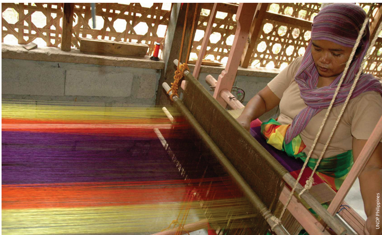
UNDP programmes support livelihood initiatives for indigenous women in conflict-affected communities in Mindanao, Philippines.

The peace accords were signed by the last armed group in Burundi in April 2009. Since then, UNDP has supported the socio-economic reintegration of ex-combatants and other groups by providing 496,300 work days of employment rebuilding rural roads. To boost the capital invested in agriculture and livestock production and marketing, UNDP, with BCPR funding, provided savings associations with grants. Following a wave of violence in southern Kyrgyzstan in June 2010 that displaced 400,000 people, UNDP quickly launched a cash-for-work programme in the most-affected cities. 1,500 women and young people in the cities of Osh and Jalalabat were engaged in short-term jobs repairing roads, cleaning up irrigation systems, removing litter and restoring