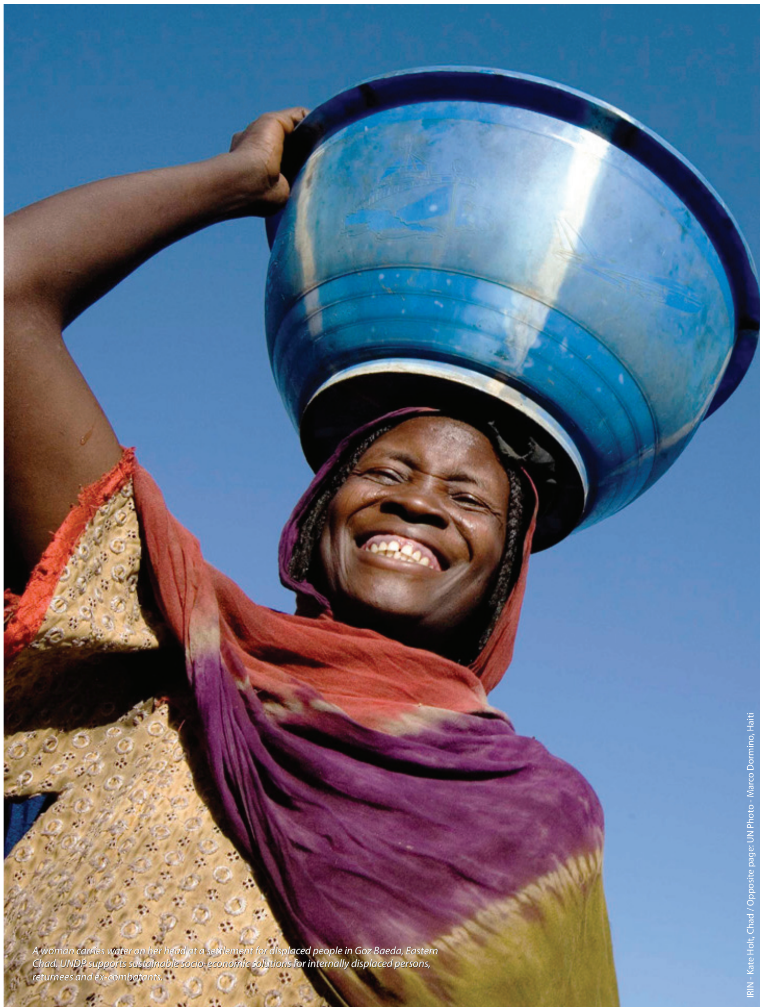
A woman carries water on her head at a settlement for displaced people in Goz Baeda, Eastern Chad. UNDP supports sustainable socio-economic solutions for internally displaced persons, returnees and ex-combatants.