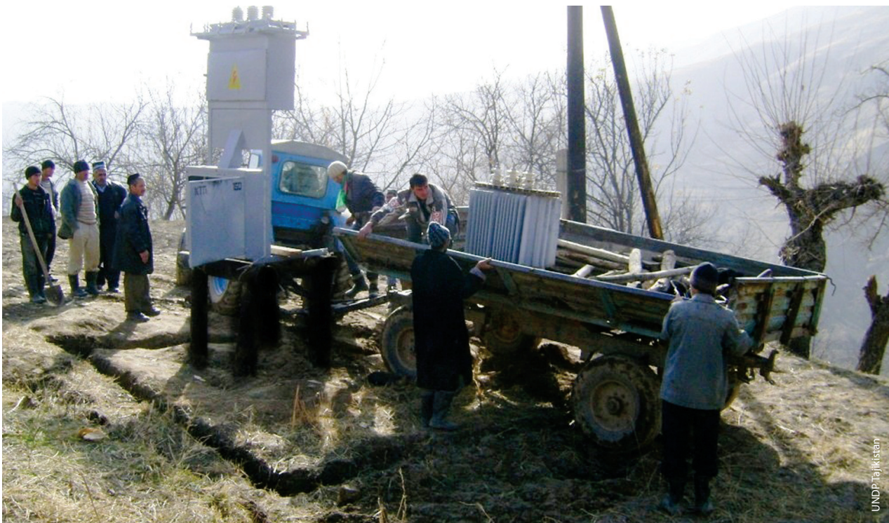
UNDP helps countries in their efforts to restore community infrastructure. In Tajikistan, 144,000 inhabitants of 39 rural settlements have been supported to rehabilitate social infrastructure, such as with this electrical transformer in Rasht district.