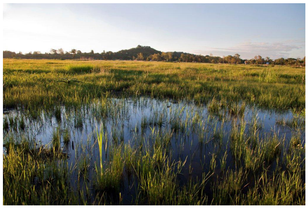
Monavale Vlei in Harare. Wetlands are natural water reservoirs, (Photo - www.monavalevlei.com)

Focusing on the issues that sorround water and wetlands, UNDP will commemorate the World Environment Day (WED) in Block II on 25 June, 2014 under the theme "Wetlands and Waters: a Combination for Life"