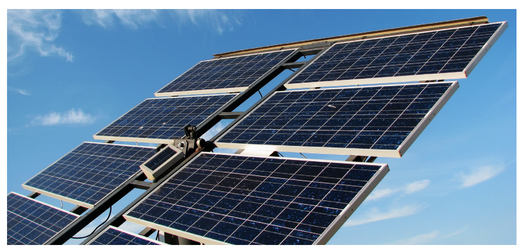
When installed, the solar system will use panels to generate electricity.

In a bid to reduce energy costs and carbon footprint, the Country Office (CO) is taking the next steps to installing solar photovoltaics (PV) technology in Block 10. The move will bring the CO operations at par with international best practice in promoting low emission and climate-resilient development as advocated for by UNDP globally.