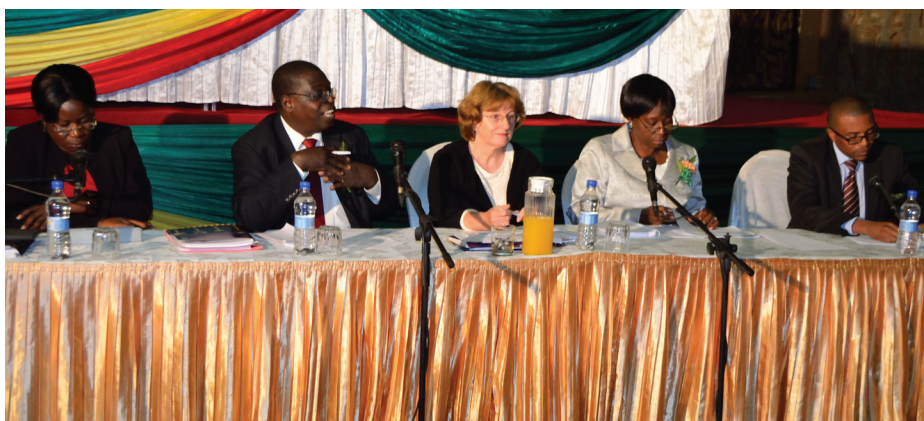
Ms. Constance Chigwamba, Permanent Secretary in the Ministry of Education, Sports, Art and Culture, second from right and other panelists during the launch of the 2012 MDG report and the Accelerated Action Plan on MDG2

The meeting proposed to form an Inter-Ministerial Committee to guide the preparation of a country position on Post-2015.