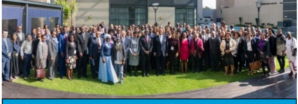
UNDP brings together more than 100 participants for SDG rollout workshop.

"These twin development agendas, Sustainable Development Goals (SDGs) and Agenda 2063, are not about the United Nations and the African Union respectively, but the common desire to emancipate the people of the continent and the world from poverty, and Africa's Agenda 2063 that seeks an