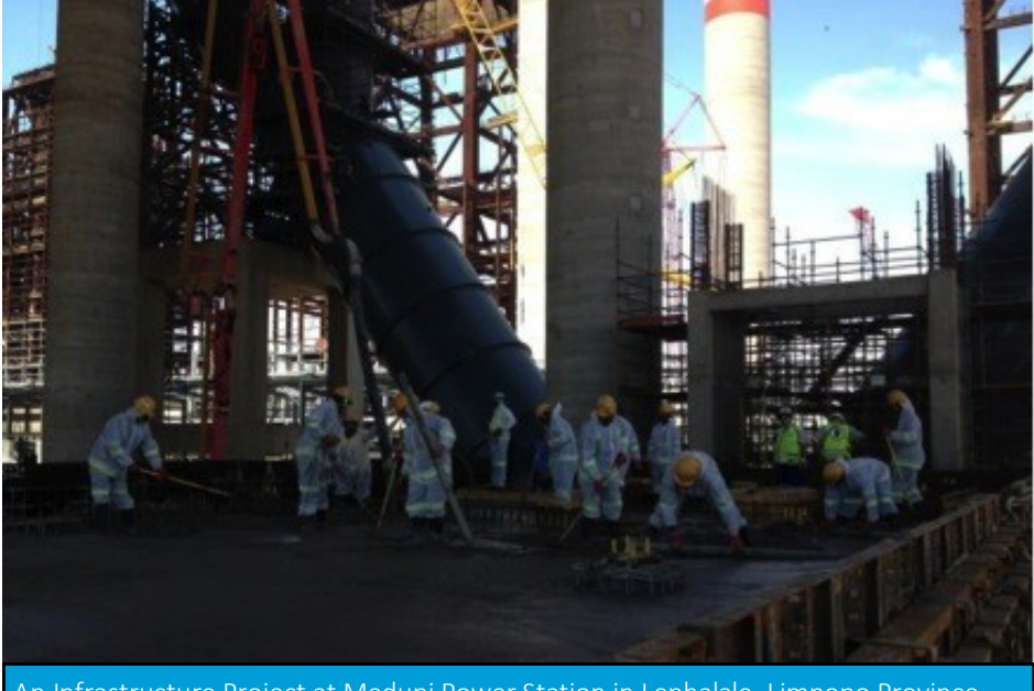
An Infrastructure Project at Medupi Power Station in Lephalale, Limpopo Province. Photo: Roman Crookes, Project Director, Medupi Power Station, 4 November 2014. Construction

Accordingly, the AfDB and UNDP's Regional Service Centre for Africa have partnered in the implementation of the Health, Gender and Capital Projects initiative. The objective of this project is to stimulate increased access to health, HIV and gender services for construction/migrant workers as well as women and girls within project sites and project communities during and after the execution of large capital projects, including Through this project much awareness has been the extractive sector. The ultimate goal is to raised and continues to be generated around