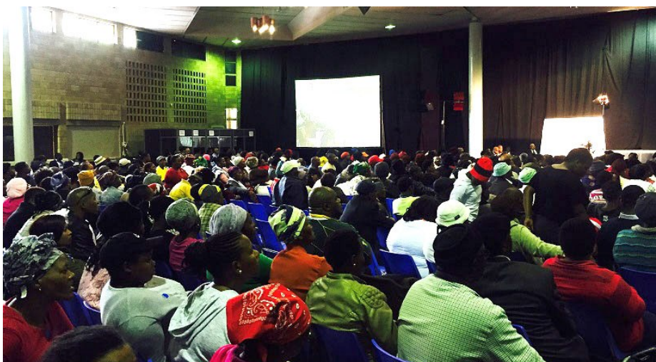
Part of the audience captured at the Eastern Cape consultations

"We have cultural practices like ukuthwala, girl abduction for early marriage and ukuhlola,