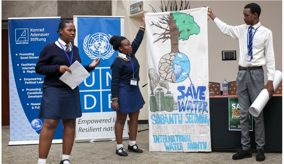
The winning team from Sobantu Secondary School . Photo: SAIIA

Participants on the programme are provided unique and often life changing opportunities to engage with different stakeholders from