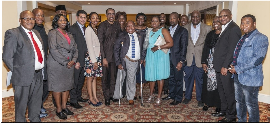
UN delegation and government officials present at the National Strategic Plan launch

In July 2016, South Africa hosted the 21st International AIDS Conference 2016 (IAC 2016) opened on 18 July in Durban, South Africa. Under the theme “Access equity rights now,” the conference echoed UN’s call to leave no