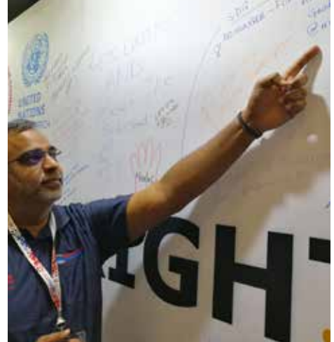
UN in South Africa joint exhibit with SANAC and the SA Government on "Innovating for Rights" including a virtual reality film about HIV-related stigma and discrimination.