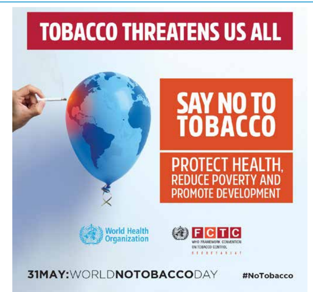
"Tobacco threatens us all" poster

Some studies link ENDS use to smoking cessation, but others contradict this and suggest they attract new users, especially the young. Currently, there is not enough evidence to support the use of ENDS as smoking cessation aids, and most people use them in addition to other