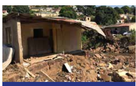
Destruction caused by floods in Durban.

The UN in South Africa team visited some of the affected areas in KwaZulu-Natal and the Eastern Cape provinces pledging support and solidarity with the leadership and the people affected by the floods. The organization donated sleeping mats, blankets, dignity packs and torches to the municipalities assisting those affected who are either in community shelters or have returned to what is left of their homes in the affected areas. Flash lights, though small and often deemed insignificant, were some of the necessities as families narrated how the severe rains and subsequent flooding resulted in power outages and family members were unable to locate each other. Some explained was that was how children and their parents were washed away as water filled homes.