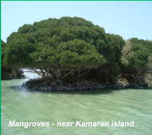
Mangroves - near Kamaran island

its key national stakeholders, both at the policy and community levels, UNDP is currently working on an overall policy framework that integrates environmental management into national development and poverty alleviation policies and programmes. UNDP is also supporting the Government of Yemen to enable national authorities to implement a wide range of international environmental conventions and instruments.