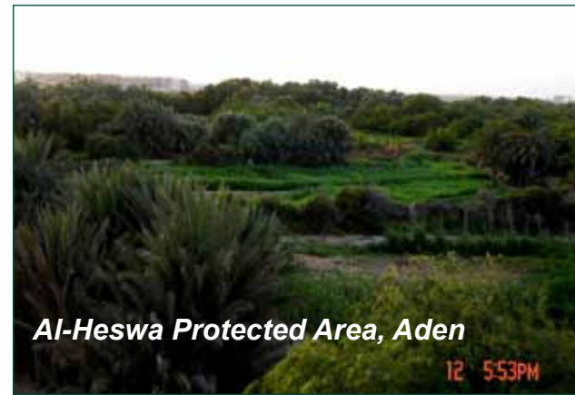
Al-Heswa Protected Area, Aden