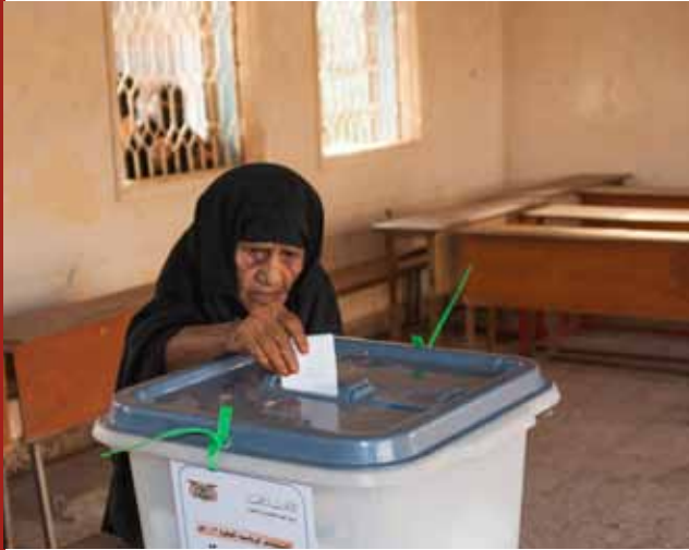
An elderly woman casts her ballot in a voter registration in Marib, as part of the UNDP-supported Early Presidential Elections in Yemen for 2012.

UNDP targeted voter education for women across Yemen for the Early Presidential Election of 2012