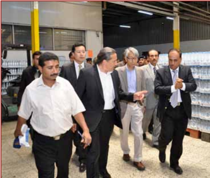
Bridge the gap between youth and the private sector

In Yemen, in support of the Government of Yemen and the Yemeni people, UNDP and the Government of Japan: