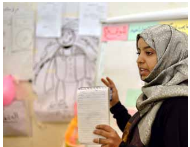
Intisar believes women in Yemen can work as painters exactly like men

"Women as painters" is a new challenge implemented in Sana'a by the Youth Economic Empowerment Project (YEEP) in partnership with For All Foundation.