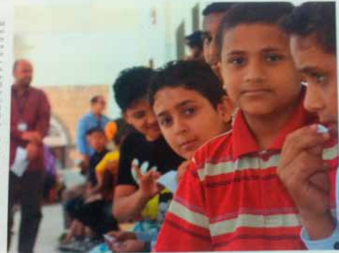
Yemeni school children learned first hand how the new electronic system would work.