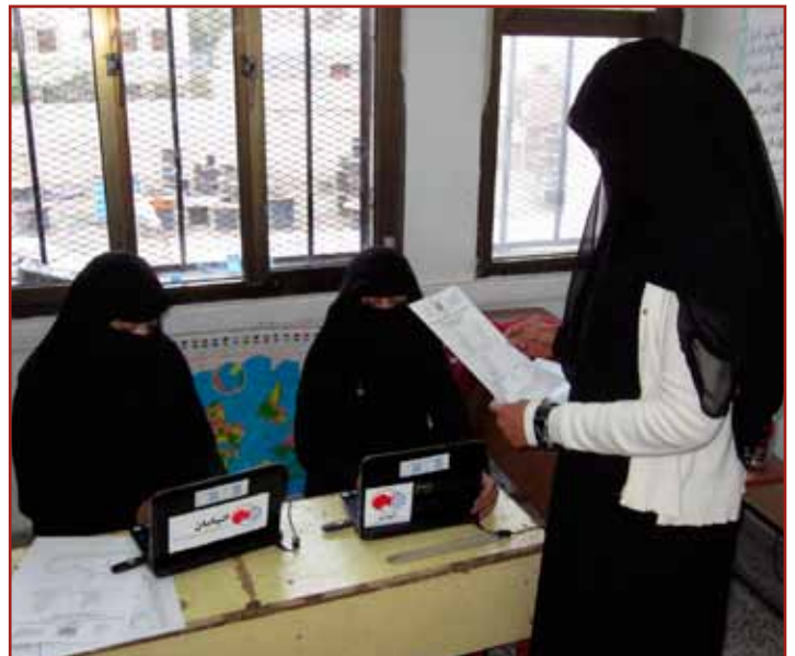
Elections Support for Enabling Change