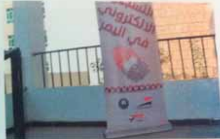
Though not without its faults, electronic voter registration will be used in Yemen as the country transitions into a democratic system.