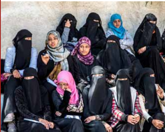
Women painters during the training discussions

"It is the first time people see women painting walls to earn a living," says al-Siraji, "but it supports my arguments with many people that women can adapt to any situation. Actions speak louder than words."