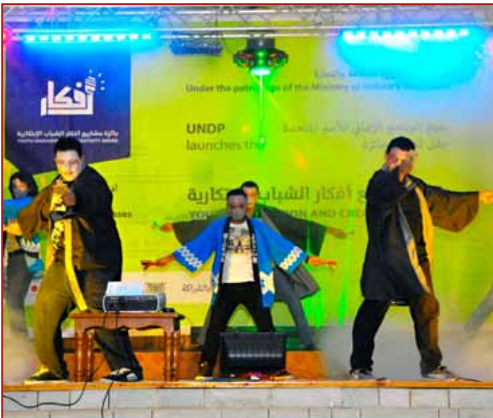
Foster innovation and youth entrepreneurship