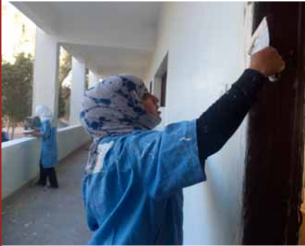
Woman Painters do not only fight unemployment, they also challenge gender stereotypes

At the far corner of the rigid walls of the 7 of July Girls School, 17 young women with blue jackets painting diligently these walls. Young women are engaged in a two-months painting activity and they are paid on a daily basis as part of a new approach called "3x6", launched by the GoY through its Youth Economic Empowerment Project with support from UNDP and the Government of Japan, which aims to create sustainable employment.