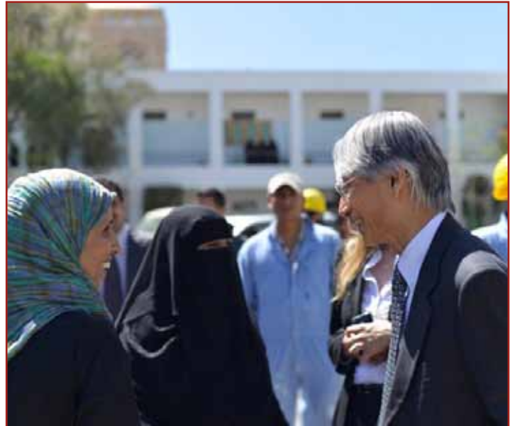
Tackle the root causes of conflict in creating employment for Yemeni youth