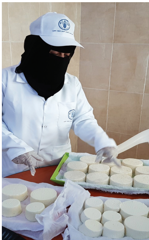
FAO through ERRY JP improves animal health and milk production in Yemen.

2. The Resilience based interventions are complement the humanitarian relief interventions by protecting livelihood assets and creating livelihood opportunities of crisis affected households that are not targeted by relief aid. It can reduce protracted humanitarian situation to be occurred by providing opportunities for the sustainable livelihoods. Moreover, resilience interventions build foundation for the post conflict recovery, return and to the sustainable development. Integrating a resilience-building approach within humanitarian operations is equally crucial to support community livelihood and recovery system.