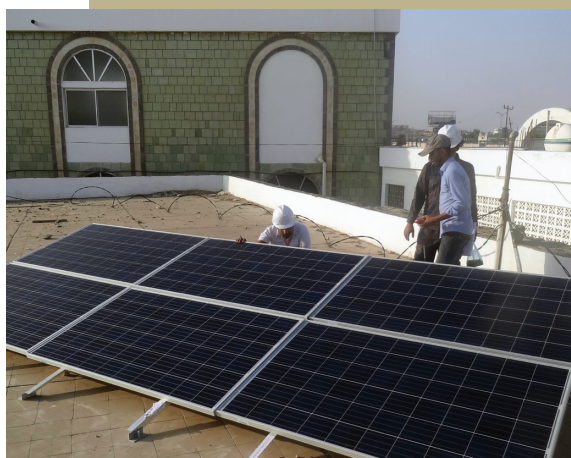
Installing Solar systems to bring health centers back to life, serve communities and improve health basic services.