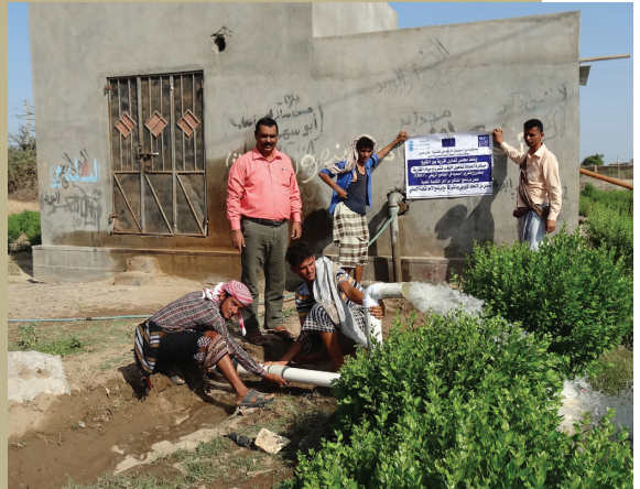
Village Cooperative Council implementing one of the community self-help initiative in Habil Jabr District, Lahj Governorate.