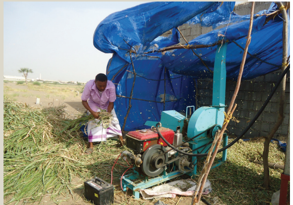
ERRY JP supporting farmers create small businesses.

ERRY CASH FOR WORK – Bait Alfaqih District, Hodeida Governorate