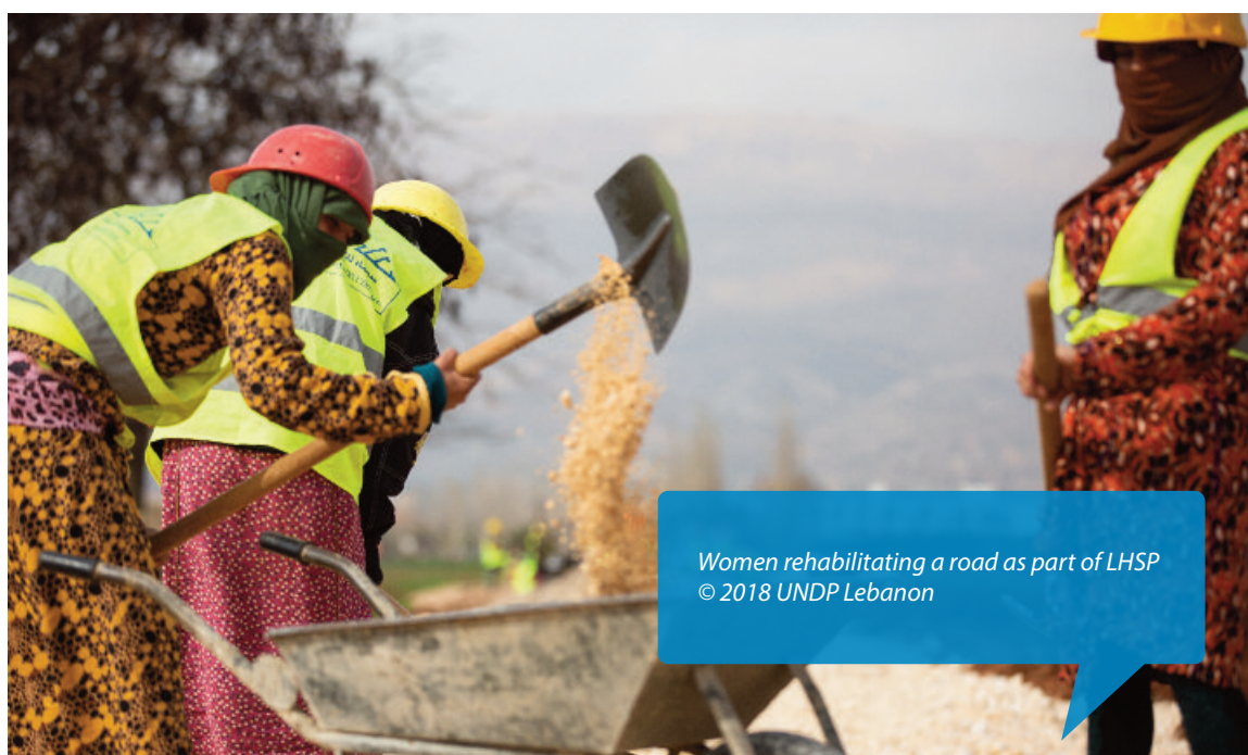
Women rehabilitating a road as part of LHSP

In Burundi , UNDP supported the return of IDPs and refugees between 2012-2013 through community-based reintegration. This included cash for work activities, creating more than 600,000 working days for over 9,000 participants (43% of whom were women); along with social cohesion measures through dialogue and conflict mitigation. Eighty-eight per cent of the cash-for-work participants chose to invest their individual savings into joint economic initiatives, secured a sustainable income and became financially self-reliant; and almost 2,200 beneficiaries (60% of which are women) set up their own small and medium enterprises.