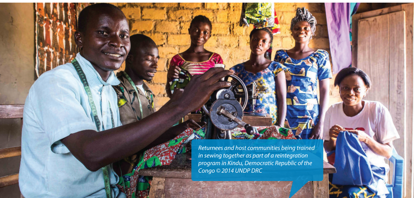
Returnees and host communities being trained in sewing together as part of a reintegration program in Kindu, Democratic Republic of the Congo

In the 2019-2020 Regional Refugee Response Plans for the Democratic Republic of Congo situation 16 and the Nigeria Situation 17 , UNDP and UNHCR work together in ensuring that important life-saving humanitarian and protection assistance are combined and planned with development interventions that build resilience in the short, medium and long term.