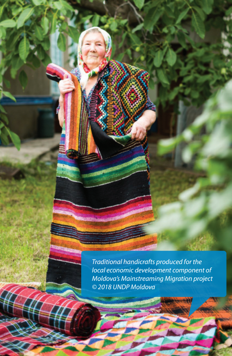
Traditional handicrafts produced for the local economic development component of Moldova's Mainstreaming Migration project