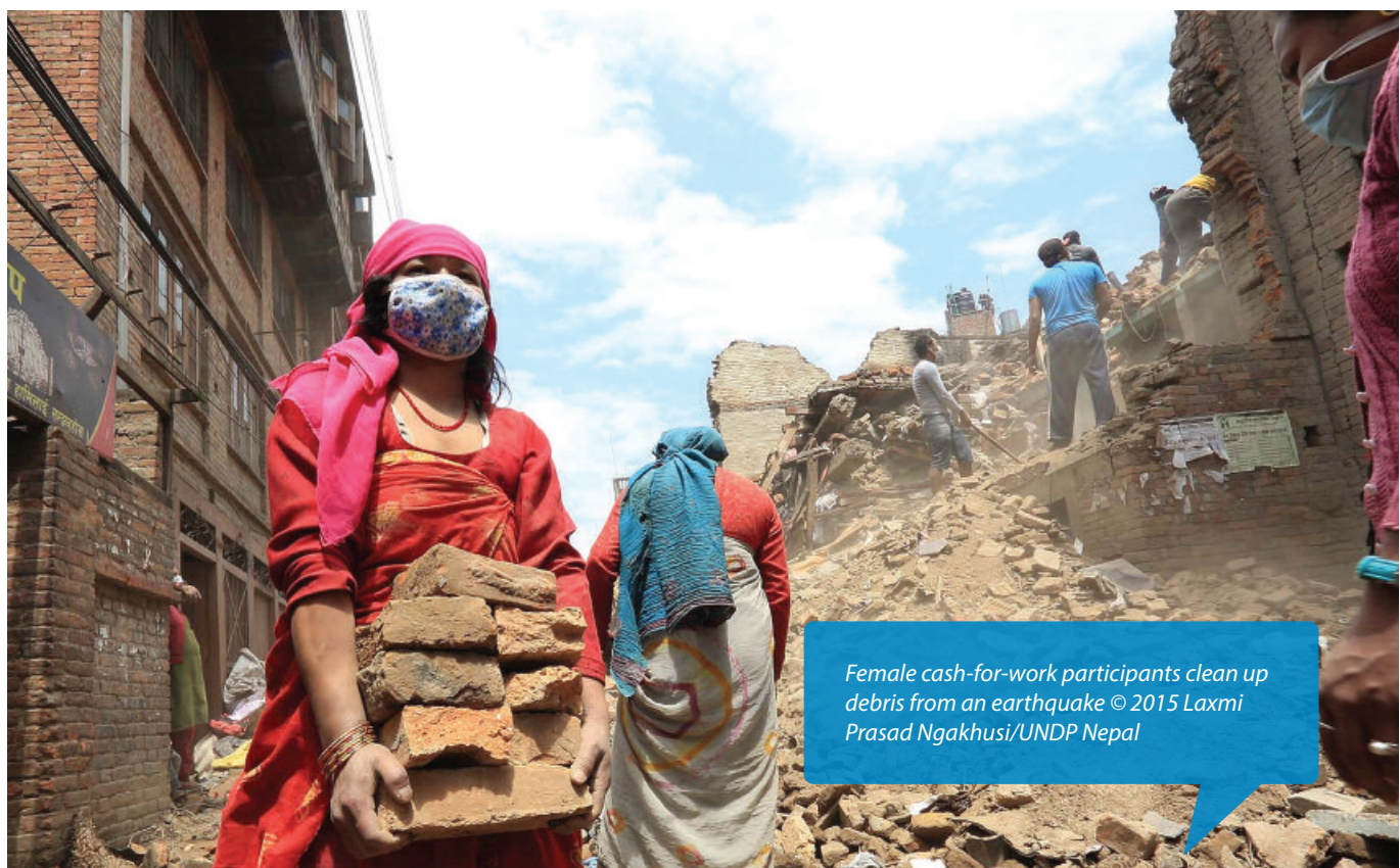
Female cash-for-work participants clean up debris from an earthquake

Furthermore, UNDP recognizes that migrants, refugees and IDPs may face many common challenges and similar vulnerabilities. They are all entitled to the same human rights and fundamental freedoms, which must be respected, protected and fulfilled. While migrants, refugees and IDPs all may be particularly vulnerable to the risk of violations and abuses of their rights, only refugees are entitled to additional protections under international refugee law. As UNDP supports the implementation of migration and displacement policies and programmes, it is guided by international laws and