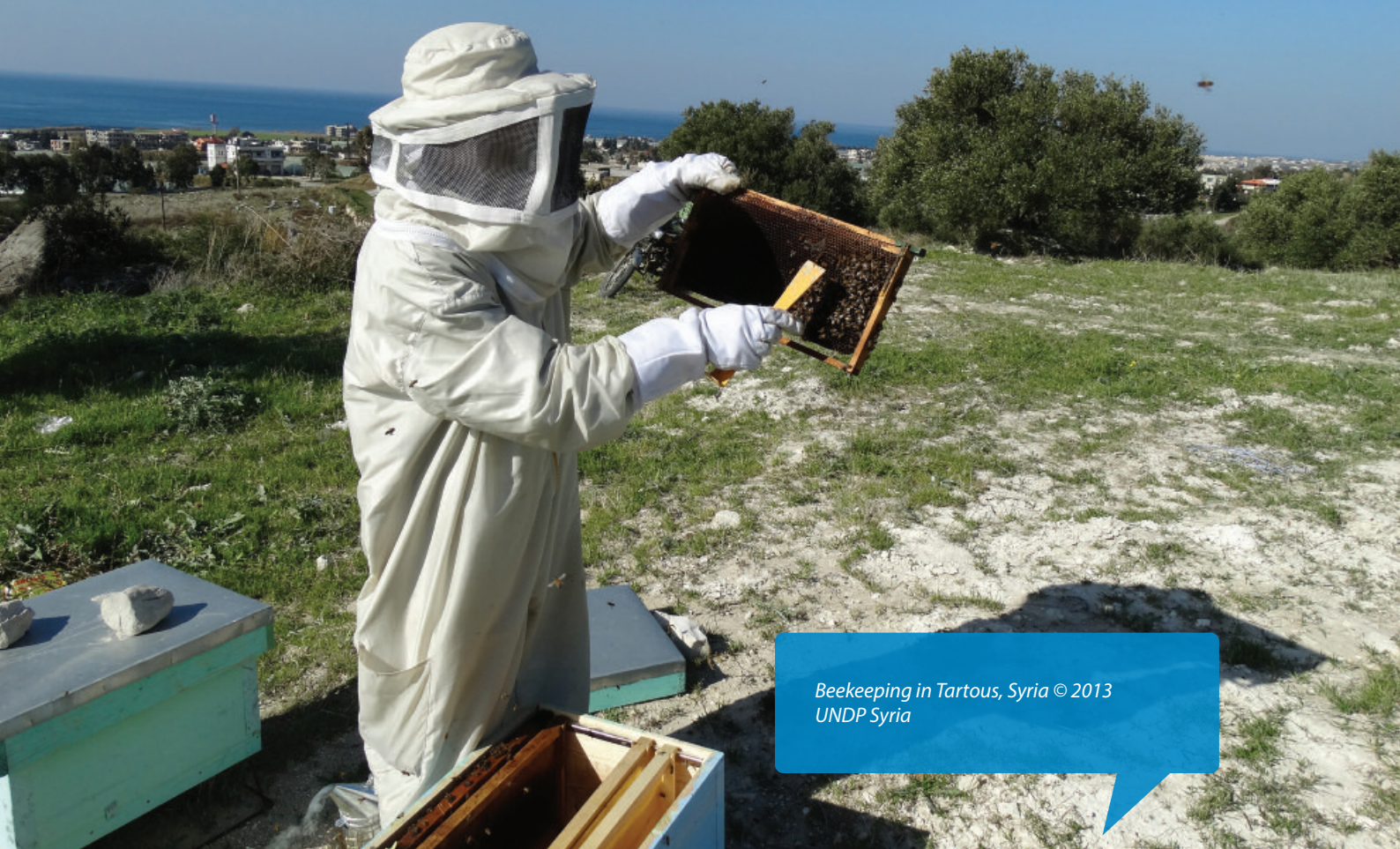
Beekeeping in Tartous, Syria