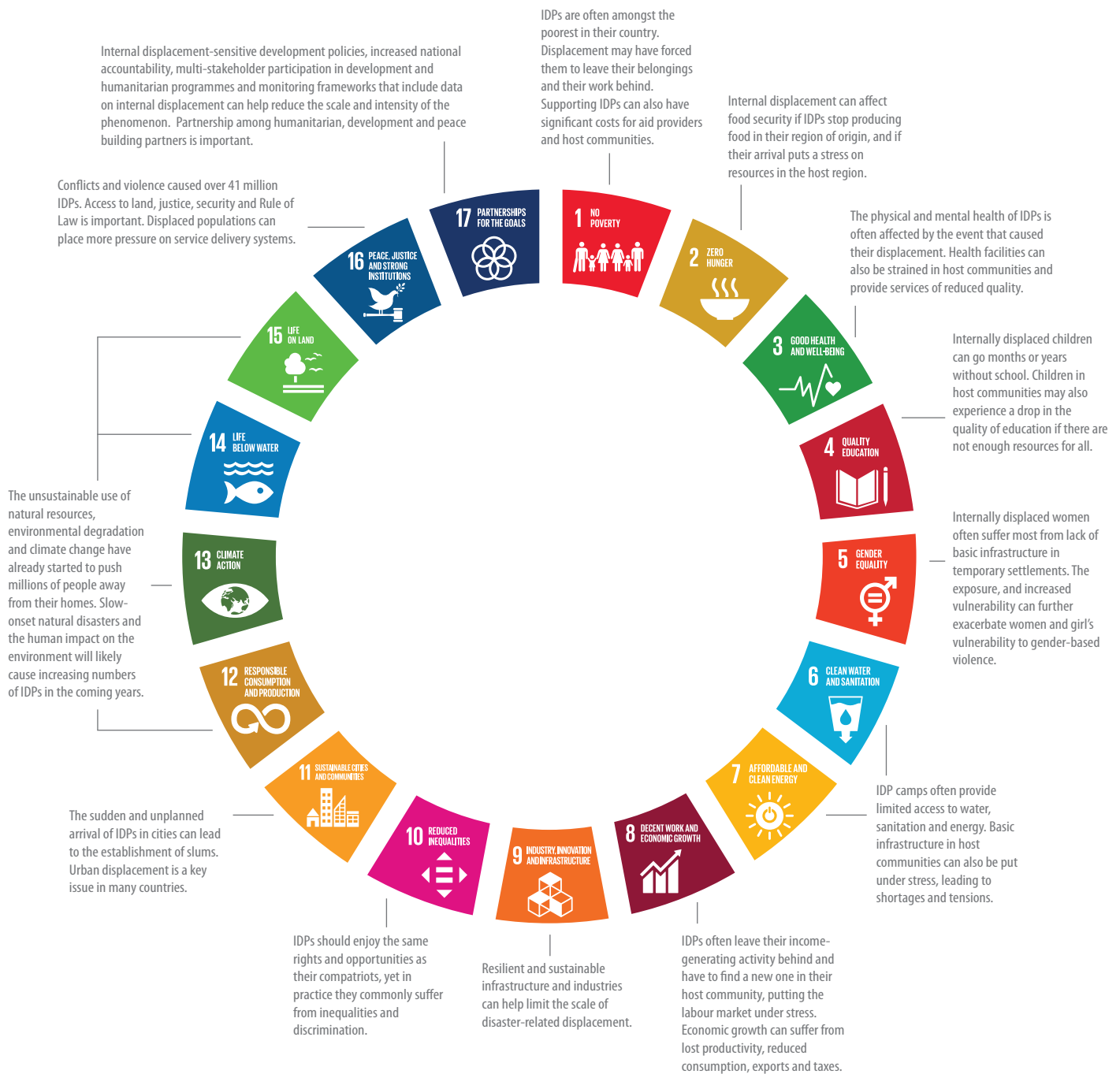
Figure 2 | Relevance of each Sustainable Development Goal to internal displacement and vice versa 7

In line with the UNDP Strategic Plan 2018-2021, by focusing on the four specific areas (see page 5), UNDP helps countries to achieve sustainable development by eradicating poverty in all its forms and dimensions, accelerating structural transformations for sustainable development, and building resilience to crises and shocks. Among others, our comparative advantages lie in ensuring that migrants, refugees and IDPs are included in our programmes on poverty reduction (SDG 1), Decent work and economic growth (SDG 8), addressing inequalities (SDG 10), climate change (SDG 13), peace and justice strong institutions (SDG 16), and building partnerships for the SDGs (SDG 17) (see Table 1 and Figure 2 for more on SDG linkages).