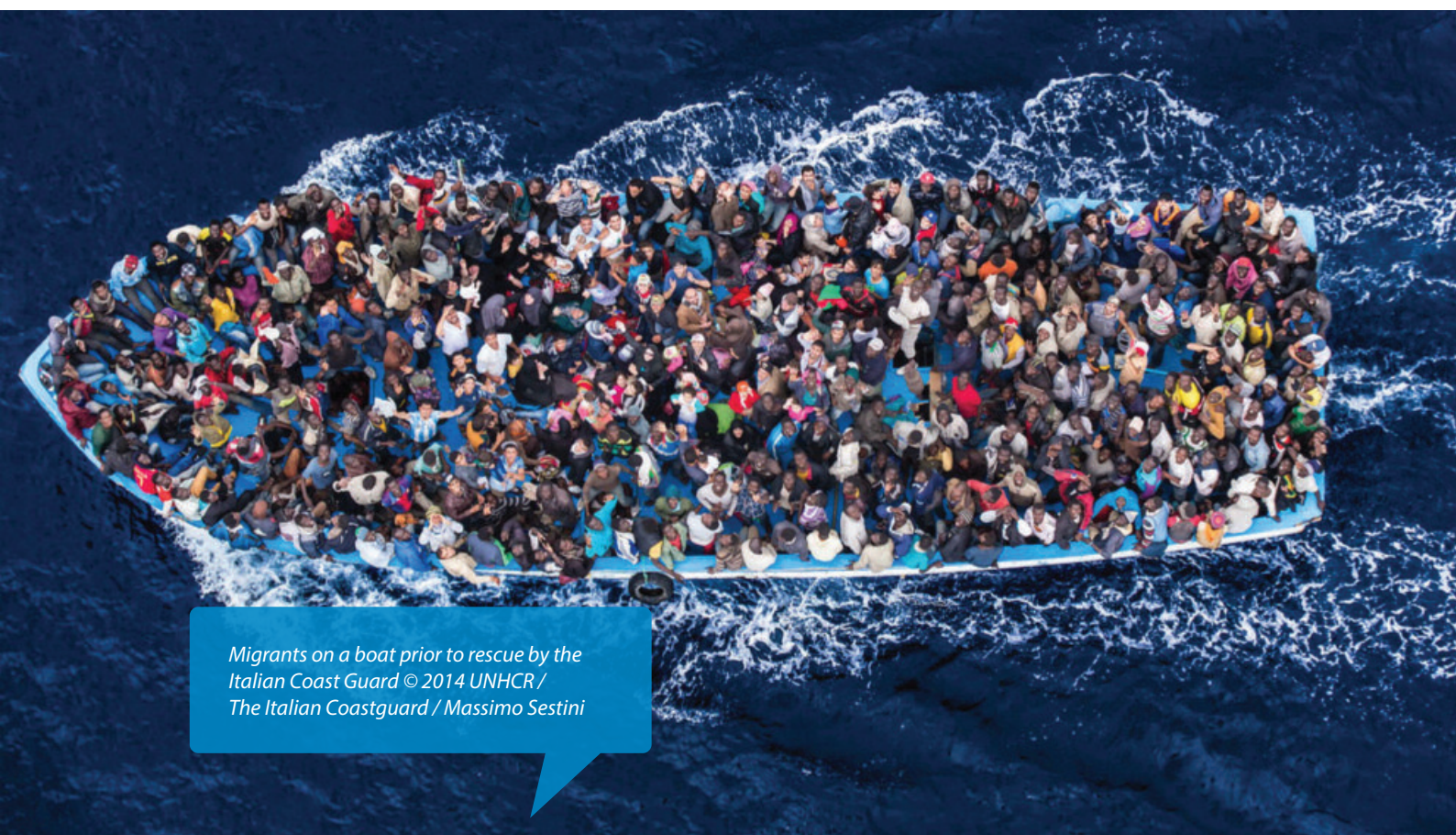
Migrants on a boat prior to rescue by the Italian Coast Guard

Furthermore, both rapid onset and slow onset climate stresses are also leading to displacement and population movement. Rapid onset disasters such as floods, storms, earthquakes, volcanic eruptions and wildfires have led to 24.2 million people being newly displaced in 2016 2 . In addition, slow onset climate stress caused by rising sea level, increasing drought, or accelerating desertification can also drive displacement when combined with economic, social and political factors. While it is conceptually and practically difficult to establish a precise category of environmental or climate migrant, the Nansen Initiative Platform on Disaster Displacement 3 is seeking to find ways to address the needs of these groups of migrants.