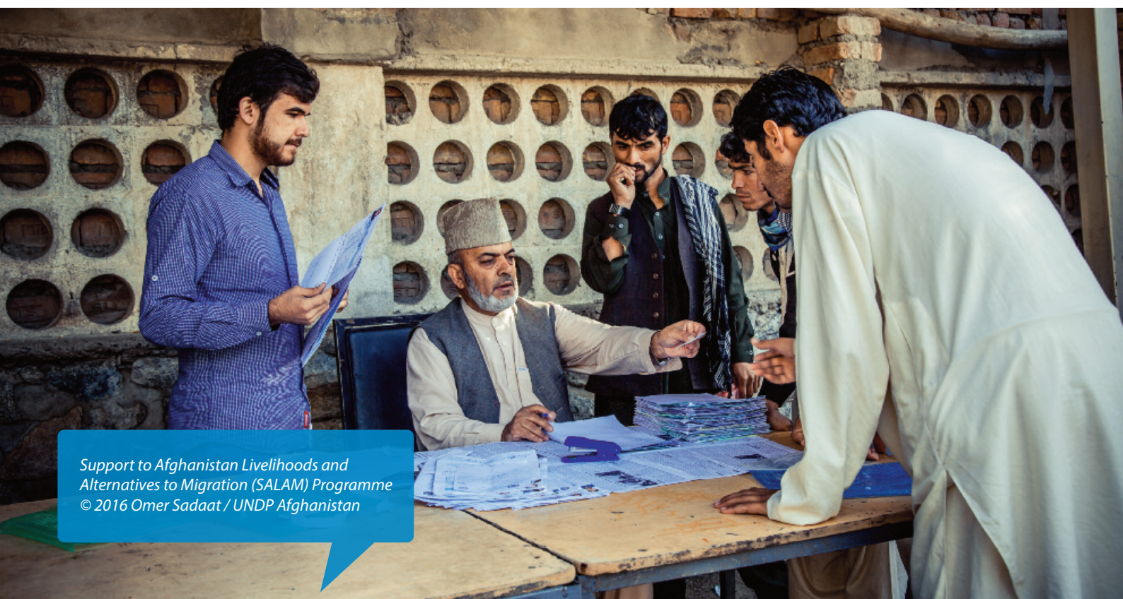
Support to Afghanistan Livelihoods and Alternatives to Migration (SALAM) Programme