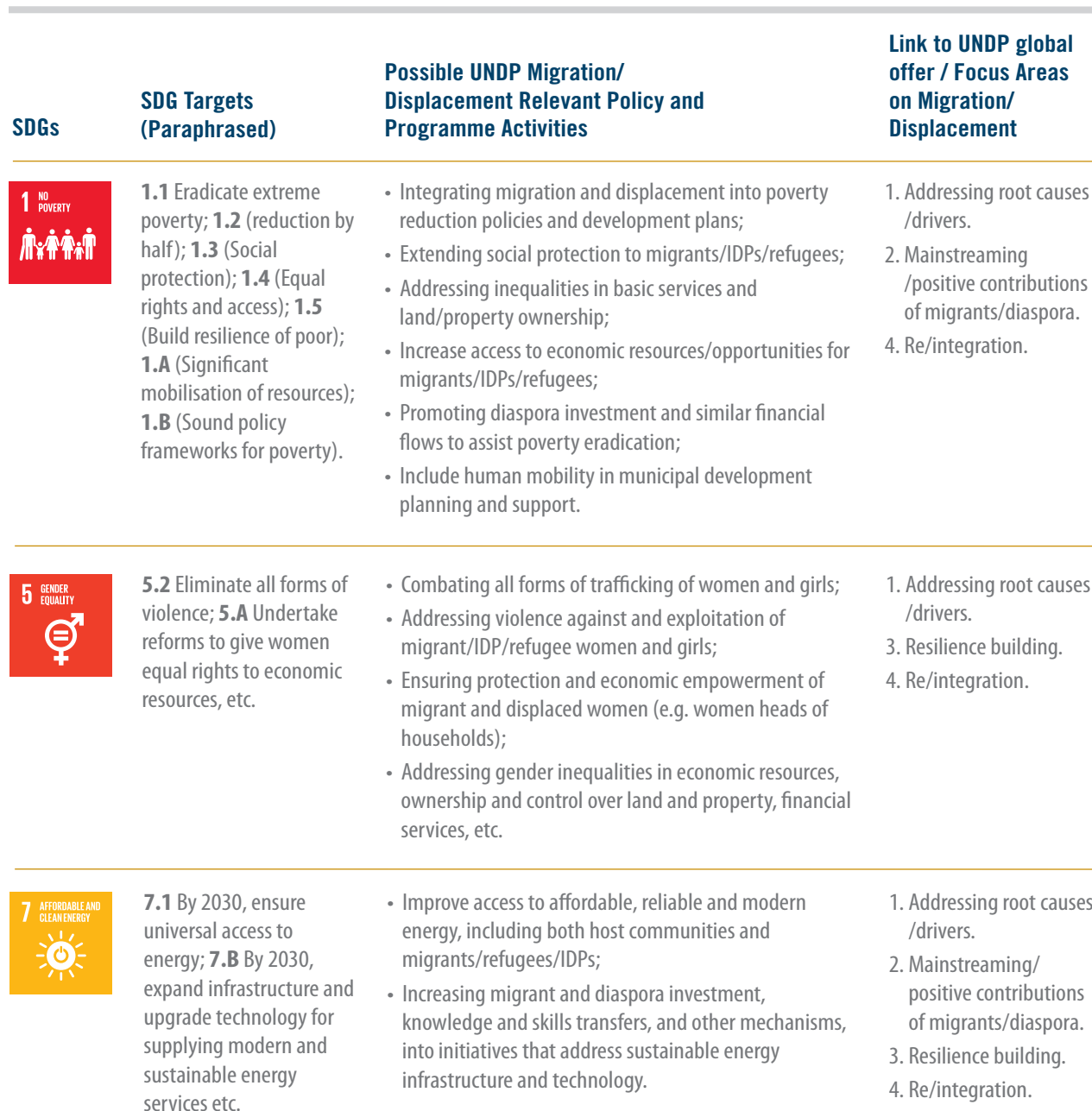
Table 1 | SDGs and Indicative UNDP’s Migration and Displacement Policy and Programming

conventions, 4 e.g. the 1951 Refugee Convention and its 1967 Protocol and related Regional Conventions, International Convention on the Protection of the Rights of All Migrant Workers and Members of Their Families, and guiding principles such as the Guiding Principles for Internally Displaced Persons, among others. UNDP supports member states in their commitment to protecting the safety, dignity, human rights and fundamental freedoms of all migrants at all times, regardless of their migratory status.