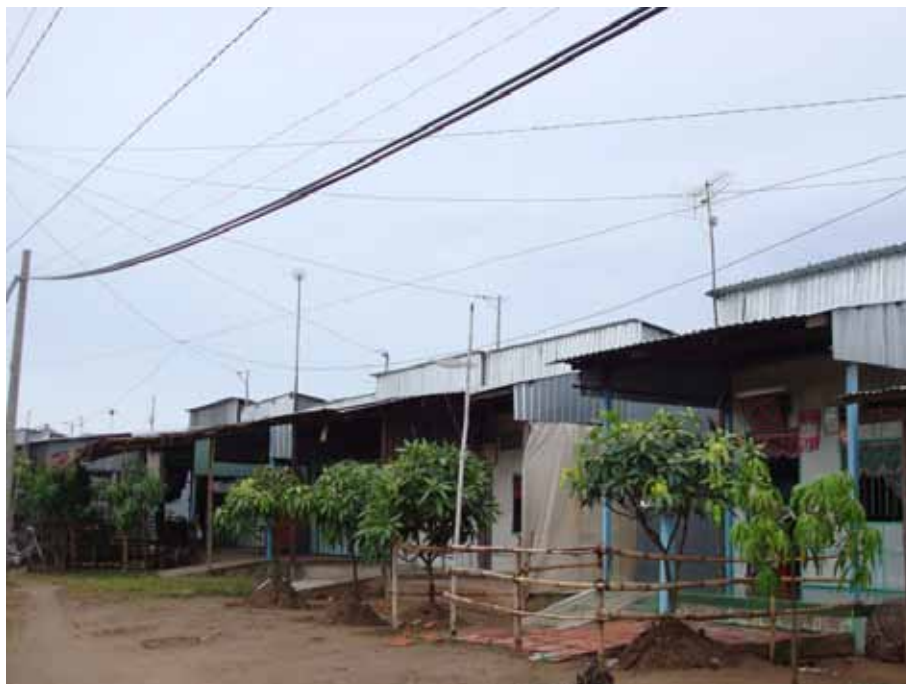
Figure 4. A residential dyke in Long Thuan commune, Hong Ngu district, Dong Thap Province

Residential dykes refer to raised areas along rivers, canals, and ditches, where small boats can be moored, and historically have been the most popular type of location for houses in the Mekong Delta. Residential clusters refer to areas where houses are clustered in groups on raised land. According to government documents, a residential cluster has a size of two to three hectares; is for 100 to 200 households; is adjacent to rice fields; is suitable for habitation and livelihood activities; and has access to basic facilities and infrastructure (clean water, schools, and health clinics). Residential dykes provide less land than clusters, but marginal lands near dykes enable households to cultivate home gardens and raise livestock to increase household income. (Fforde et al. 2003; Danh and Mushtaq 2011; Chun and Sang 2012)