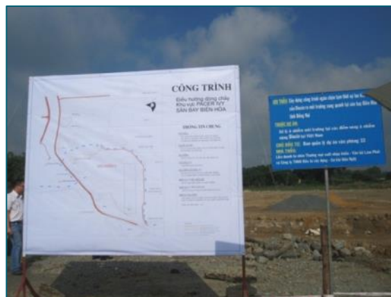
Bien Hoa Airbase interim measures construction, photo taken in 2013

“The Phu Cat landfill and containment measures at Bien Hoa Airbase, through providing interim benefit, were the most significant activities of the project. The dioxin project proved the determination of the Government of Viet Nam, the efforts of local organizations, and the attention and support from international communities in addressing the need for remediation of dioxin contaminated areas.”