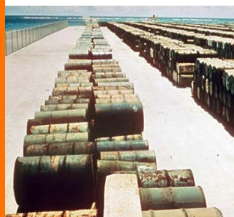
Agent Orange Barrels, 1975, Johnston Island