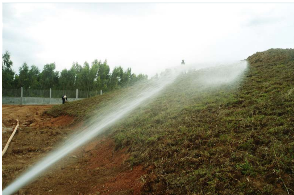
Phu Cat Airbase landfill, 2013

"Thanks to the dioxin project, environmental contamination and potential health risks resulting from the release of dioxin are minimized. Soldiers who are working at Phu Cat Airbase and people living in surrounding areas are very happy to know that Phu Cat Airbase has been removed from the list of dioxin hotspots in Viet Nam," Mr. Do Ngoc Tho, Political Division of Phu Cat Airbase.