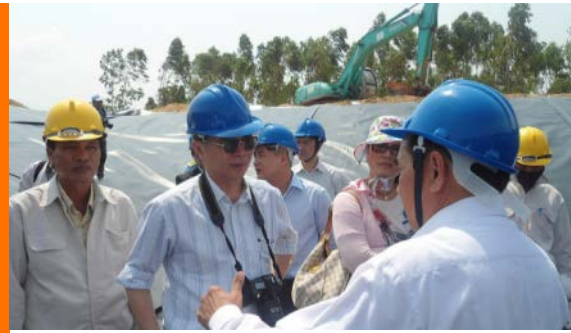
Phu Cat: Interministerial field trip (dioxin project Management Unit 2012)