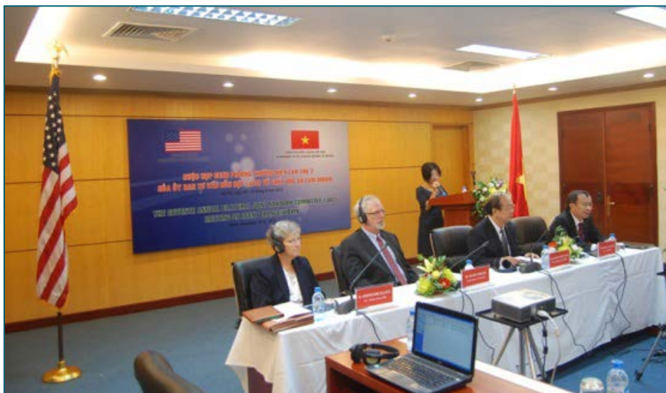
The Seventh Annual Bilateral Joint Advisory Committee Meeting on Agent Orange/Dioxin, 2012

Deputy Director, International Organizations and INGOs Division, Foreign Economic Relations Department, Ministry of Planning and Investment