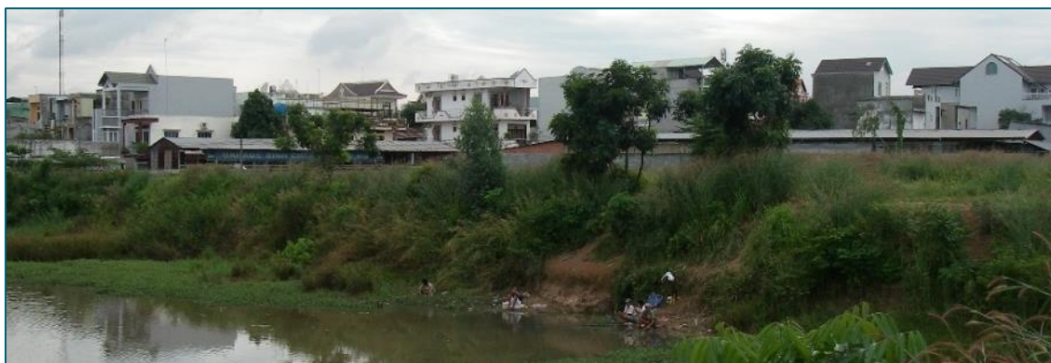
Communities adjacent to Z1 Lake, Bien Hoa (Hatfield, 2008)

The first phases of remediation efforts at Bien Hoa Airbase are underway, with assistance from USAID. These include stakeholder engagement activities, an environmental assessment and a gender assessment. The environmental assessment is expected to identify and address supplemental sampling and analyses; evaluations of containment/remediation alternatives; potential health-related, environmental and social issues associated with implementing activities for remediation of dioxin-containing soil and sediment; and approaches for environmental mitigation and monitoring.