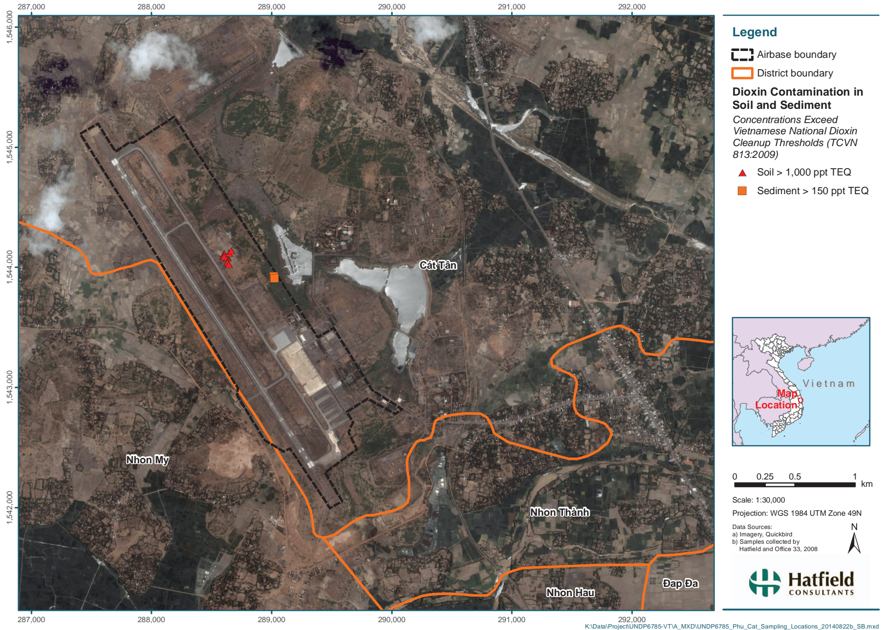
Figure 2 Dioxin-contaminated areas at Phu Cat Airbase.