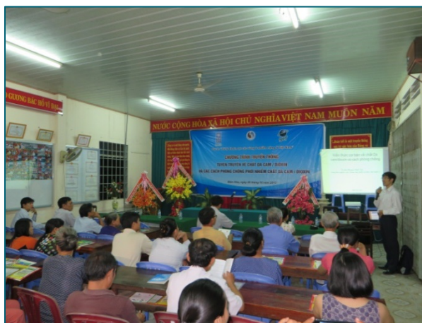
Citizens in Tan Phong Commune participate in a communication programme on dioxin exposure prevention organised by the dioxin project, 2013.

Tan Phong is a ward in Bien Hoa city, located to the south of Bien Hoa Airbase. It has 11 residential areas, primarily consisting of military families. The dioxin project has involved local people and authorities in several activities including workshops, communication on the impact of dioxin to the environment and health, and dioxin exposure prevention methods.