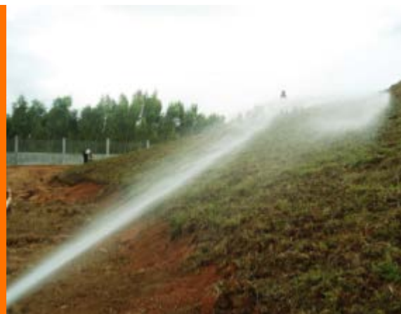
Phu Cat: Landfill grass (Vinausen 2012)