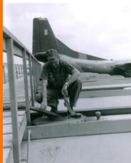
Bien Hoa Airbase, April 1969. Inspection of the fluid level of the orange defoliant