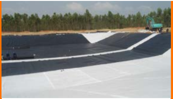
Phu Cat: Landfill preparation (Vinausen 2012)