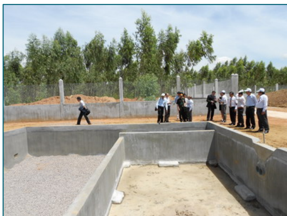
Phu Cat Airbase landfill construction, photo taken in 2012

Official, Department of Science, Technology and Environment