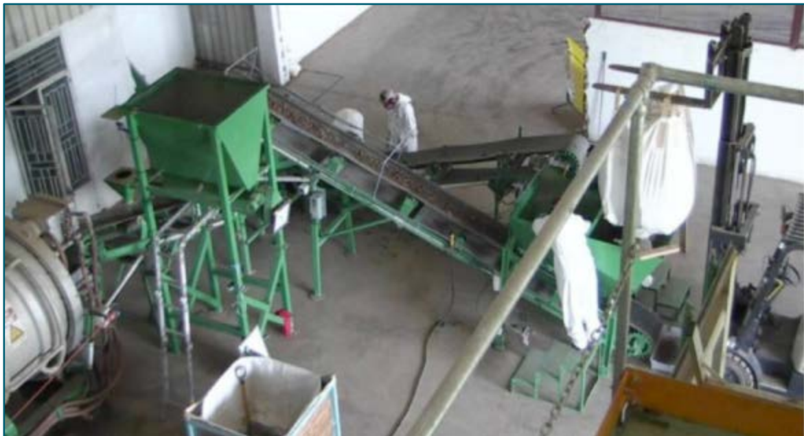
Feeding contaminated soil into mechano-chemical destruction technology (MCD™) reactors (Environmental Decontamination Limited, 2012)

In addition to the mitigation measures implemented at Bien Hoa Airbase, a pilot demonstration of mechano-chemical destruction technology (MCD™) has been completed. MCD™ is a method for denaturing the dioxin compounds without the use of chemical additives. The method is based on a tipoplazma effect formation (ultraviolet ray formation), where sufficiently powerful mechanic collisions occur among steel balls in the reactors and quartz in the soil.