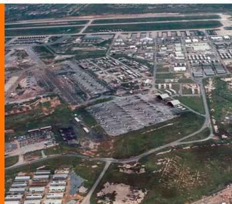
Bien Hoa, October 1972

Hotspots have high residual dioxin concentrations in soil, sediment and other contaminated media (such as fish tissues) due to the storage, use and spillage of Agent Orange during the US-Viet Nam war. These airbases were key military installations for implementing Operation Ranch Hand (Dwernychuk 2005; Dwernychuk et al. 2002; Hatfield Consultants and 10-80 Division 1998; 2000; 2006; 2007). These high concentrations have resulted in contamination of the food chain, and ultimately to elevated dioxin levels in humans residing near these airbases (Nguyen et al. 2011).