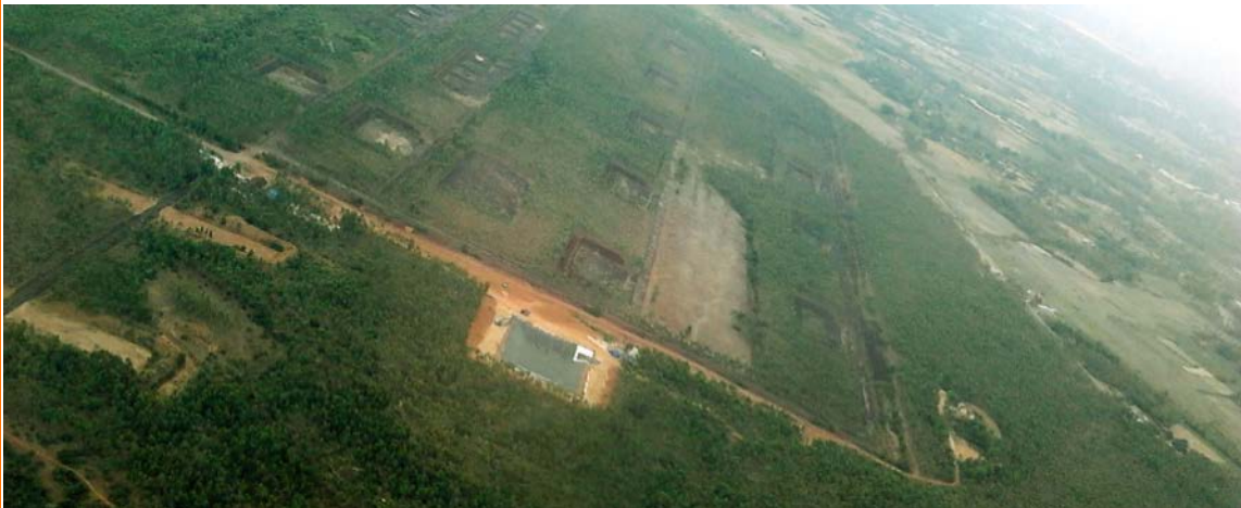
Phu Cat: Landfill construction (Trung Kien 2012)