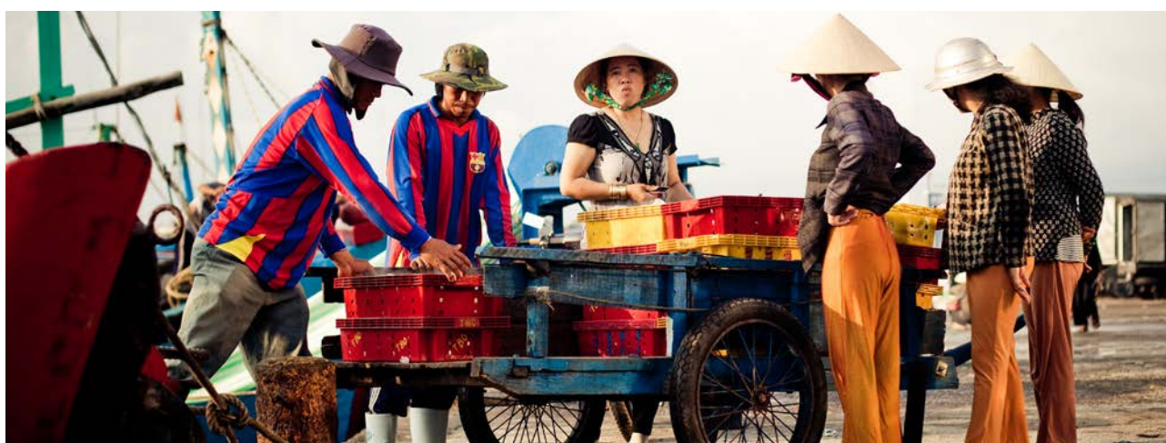
Addressing gender inequality emerged as key theme across many of the groups.