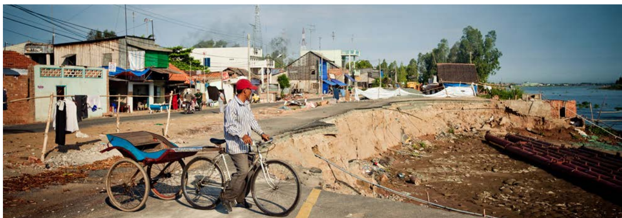
Viet Nam is highly vulnerable to the effects of climate change and this is a central issue that needs to be addressed.