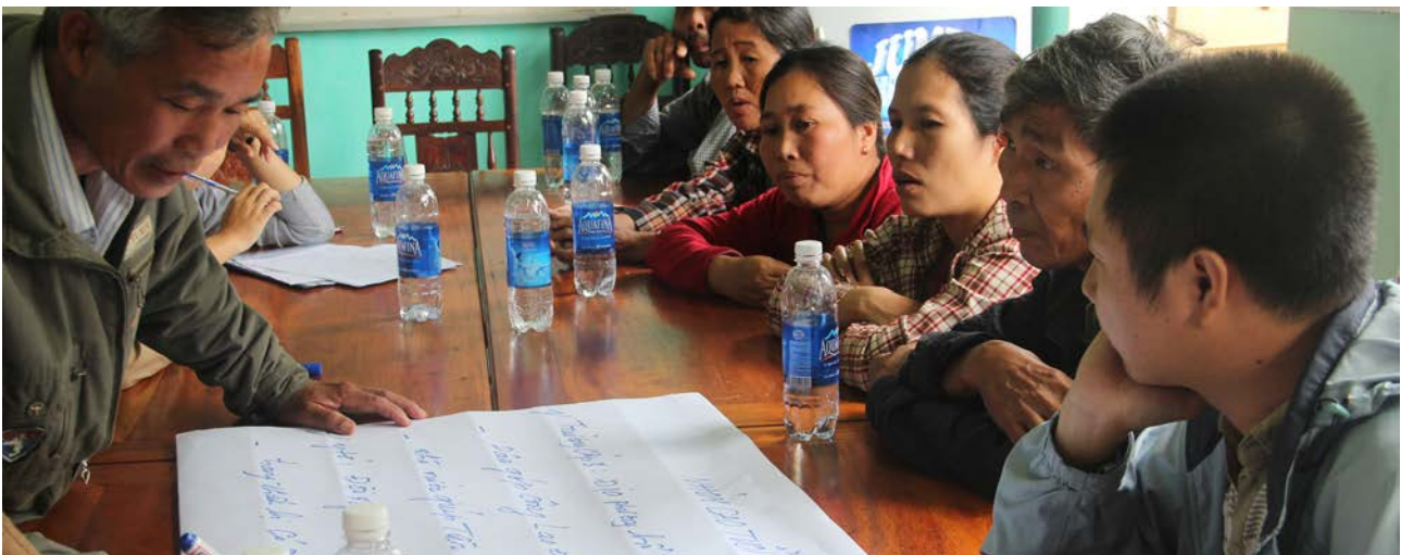
For many a lack of access to financial capital and employment opportunities are major barriers to moving out of rural poverty.

Rural poor: Although the rural poor are a very diverse group, the consultations highlighted a number of shared challenges and aspirations. Participants in the consultations identified the lack of off-farm employment opportunities as a critical reason for why they cannot improve their situation, and this leaves them with few job options other than urban migration. For many women, however, urban migration is not possible as they have family and care responsibilities in the household.