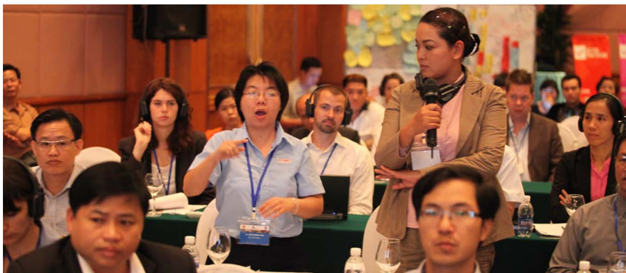
More than 1,300 men, women and children were consulted on the future they want.

Throughout the consultation process, efforts were made to ensure that women as well as men had the opportunity to articulate their particular challenges and aspirations. More than half of the participants in all the consultations were women. Consultation events took place in 13 of Viet Nam's provinces, covering both major cities and the countryside, with a particular focus on poorer and remote rural areas.