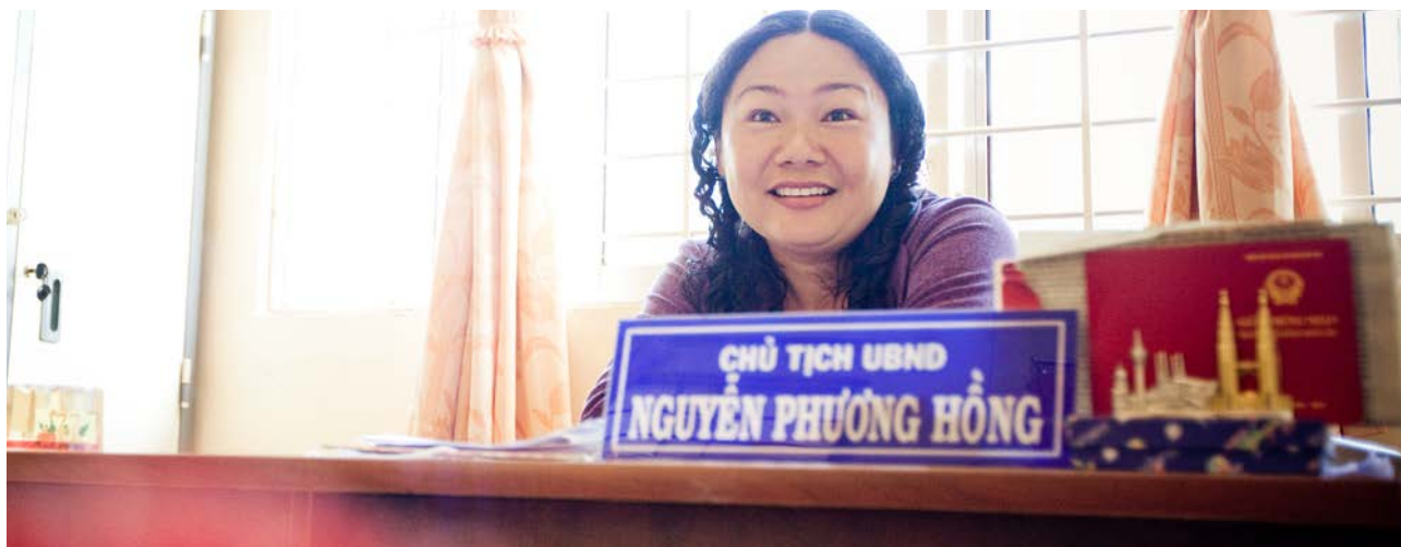
The quality of governance, a key concern for many Vietnamese citizens, needs to be reflected in the post-MDG framework.

Furthermore, while Viet Nam has done well on the health-related MDGs, disparities and inequities are still glaring. The infant mortality rate and under-five mortality rate of the Hmong ethnic minority people is nearly three times higher than the national average. Reports in 2012 also showed that the maternal mortality rate was twice the national average in 225 difficult-to-reach districts and five times the national average in the 62 poorest districts. Another critical area that is not easily measured is the quality of governance, which studies consistently show to be a key concern for Vietnamese citizens and a key factor in shaping development outcomes. The challenge for the post-MDG framework is thus how to represent these important but less easily quantified issues in a way that ensures human development is measured holistically and in a meaningful way.