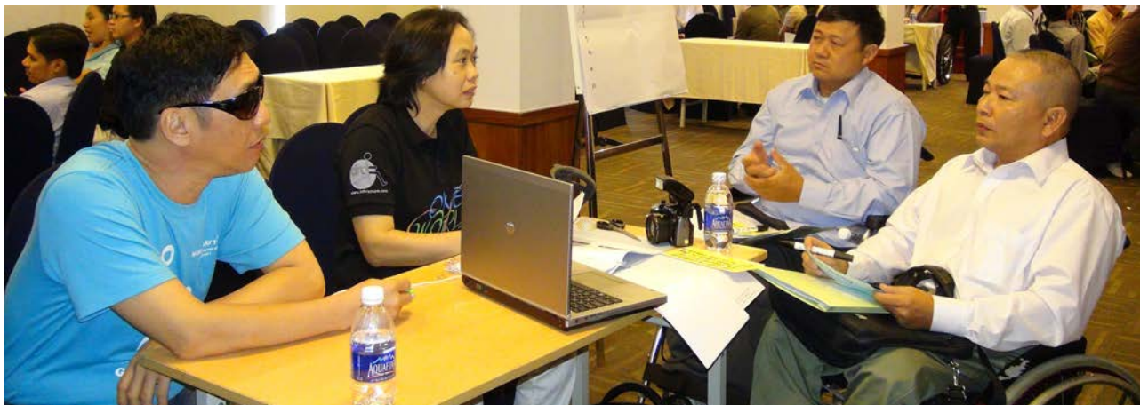
People with disabilities expressed their wish to be treated equally and with respect.