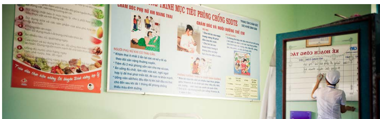
Providing universal access to quality and affordable health care is critical for Viet Nam's future development prospects.