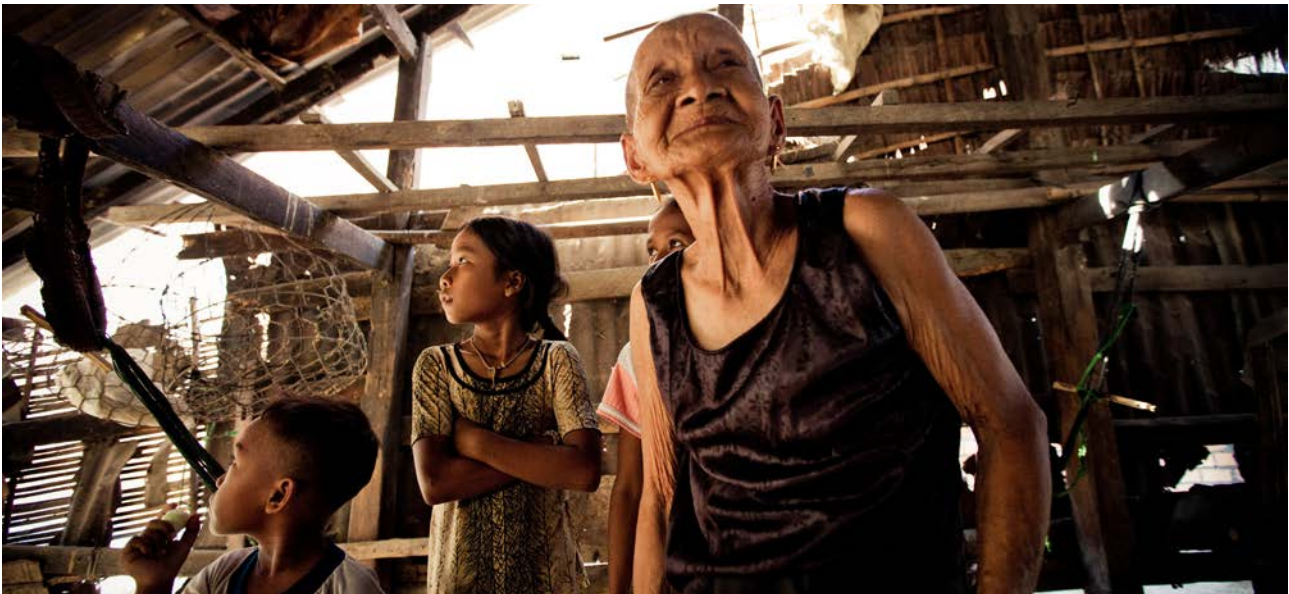
Viet Nam's demographic profile is changing rapidly, with a large number of young people and an increasing number of older people.

This situation is creating both opportunities and challenges for young and older people. Viet Nam will need to make the most of the large working age population by creating decent and meaningful work for young people, which in turn will contribute to state revenues and help to provide young people with a good education, health care and a secure livelihood. As the consultations showed this is what they aspire to.