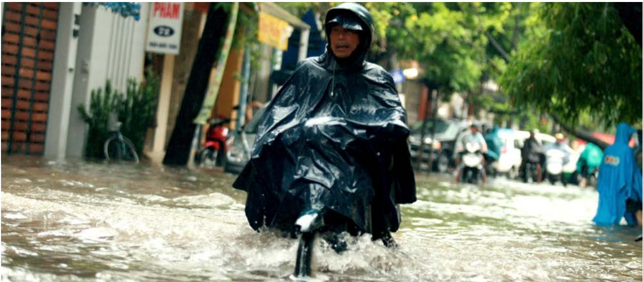
Many people were concerned about their increasing vulnerability, such as the rural poor who often suffer the most from extreme weather events.

The consultations took place with groups of people who are often marginalised in society. Greater social inclusion was therefore a critical cross-cutting theme for most: including ethnic minorities, some older people (particularly poor older persons), people living with HIV/AIDS, people with disabilities, the rural poor, urban migrants and the urban poor. All suffer from being stigmatised and discriminated against by state officials providing services and mainstream society. Exclusion from mainstream society and everyday life, both socially and economically, reinforces vulnerability and locks marginalised people into cycles of continuing stigma and deprivation. The key to overcoming social exclusion, highlighted throughout the consultations, in the national workshop and the review of key literature, is greater participation. A strong message for the post-2015 era is therefore that enhanced participation is key to ensuring a dynamic, prosperous and stable Viet Nam.