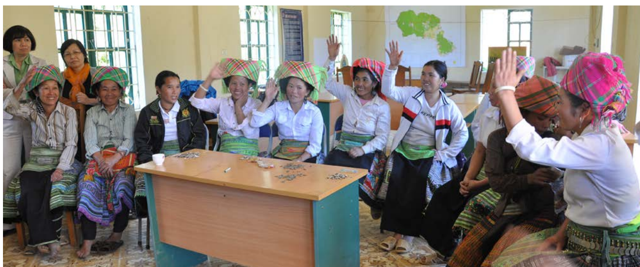
Low levels of access to basic social services is still a significant problem for ethnic minorities.

Ethnic minorities: The ethnic minority men, women and children consulted identified a number of specific challenges they face. Ethnic minorities often live in remote and mountainous areas and are much more likely to lack food and suffer from poverty than other people in the country, and this was confirmed by the consultation findings.