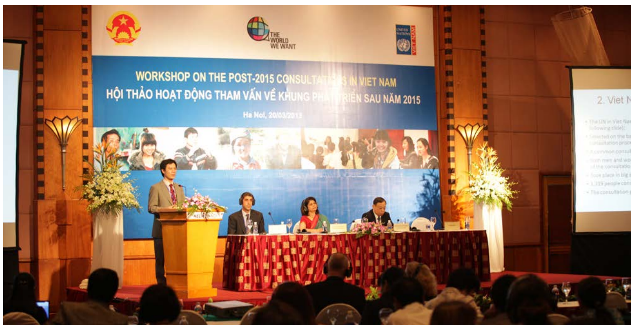
National workshop on the Post-2015 Consultation in Viet Nam in Ha Noi on 20th March 2013.

This statement sets a clear orientation for the Post-2015 Development Agenda globally, as well as a frame for Viet Nam in thinking about, and planning for, a post-2015 future. The Task Team challenges all of us to bring about ' transformative change towards inclusive, people-centred, sustainable development '. This vision for the future rests on the core values of human rights, equality and sustainability – values widely shared in the world and embodied in the Constitution of Viet Nam and in Viet Nam's UN treaty commitments.