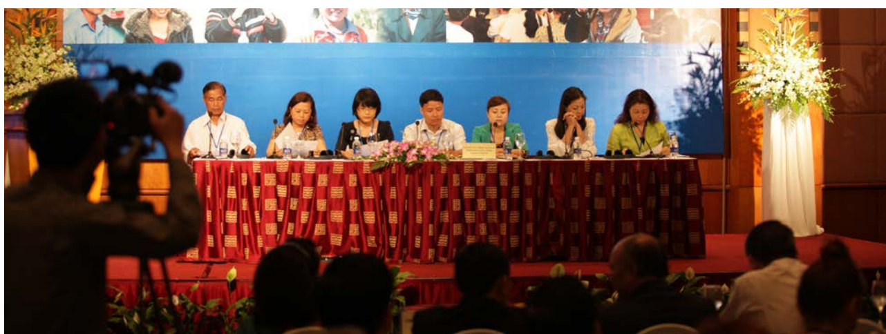
Q&A section opened to participants on the process of consultation with the eight focus groups at the National workshop on the Post-2015 Consultation in Viet Nam in Ha Noi on 20th March 2013.

The consultations started in November 2012 and ended in January 2013. Reporting and documentation was finalized during January and early February 2013. A workshop was then co-organized by the Government and UN in Viet Nam in March 2013 to discuss the findings from the consultations.