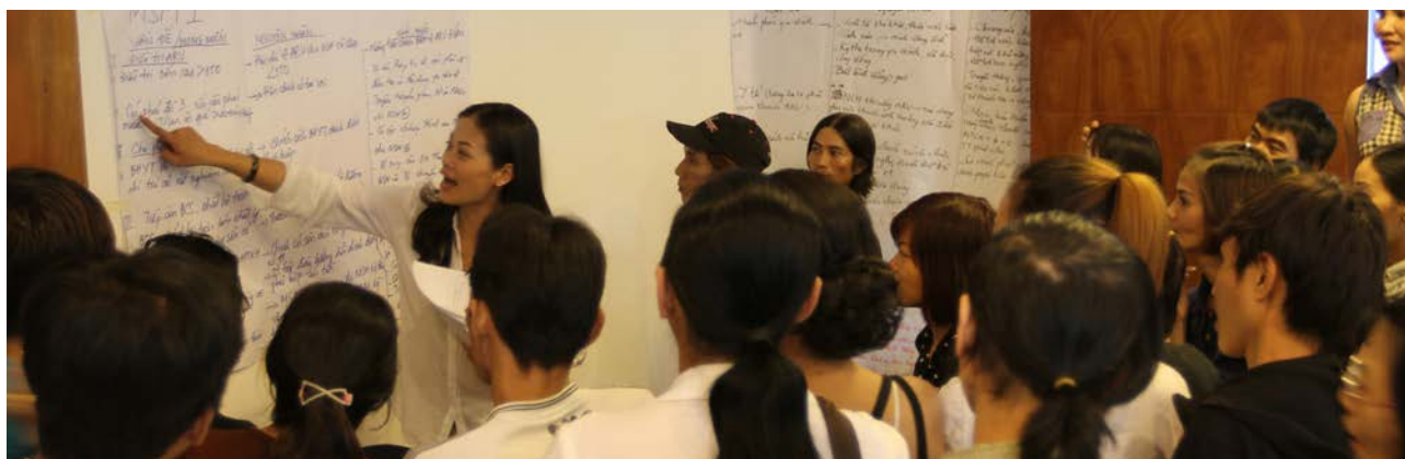
Stigma and discrimination are identified as major problems facing those living with HIV/AIDS.

People living with HIV/AIDS: Stigma and discrimination were the widespread themes running through the consultations with people living with HIV/AIDS and drug users. Stigmatising practices are prevalent at all levels, from within the family, amongst state employees and service providers and in society in general. For example, people living with HIV report discriminatory attitudes among health service providers, and identify their lack of information regarding their legal rights as a problem.