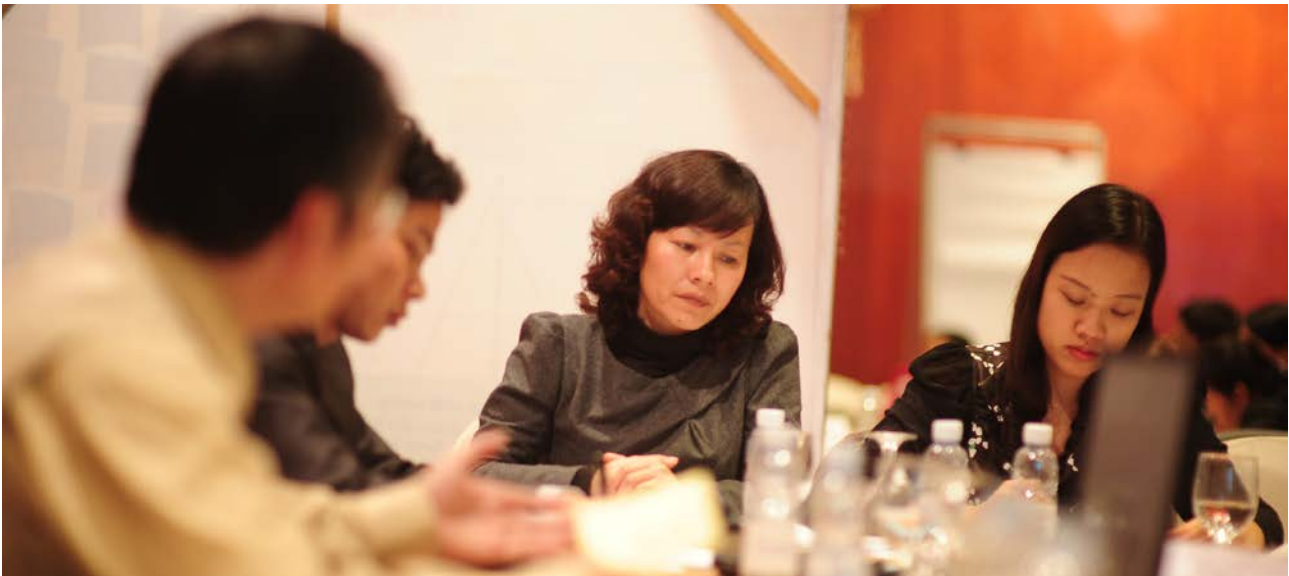
The private sector called for stronger recognition of their contribution to socio-economic development.

The private sector: The private sector consultations focused on four key topics: Viet Nam's business sector in the global economy and global value chains; new economic growth models; ensuring a qualified workforce; and issues of representation, policy advocacy and the regulatory environment for businesses in Viet Nam.