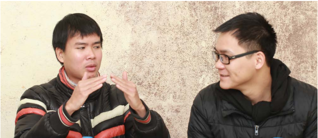
People with disabilities want to be treated the same as everyone else.

International legal frameworks have had a positive effect on people with disabilities, and their rights are clearly set out in law in Viet Nam. However, there is still a widespread perception that the laws cannot be fully implemented. For example, people with disabilities receive limited information on vocational training opportunities and are generally considered unemployable.