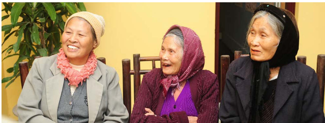
Older people are still keen to contribute to their communities and to society.

(Focus group discussion with older people in Hung Yen province)