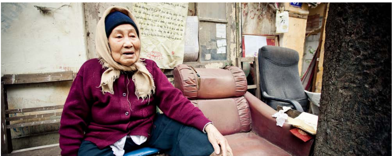
There is a need for a comprehensive social protection system for all Vietnamese citizens.

4. Viet Nam's demographic shift: Responding to a changing population structure and the need for a comprehensive social protection system. Viet Nam is undergoing a unique demographic process. A large young population and a rapidly ageing population are providing both challenges and opportunities for the young and old, and society in general. For young people, the challenge is to find meaningful, productive employment. For older people, it is to secure adequate state care and social security in the face of the erosion of traditional household caring for older persons.