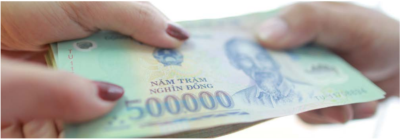
Corruption is a major barrier to economic development and threatens social stability.

Enhancing participation and freedom of expression are important as Viet Nam's democracy has always relied heavily upon the strong bond between the people and the Party. Strengthening women's representation in leadership and management positions, for example, is critical in order to gradually reduce the gender gap in politics and the public sphere. Providing further mechanisms for citizens to actively participate in society and to influence decisions that are made on their behalf will strengthen the bond between them and decision makers, thereby enhancing the quality of governance. Enabling people to freely express their opinions in public spaces, the print media and cyberspace is also critical in ensuring a healthy and democratic society. The popularity of social media and the internet is growing rapidly in Viet Nam, particularly among young people, and this should be viewed as an opportunity for strengthening the quality of governance, rather than a threat.