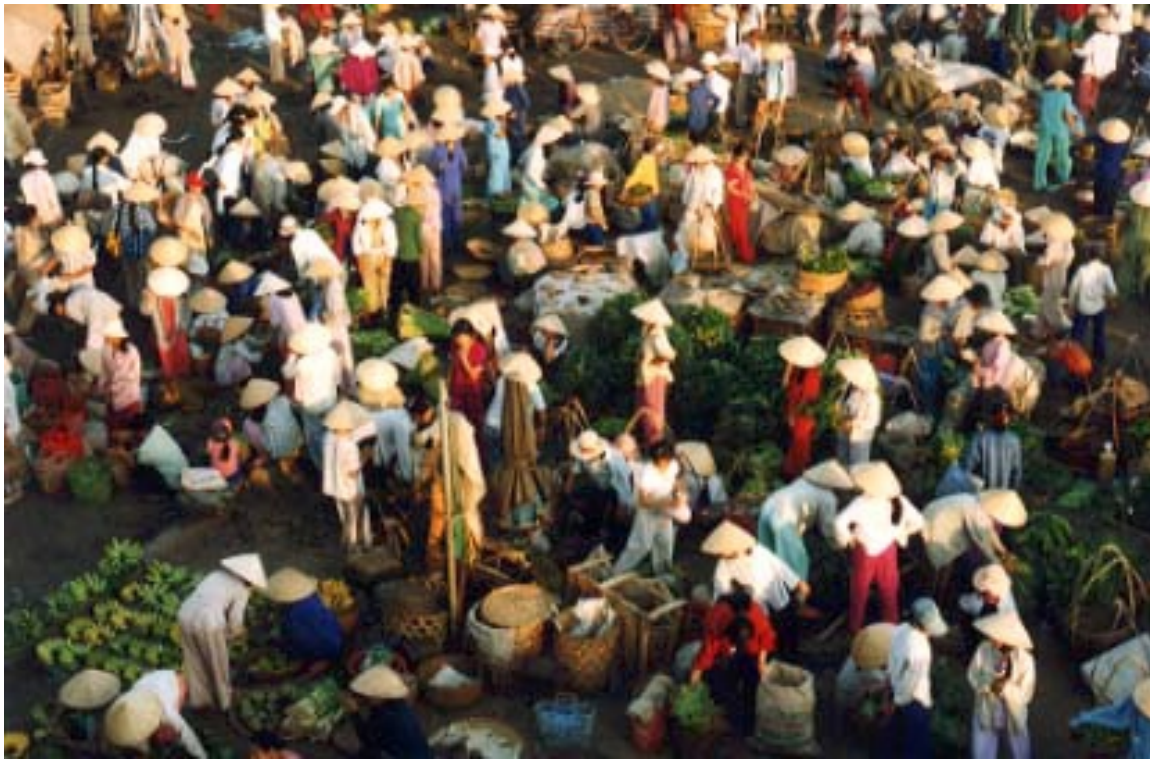
Early morning market