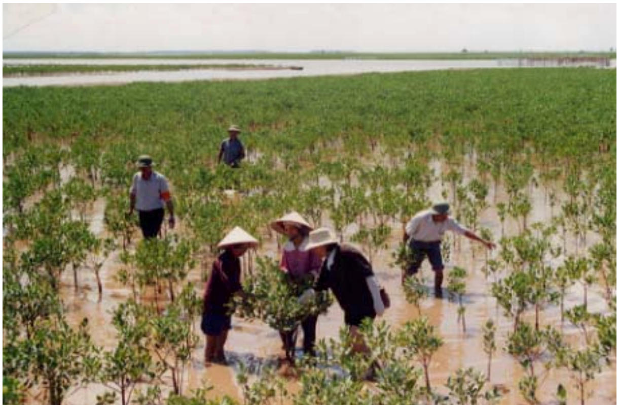
Volunteers inspecting a mangrove forest