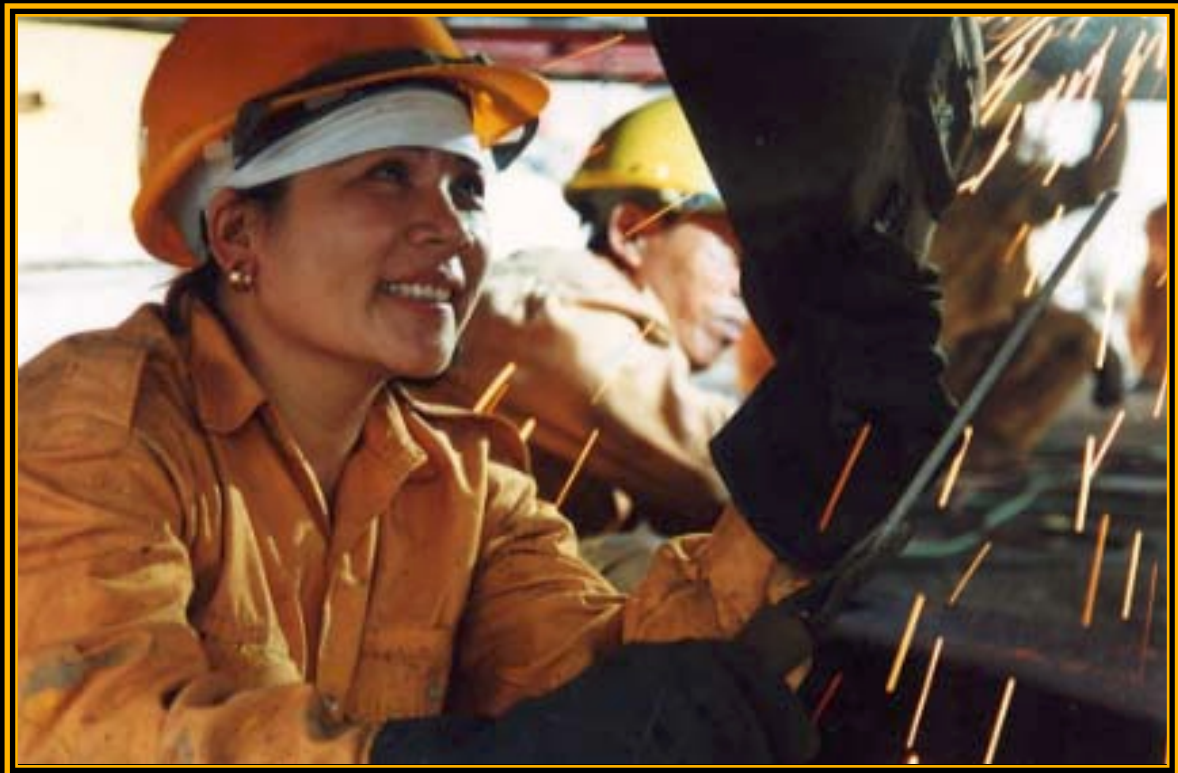
The look of a welder

Special Award for the depiction of women in non-traditional roles and Second Prize of the category