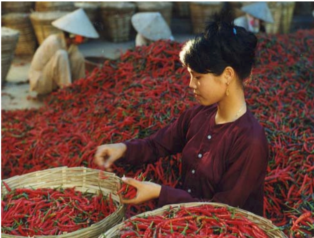
Preparing chillies for export