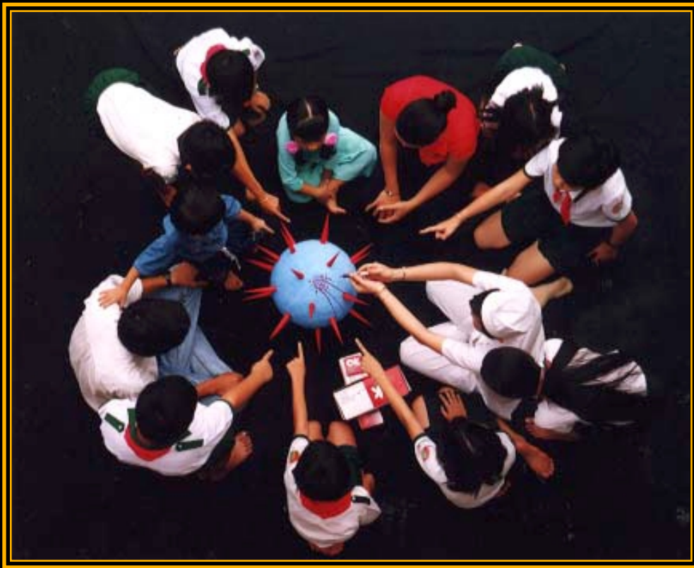
Educating children on the epidemic

Special Award for the most innovative image and First Prize of the category