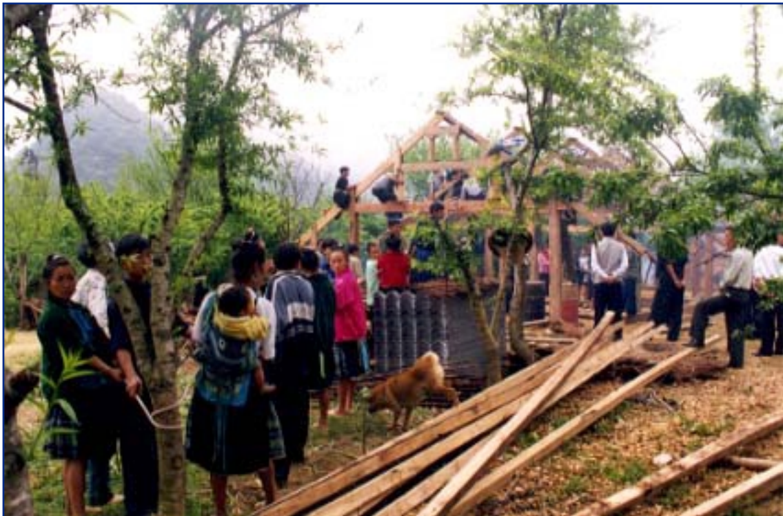
Settling down together