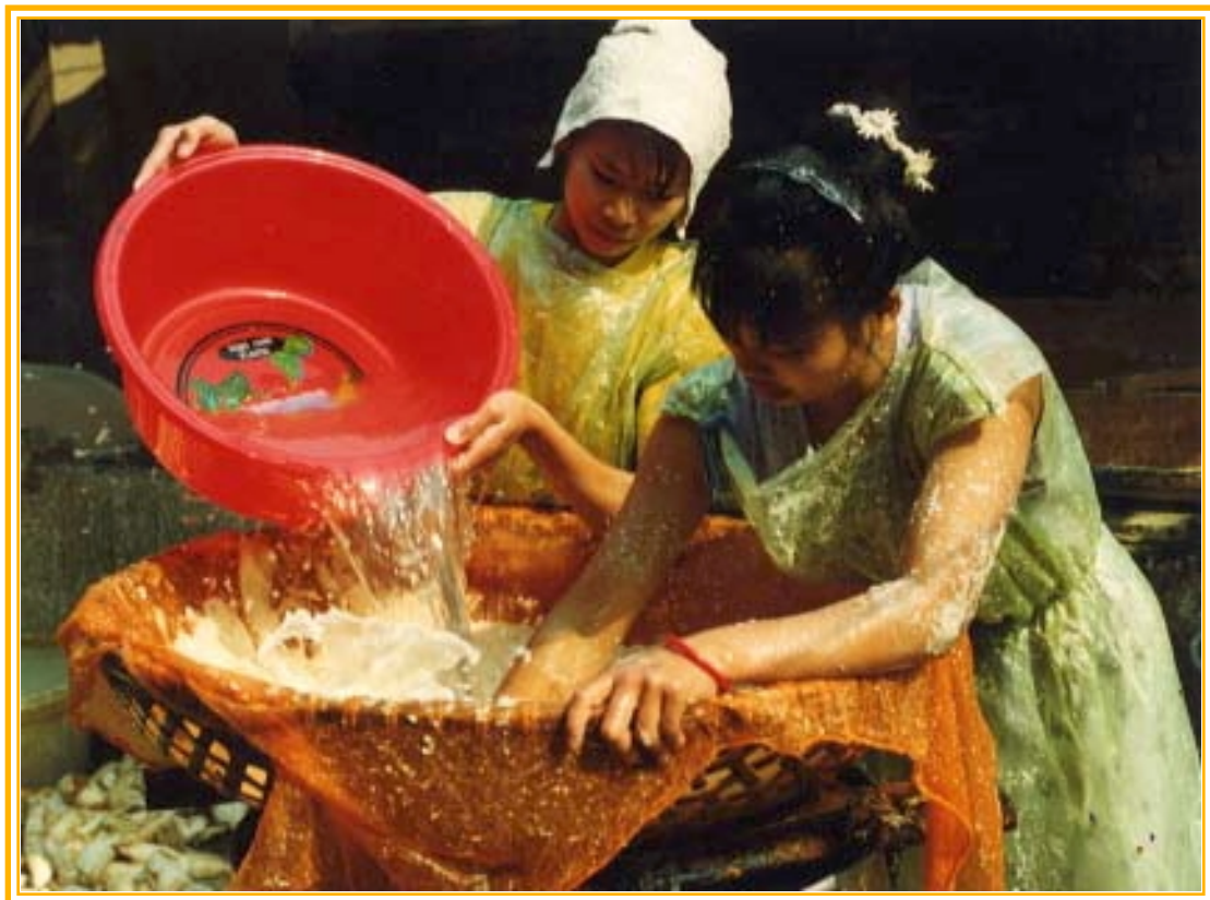
Making tapioca powder