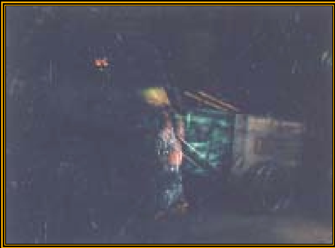
Silent night, working night