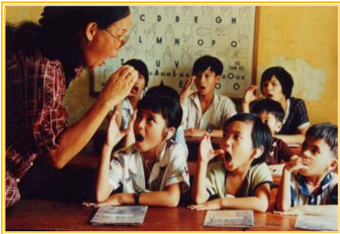
Teaching disadvantaged children