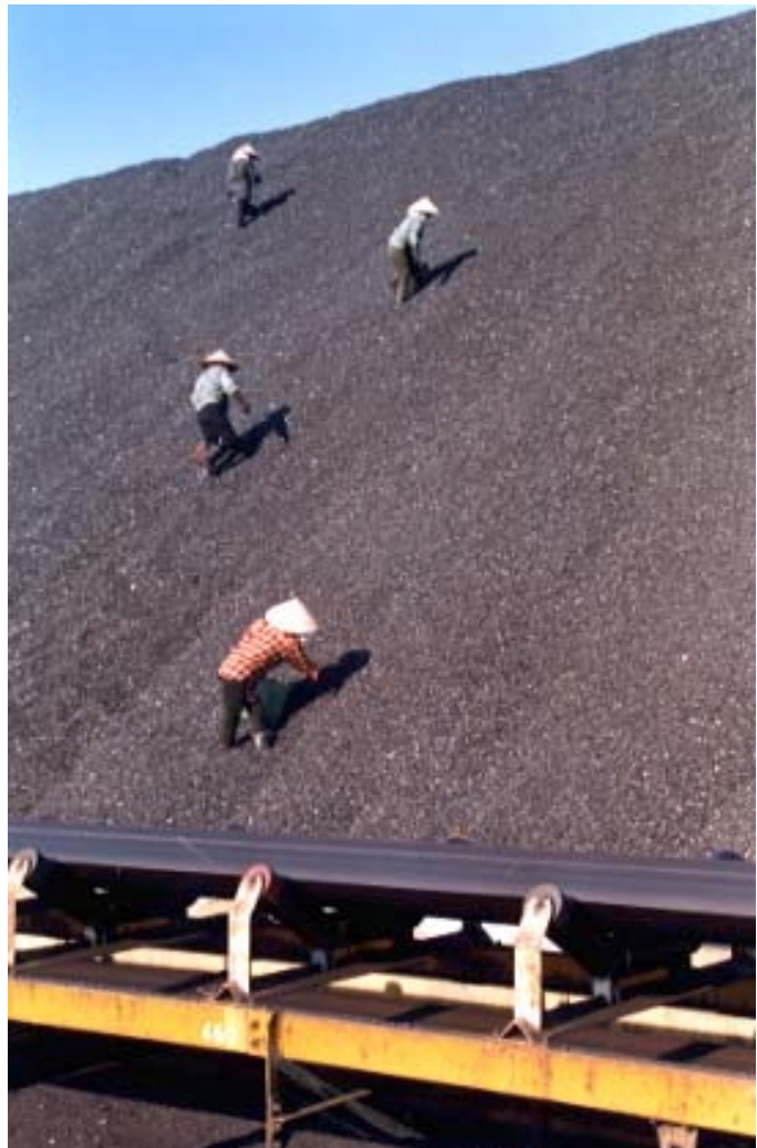
Climbing on a coal mountain