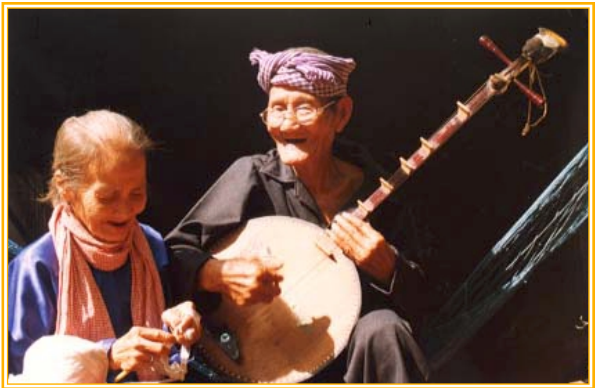
Sharing old melody