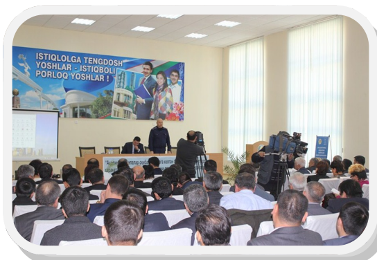
At the college "Cartography and Geodesy" - seminar for college directors