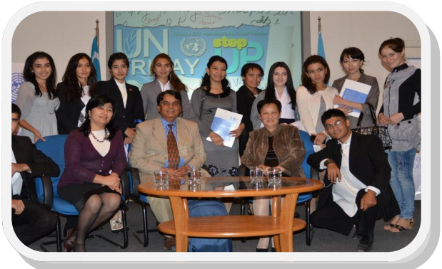
5 October —UN Friday with university students in collaboration with UNIC