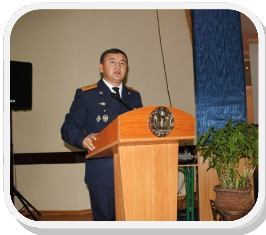
Head of Tashkent city community training center of the Ministry at the Academic Lyceum

The training workshops were instrumental in providing to the participants an overview of the earthquake risk mitigation measures in general as well as with special reference to educational entities and makhallas. During the workshops importance of seismic safety of building of the educational institutions and living houses were highlighted. The role of the emergency medical services and firefighting services during the emergency situations/disasters were also discussed in details. Overall these workshops were able to bring together about 300 directors of educational institutions and makhalla leaders.