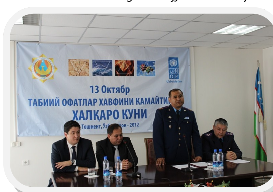
13 October —Media Briefing for journalists at the Ministry of Emergency Situations.