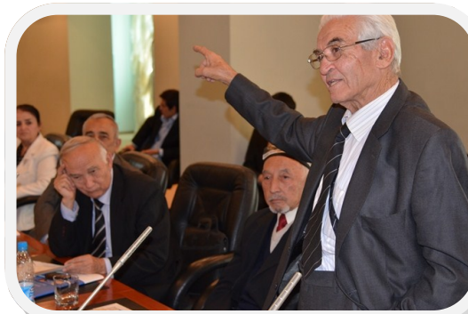
10 October —Roundtable discussion on earthquake safe construction practices of private houses