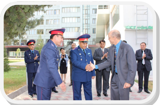
13 October —Celebration at the Ministry of Emergency Situations