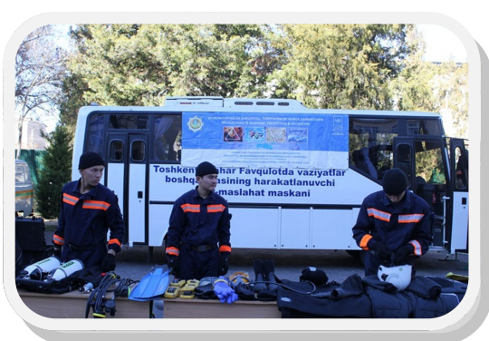
Exhibition of rescue service