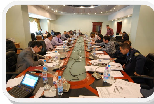
11-12 October —Simulation exercise on earthquake response preparedness and lessons learned in collaboration with UNOCHA Regional Office in Almaty