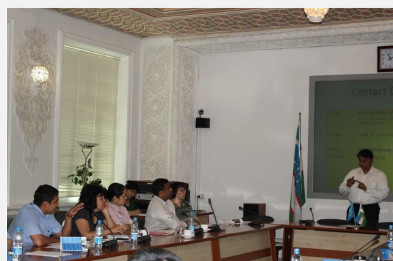
UN DPRG Meeting : June 22, 2012

UNDAF Mid-term review: The UN DPRG took active part in the UNDAF midterm review process through review and deliberations of targets and indicators of the UNDAF related to disaster risk reduction. Proposed changes have been agreed by the group and submitted for further reflection in the midterm review report.