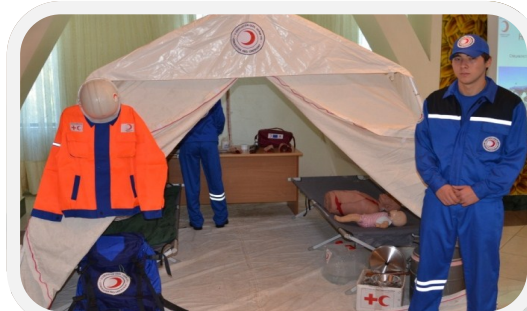
10 October —Exhibition on DRR theme

This year's IDDR program in Uzbekistan has been conducted by the United Nations Development Programme (UNDP), in cooperation with the Ministry of Emergency Situations of the Republic of Uzbekistan. A number of events devoted to IDDR were conducted from the 10 th to the 13 th of October with active participation of institutes and branches of the Academy of Science, the Ministry of Emergency Situations, UN agencies, and other relevant stakeholders.