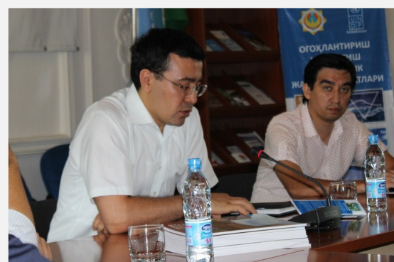
UN DPRG Meeting : August 24, 2012