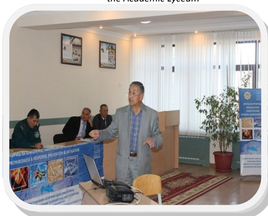
Representative of the Institute of Seismology with his presentation for makhalla leaders