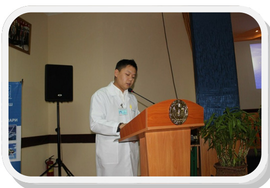
Emergency medical service during disaster—at lyceum