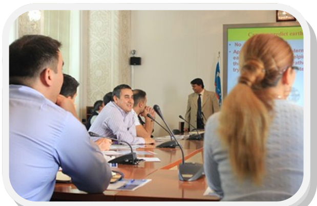
4 October —Learning hour for UNDP CO and projects