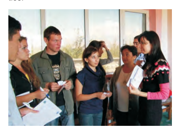
Making tough decisions during the role play game.

But providing the summer school through an online module at initial stage was a breakthrough in connecting people from different age groups, professions and regions to learn about human development. Because classwork could be done at home and fit to the student's schedule, it brought together a diverse group of people who might not otherwise have been able to participate because of work schedules and commuting difficulties.