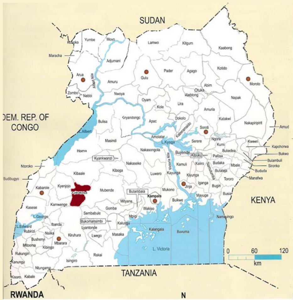
Figure 1: Map of Uganda showing the location of Kyegegwa District