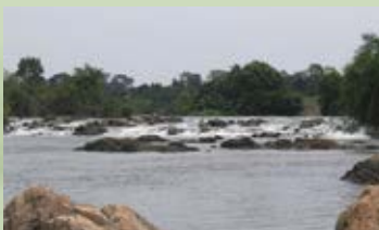
The Katonga River