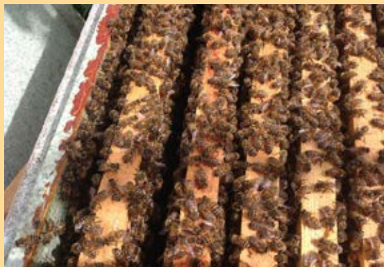
Bee keeping in Kyegegwa