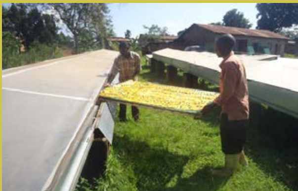
Solar fruit drying in Kyegegwa