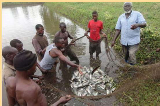
Fish farming in Kyegegwa