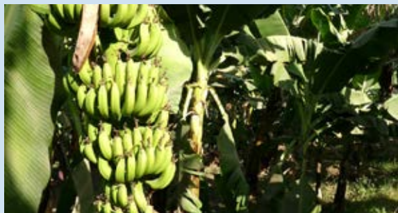
| Banana plantation in Kamwenge District