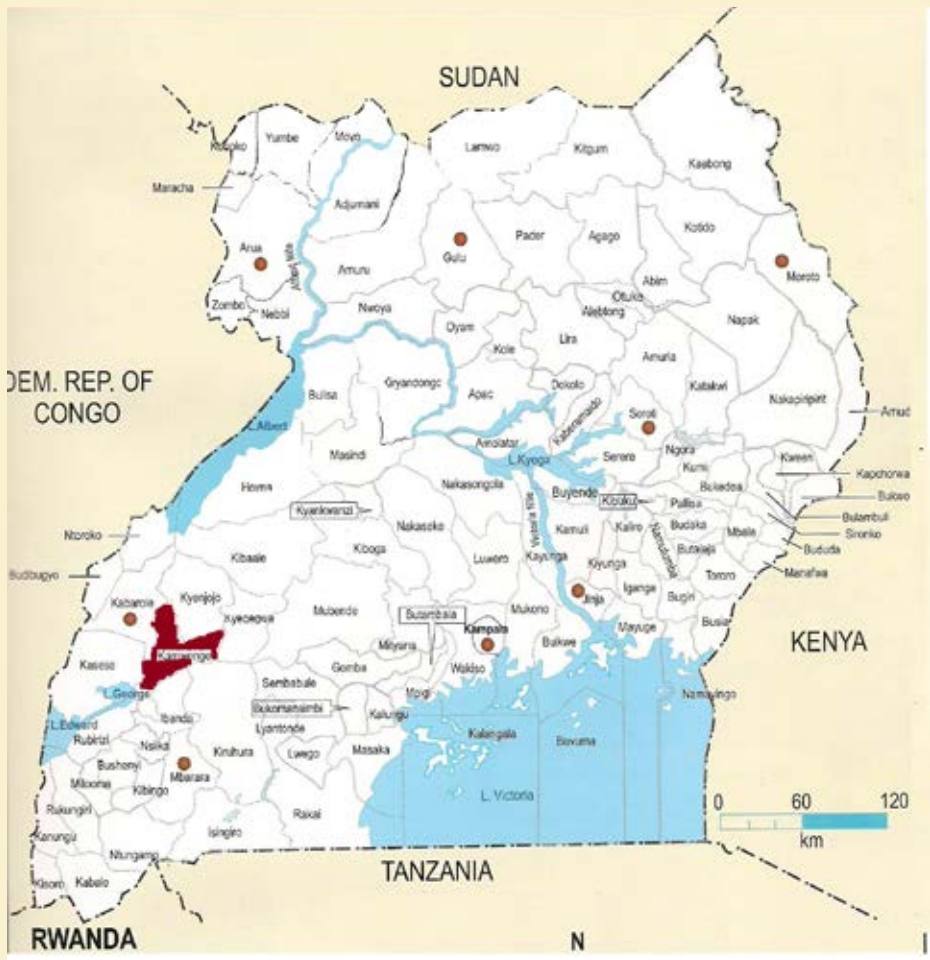
Figure 1: Map of Uganda showing the location of Kamwenge District