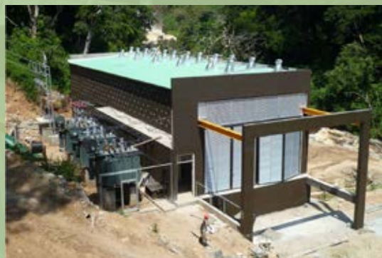
| Hydro power plant at Mpanga, in Kamwenge district