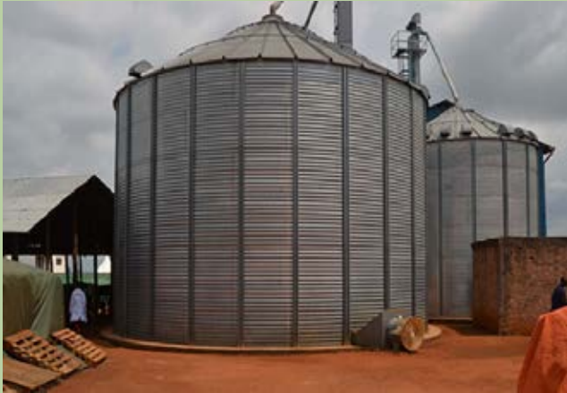
| Grain storage facility