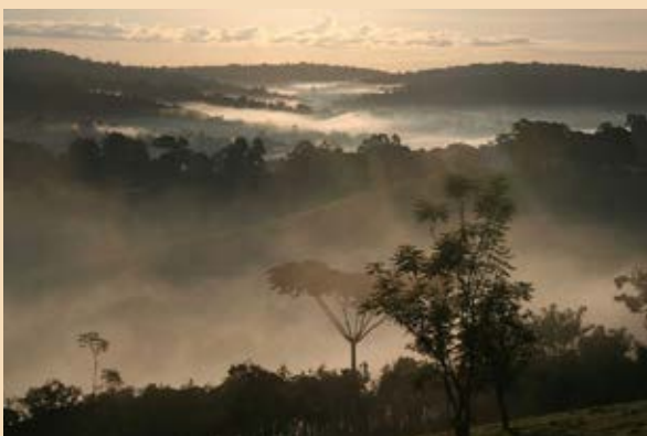
| Kibale National Park