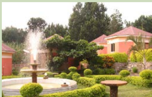
| Accommodation facilities in Kamwenge