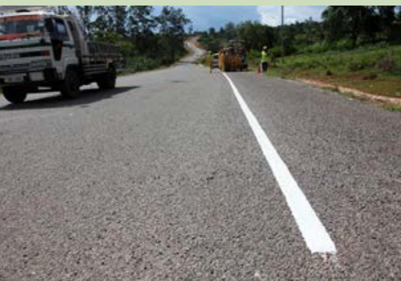
| Fort Portal-Kamwenge Road