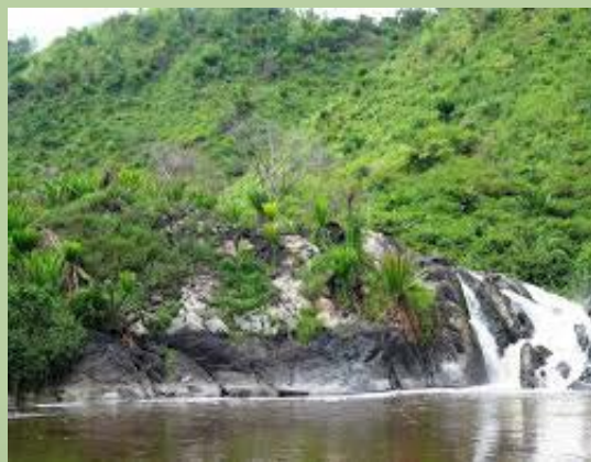
| Mpanga river/falls surrounded by cycads on the hills

For details, visit the district website: http://www.kamwenge.go.ug/index.php?option=com_content&view=article&id=47%3Apotentials&-catid=34%3Ademo1&Itemid=1