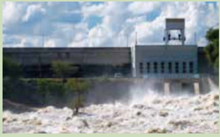
Muzizi Hydropower station