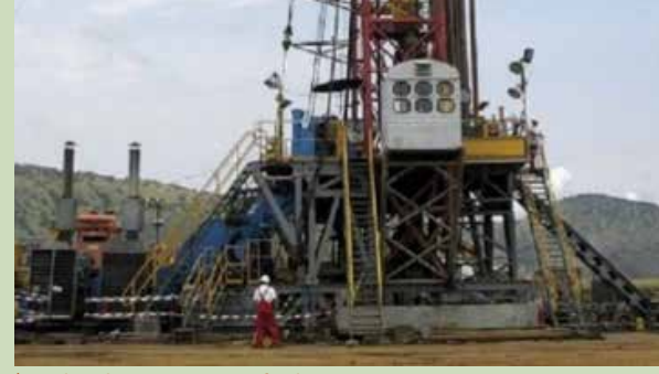
Oil and gas excavation facility

Minerals: The district is endowed with favorable geological conditions associated with rich and diverse mineral resource base and substantial economic potential. Some of the known mineral resources have a mining history while others are yet to be exploited: selected minerals include: Gold salt, Kaolin, sandstones, siltstones, shale, Ilmenite, Zircon, Monazite, Zona time and Casserites.