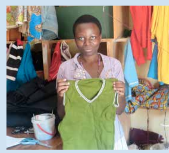
Women in Business

being the main activity and others are retail business and casual work to generate income. A study by the Refugee Studies Centre (2013), University of Oxford found evidence of robust trade activity, not only within the settlement, but also with the wider local community.