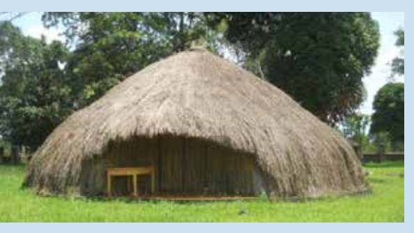
| Mparo Tombs-Burial Grounds of Bunyoro Kings