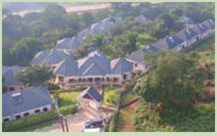
One of the magnificent accommodation facilities in Hoima