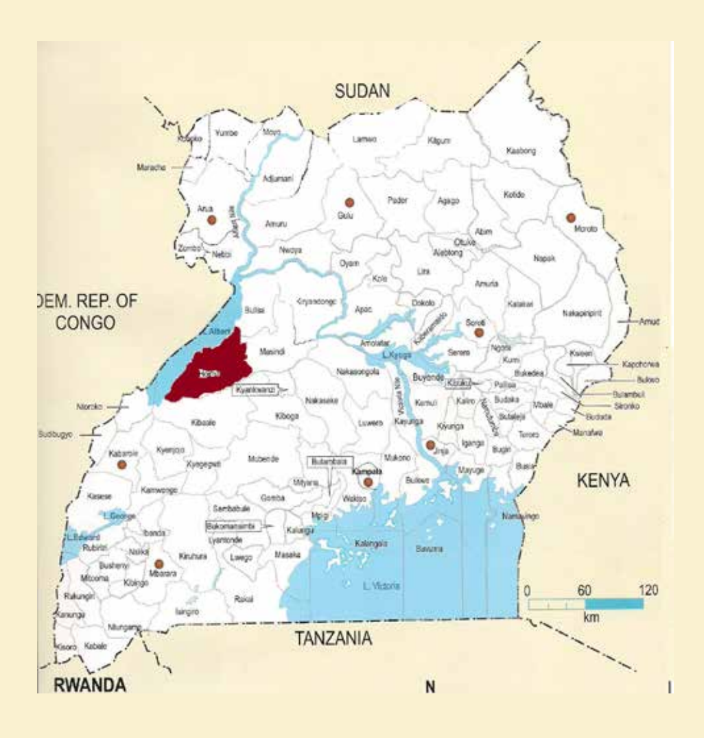
Figure 1: Map of Uganda showing the location of Hoima District