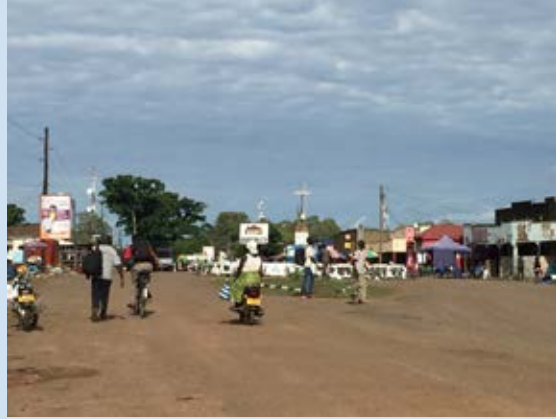
| Adjumani Town