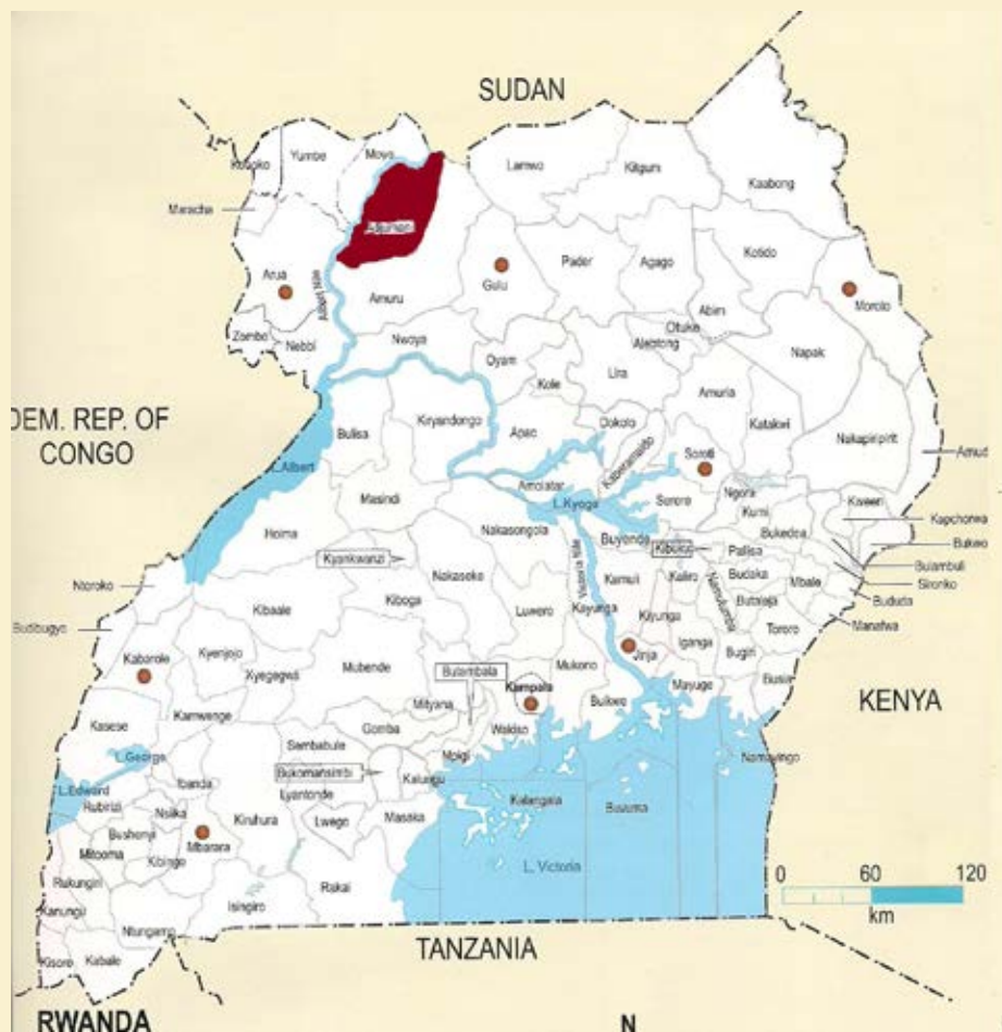
Figure 1: Map of Uganda showing the location of Adjumani District