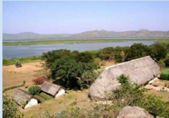
| A specialty lodge in Adjumani