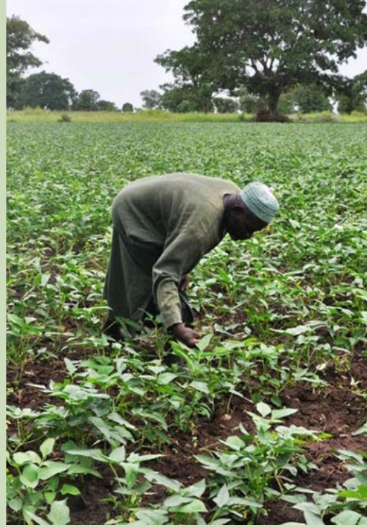
| Adjumani landscape

➤ Agricultural activities in Adjumani are characterized by: being rain fed and heavily dependent on nature for soil fertility; carried out on fragmented plots of land (on average 2 acres in size); use of rudimentary methods without application of relevant scientific knowledge or modern technology which are important for improving productivity. The production system is subject to the effects of unreliable weather, pests and diseases. Agriculture modernization is an opportunity for the people of Adjumani to break out of poverty and start creating wealth.