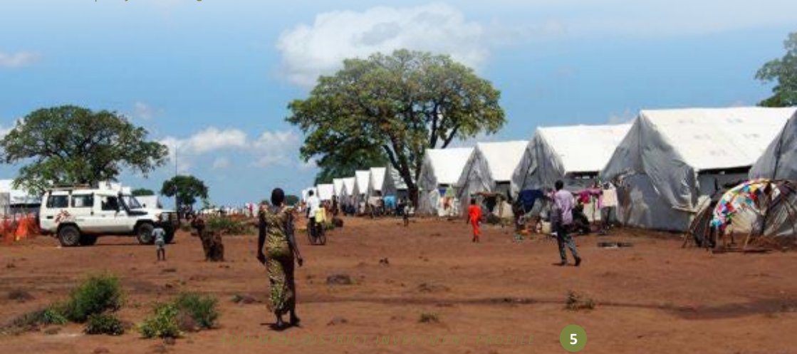
| Adjumani refugee settlement