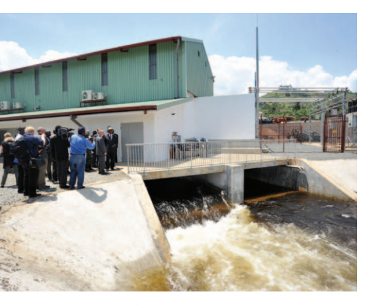
Connecting electricity in rural areas - Bugoye power dam in Kasese.