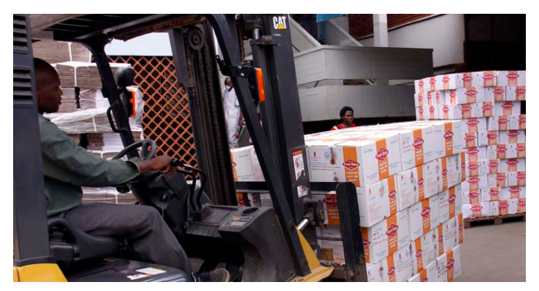
Investment in industry and manufacturing is key to creating employment and reducing poverty in Uganda.

UNDP has provided further resources to UIA to disseminate the compendium in six fora internationally and nationally, to sensitise the Diaspora on the investment opportunities in the country. The response from the first Ugandan Diaspora Trade and Investment EXPO in Boston and the North America Association