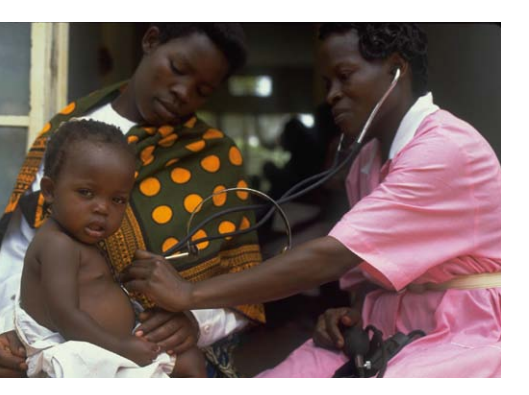
UNDP works with local governments to deliver inclusive social and economic services.