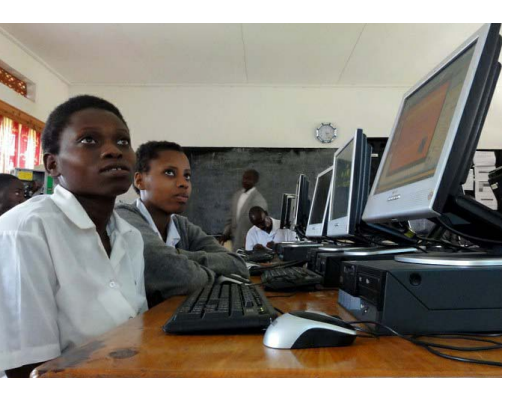
UNDP is collaborating with the Parliament of Uganda to undertake gender responsive budgeting and increase resources for girls' education.