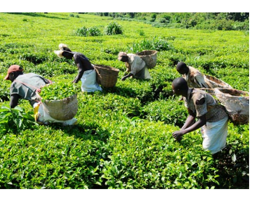
Agriculture is one of the priority sectors for which a Nationally Appropriate Mitigation Action plan has been developed.