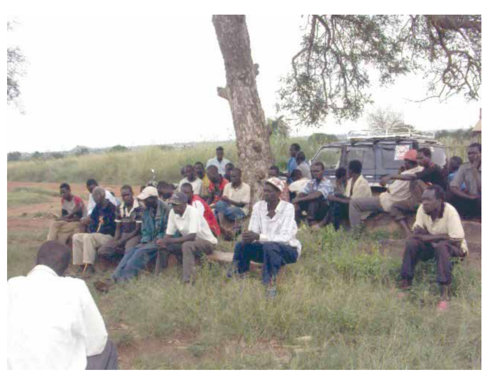
\label{lem:community} \mbox{ Community members of Layik village Amida sub county Kitgum District attending a community Baraza.}