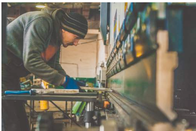
UNDP Grantee, a Specialized Enterprise Producing Equipment for Seed-Cleaning and Calibration of Grain, Kreminna, Luhansk Region

Over 3.8 million people are in need humanitarian assistance, resulting in significant deterioration in standards of living and personal safety. Nearly 1.7 million internally displaced people (IDPs) (61% women) were registered by December 2016. Women, particularly IDPs, are disproportionately affected by the crisis, facing social exclusion in terms of livelihoods and access to housing and public services.