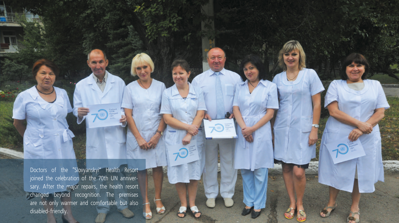
Doctors of the "Slovianskyi" Health Resort joined the celebration of the 70th UN anniversary. After the major repairs, the health resort changed beyond recognition. The premises are not only warmer and comfortable but also disabled-friendly.