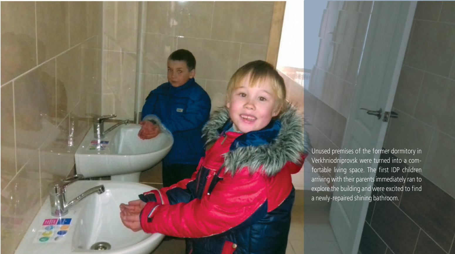
Unused premises of the former dormitory in Verkhniodniprovsk were turned into a comfortable living space. The first IDP children arriving with their parents immediately ran to explore the building and were excited to find a newly-repaired shining bathroom.