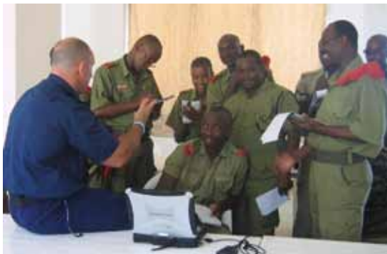
Police officers were trained by the Tanzanian Commission of Human Rights and Good Governance (CHRAGG). The police first tier trainers came from all regions in the country and then trained their fellow officers at the district and ward levels. During the cascade training over 5,000 police officers learned about Human Rights and the Role of Police during Elections. Each participating police officer was provided a training manual. The cascade training, co-funded by the UNDP and Canadian CIDA, was monitored by CHRAGG. Also, a Public Order tactical course trained police officers in non-lethal tactics was conducted. The course examined the impact of policing operations on the wider community and reinforced the need to consider rights and freedoms.