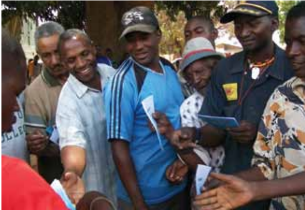
Ipole villagers in Sikonge, Tabora region rush to get copies of voter education material, early October 2010.