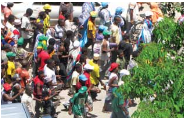
Rival party supporters, CUF and CCM, converging in a common move to a public rally to celebrate a peaceful election in Zanzibar, October 31, 2010 following speeches by the two party leaders accepting the announced election result.