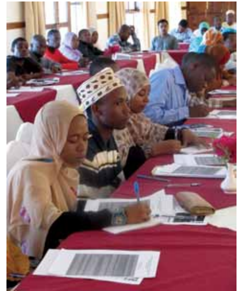
In August 2010 the UNDP Project convened a two day workshop for Zanzibar youth to address "The role of youth in ensuring and fostering a peaceful elections environment". Each presentation was followed by group work during which participants brainstormed and exchanged experiences of past elections. Some of the work shop generated resolutions reached included: