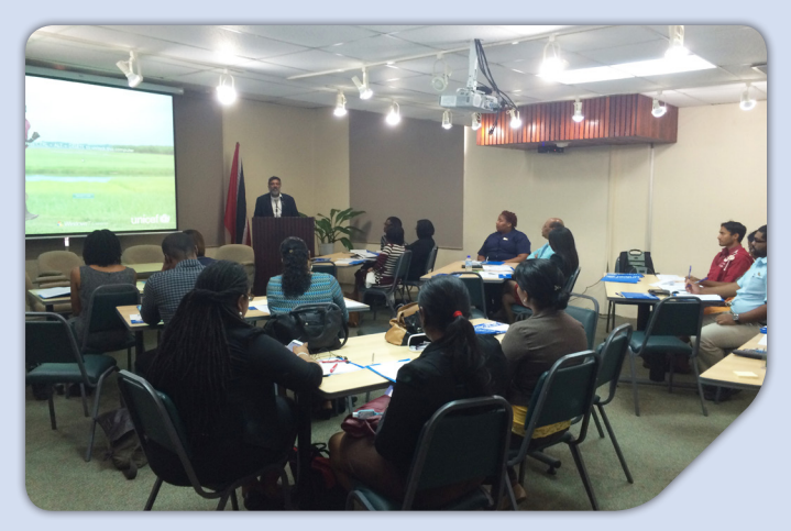
A cross section of participants at the targeting and conditionalities workshop

A two day workshop was held on April 21 and 22 2015, to review targeting methodologies for social protection programmes and conditionalities on social transfers with government partners in Trinidad and Tobago. The purpose of the training workshop was to build national capacities for child sensitive and gender responsive social protection mechanisms for effective targeting and to provide an understanding of the impacts of and issues related to conditional cash transfers. The workshop, coordinated by UNICEF and UN Women in partnership with the Government, brought together key social sector ministries