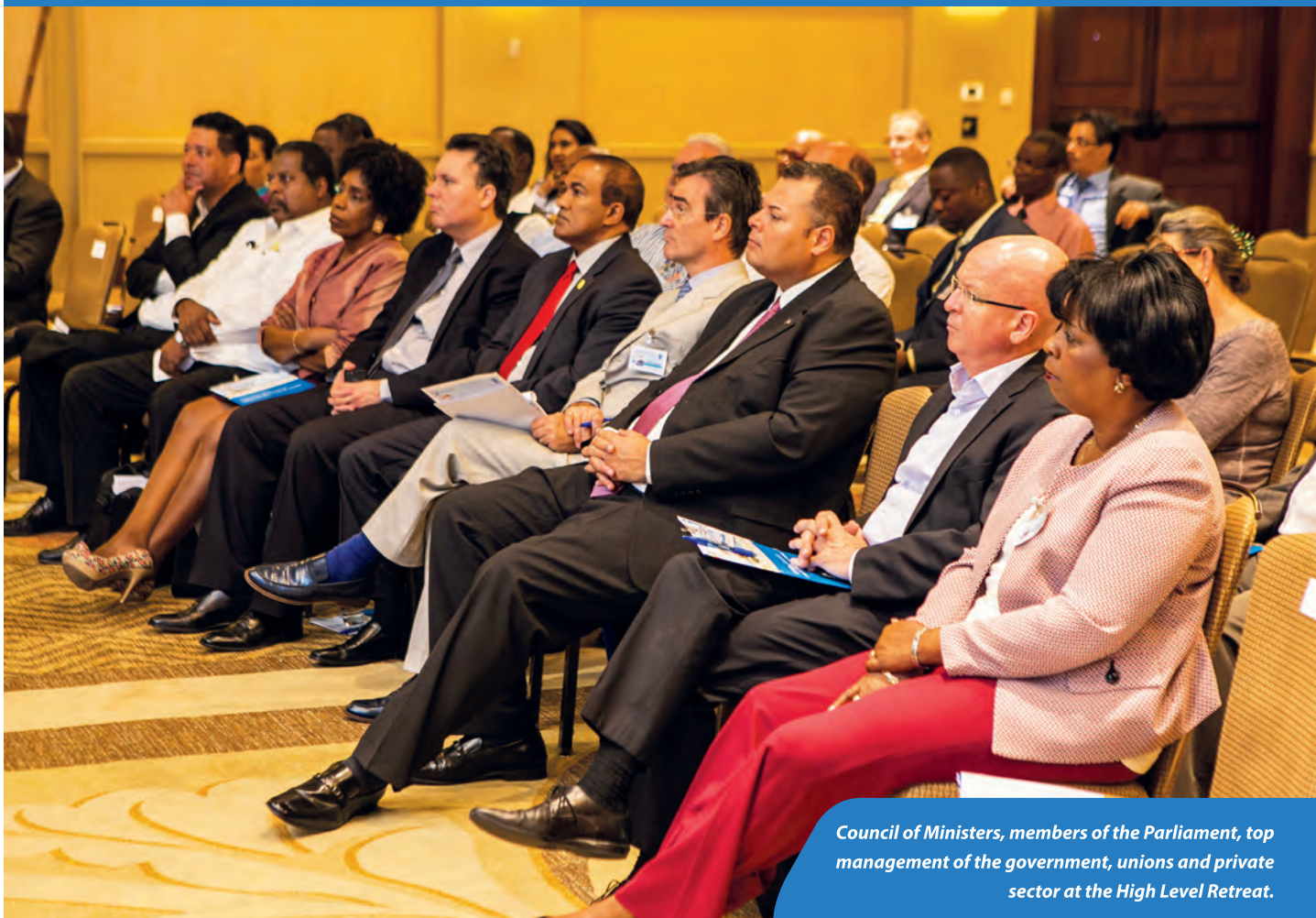
Council of Ministers, members of the Parliament, top management of the government, unions and private sector at the High Level Retreat.

The United Nations Development Programme together with the government of Curaçao is facilitating the process of formulating a National Development Plan (NDP) for the country. The project, which has been active since 2013, has four outputs to deliver by 2016. The NDP as the main output will assist in building a realistic framework for broad sustainable social and economic development for the coming 15 years. The process to get to the NDP involves many consultations, dialogues and bringing different groups together with one main objective: to discuss what are the critical choices Curaçao has to make to not just formulate a national development plan, but have the guarantee that it will also be implemented in the short and long term. On February 20 and 21, 2015 a High Level Retreat was held at the Santa Barbara Beach and Golf Resort in Curaçao with the aim of validating the themes emerging from the