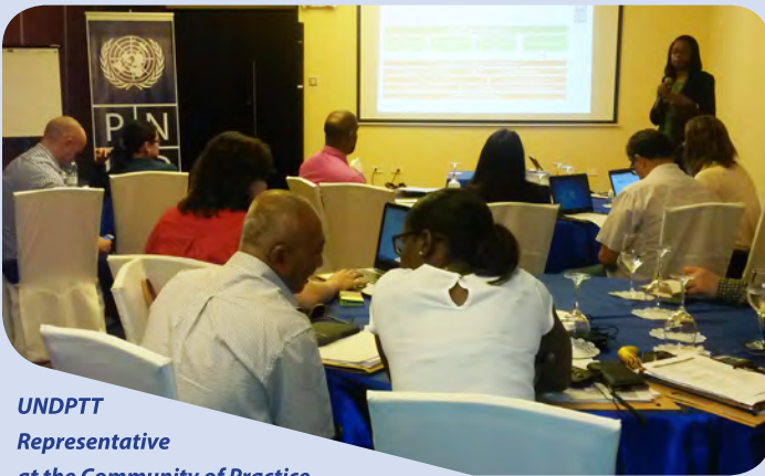
UNDP Representative at the Community of Practice

The Regional Bureau for Latin America and the Caribbean recently held a Sustainable Development Community of Practice titled “ Integrated approaches for Sustainable Development ” in Panama from March 10 to 13, 2015. The objectives of the Community of Practice (COP) were to gain a collective understanding of the future development agenda and its implications for UNDP’s work. The COP also shared