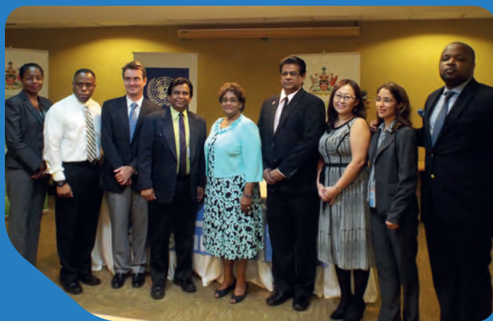
UNDP and Ministry of Health Representatives at the launch of the project

The objective of this technical assistance project is to enhance the delivery of healthcare services by providing International United Nations Volunteer (IUNV) medical professionals throughout Trinidad and Tobago and extended hours of operation.