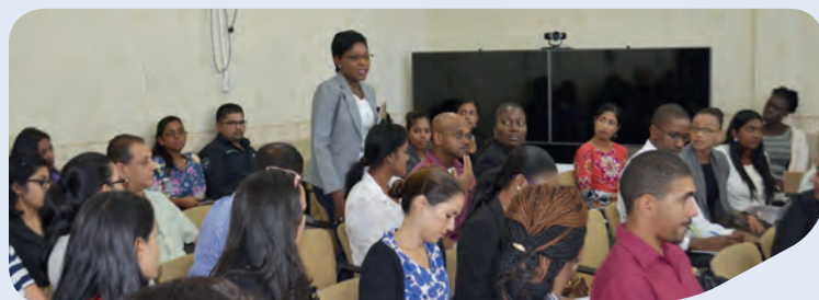
A cross-section of participants at the LECB Project Launch and Inception Workshop.