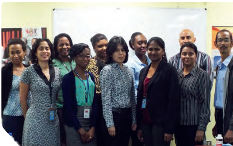
UNDP staff and project team participates in intensive training

More than 30 UNDP staff and project team members benefitted from an in-depth training programme during the 23 -27 March 2015 at UN house. The agenda focussed on providing participants with an enhanced understanding of ATLAS, which is the software programme used by UNDP global. Areas of training included internal control frameworks, revenue management, resource planning and budget and vendor management. Participants also learned how to identify risks and issues and create risk logs as well as understand how the UNDP procurement process functions.