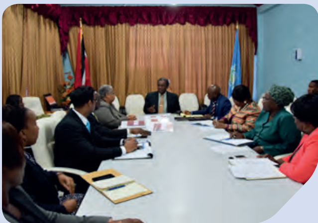
Members of the Juvenile Court Project Team meet with representatives of the Tobago House of Assembly