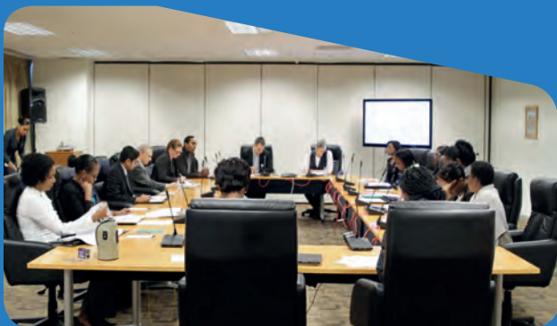
The Parliamentary Round Table in session on the 11 March 2015