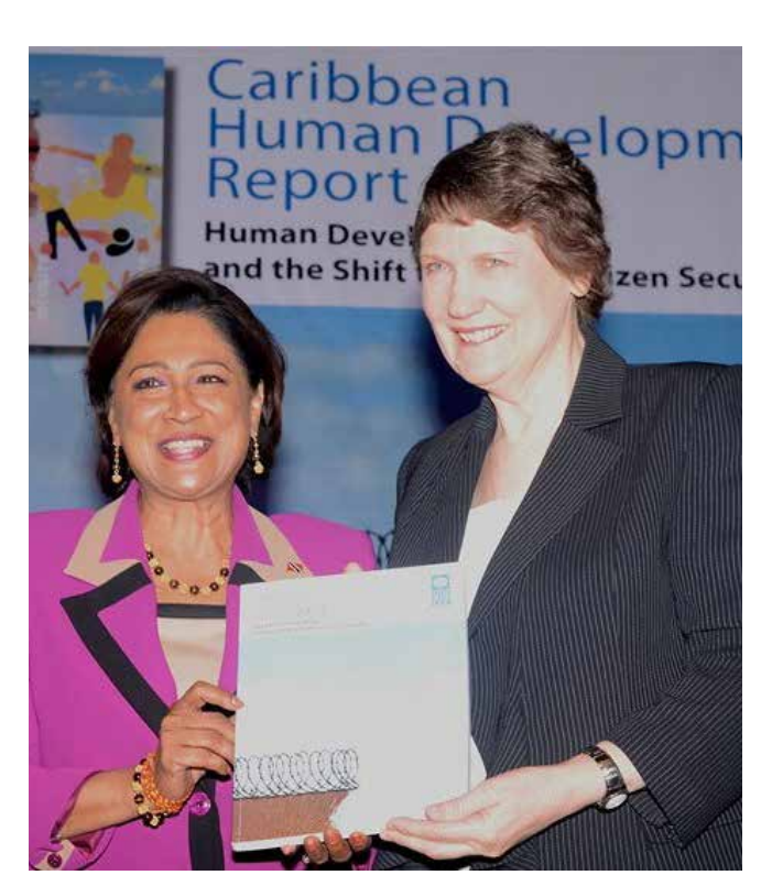
Trinidad and Tobago Prime Minister Kamla Persad Bissessar receives a copy of the CHDR from UNDP Administrator Helen Clarke during the launch of the CHDR in 2012

8 PEER-REVIEW OF THE METHODOLOGY OF THE CITIZEN SECURITY PROGRAMME IN TRINIDAD AND TOBAGO PEER-REVIEW OF THE METHODOLOGY OF THE CITIZEN SECURITY PROGRAMME IN TRINIDAD AND TOBAGO 9