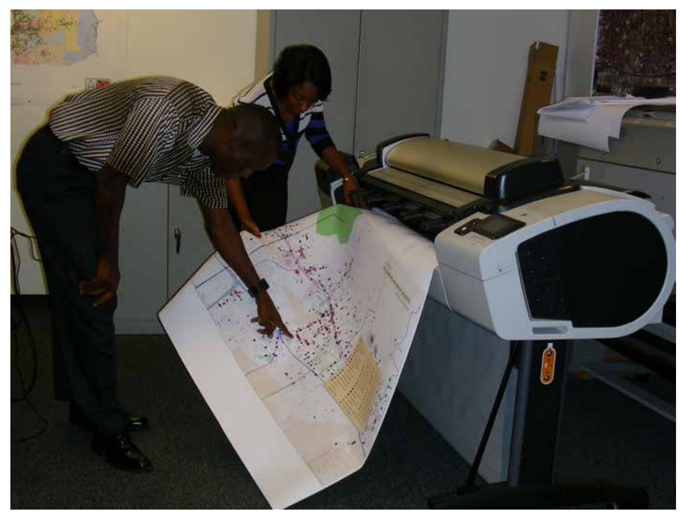
CSP funded plotters being implemented by TTPS Crime and Problem Analysis Unit

The establishment of support services for victims, and the continuous investment made in building local networks committed to conflict mediation, should be highlighted as an effective strategy with high potential for sustainability and replicability, particularly so, since it invests in building trust and social cohesion among partners. Finally, the implementation of the methodology adopted to promote the programme's vision and values is only made possible due to the combination of a strong leadership and a dedicated staff. The commitment of the CSP's team to achieving programme objectives can be perceived in the multiple efforts made in recent years, to improving the understanding of context challenges and continuous investments in monitoring and evaluating the programme's progresses and challenges.