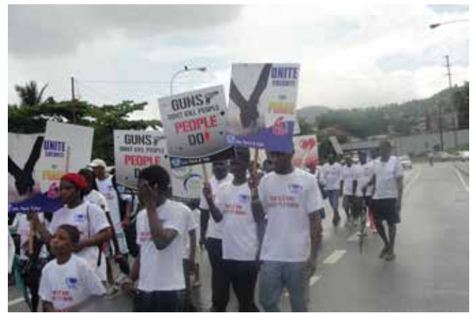
Cocorite Walk for Peace

Although the programme is already addressing the issue of interpersonal violence and violent parenting styles at the community level, the scale of the problem calls for a more comprehensive strategy that involves discussions at the national level to deconstruct accepted patterns of violent behaviours. The promotion of a better understanding of the difference between root causes, symptoms and consequences of violent behaviour seems to be key to fight stigma, not only at the community level but at the national level as well. The CSP management unit has shown interest and should further engage actors at the national level to address such issues. High levels of stigma experienced by communities in which the programme is implemented, and especially amongst youth from these communities, calls for the creation of spaces for interaction outside of the communities. Programmes looking at young people's development should focus on opening spaces in which they can be valued and visible for positive achievements and contribution to the society's development.