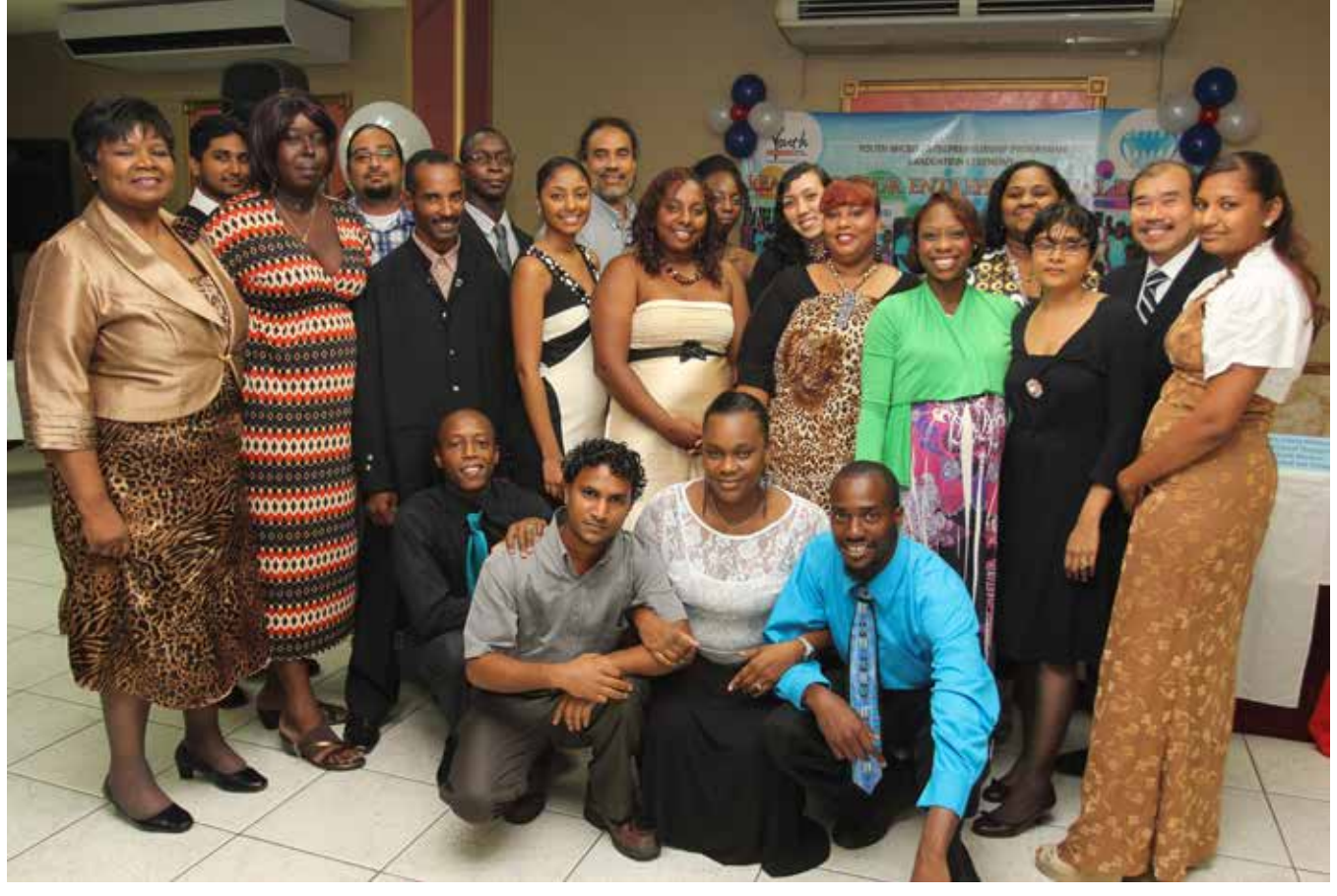
CSP Micro business development training, in partnership with Youth Business TT

The Citizen Security Programme was conceptualized as a community-based crime and violence prevention initiative aimed at building social cohesion. Their concept also visualized communities' having the capacity to develop programmes and projects to prevent and, by extension, to reduce crime and violence in the medium to long term. Over the life of the programme, a significant range of interventions have been implemented in 22 partner communities in Trinidad and Tobago. Data analysed suggests that there has been significant reductions in serious crimes in the CSP partner communities, when compared with the national average. Although a definitive conclusion on the contribution of CSP interventions to crime prevention and reduction in its partner communities is challenging, this does not preclude a tangible one. If one considers the level of distrust fear and deep fragmentation that characterized CSP partner communities in reports