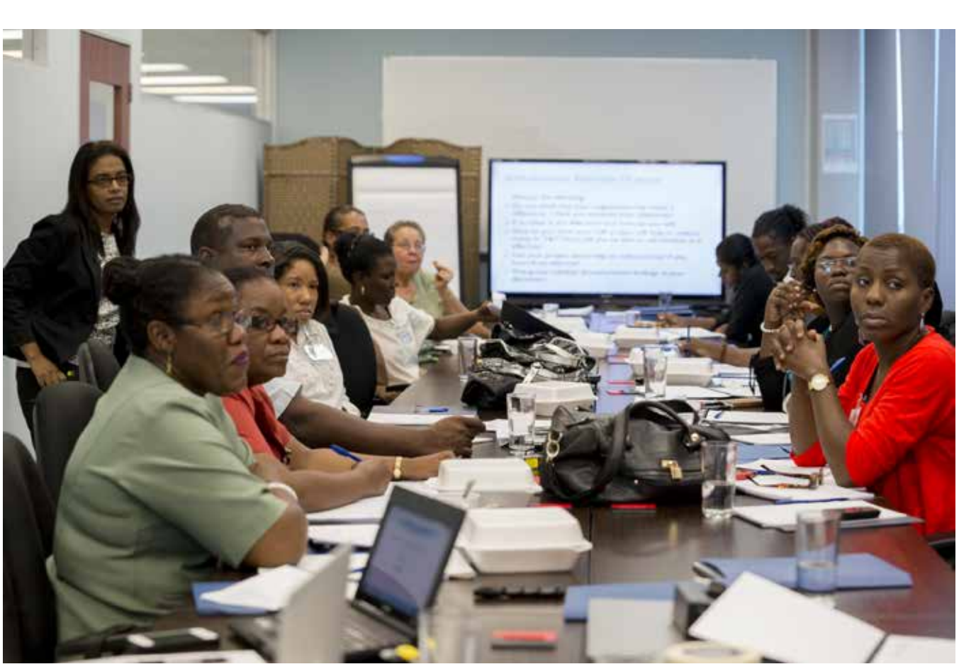
CSP NGO Capacity Building Workshop

according to an ecological model for violence prevention, focusing on the individual, family, community and society risk factors spaces, and therefore focus of action. At the Individual level, activities concentrate in training residents in violence prevention skills, counselling services and referrals: At the Family level, parenting support and education, counselling services, and referrals are the main activities supported by the programme; At the Community level programme activities focus on school partnerships, the building of youth-friendly spaces, grant programmes to community-based organizations to develop micro-projects, the maintenance of common spaces in communities, and the development of community based violence interruption strategies. In addition, still at the community level, support is provided to the Trinidad and Tobago Police Service through victim support and social work. At the level of the broader Society, the promotion of public education through multimedia campaigns, the development of a violence prevention agenda and the strengthening of the Ministry of National Security Agencies have been the main focus of the Citizen Security Programme activities.