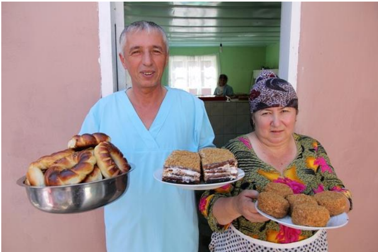
Participants in the UNDP "Aid for Trade" project. The project supports countries in the ECIS region to improve human development through trade and private sector development. The project works both regionally and individually with 11 countries: Armenia, Azerbaijan, Belarus, Georgia, Kazakhstan, Kyrgyzstan, Moldova, Tajikistan, Turkmenistan, Ukraine and Uzbekistan.

In the rural communities of Karakalpakstan, women made up 45% of the beneficiaries of UNDP initiatives who got new jobs in 24 business projects.