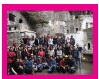
Through the youth assemblies established in the context of the Youth Assemblies project, young people are becoming a part of decision-making mechanisms and are taking important steps for Turkey's democratization.

For detailed information: www.youthforhab.org.tr www.habitaticingenclik.org.tr