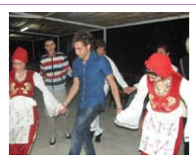
The "Walking on Moon" project developed by Menemen Anatolian Vocational High School aims to join the students of different geographies and socio-economic levels through art and to realize inter-cultural learning.

"Walking on Moon" was a project which involved students of this school who had limited opportunities and low