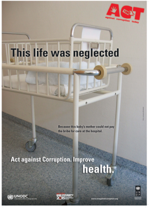
Posters from the 2011 International Anti-corruption Day Campaign