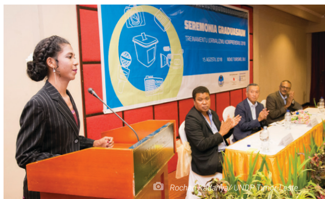
Rochan Kadariya/UNDP Timor-Leste

The journalists during the training were able to conduct TV debate every week through National Television Channel (RTTL) as practical sessions on different themes like health or education with the thematic experts and concerned government authorities raising issues and challenges faced in the country with reference to facts and figures.