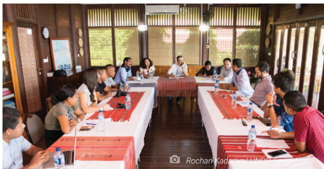
Rochan Kadariya / UNDP

There are still some areas where the project need to focus while providing further support to the EMBs. One of the important areas is the legal framework where the project can assist EMBs in identifying inconsistencies