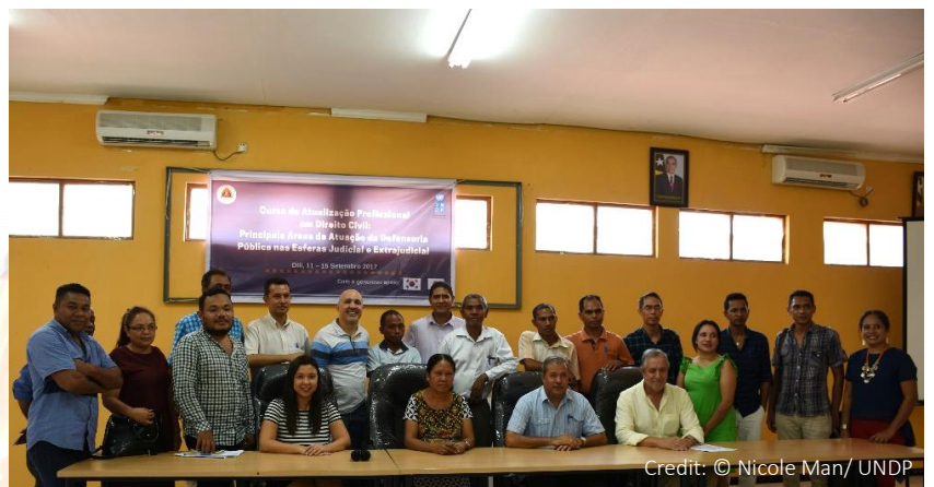
Figure 2 The five-day training ended successfully with the effort and participation from both international advisors and the public defenders.