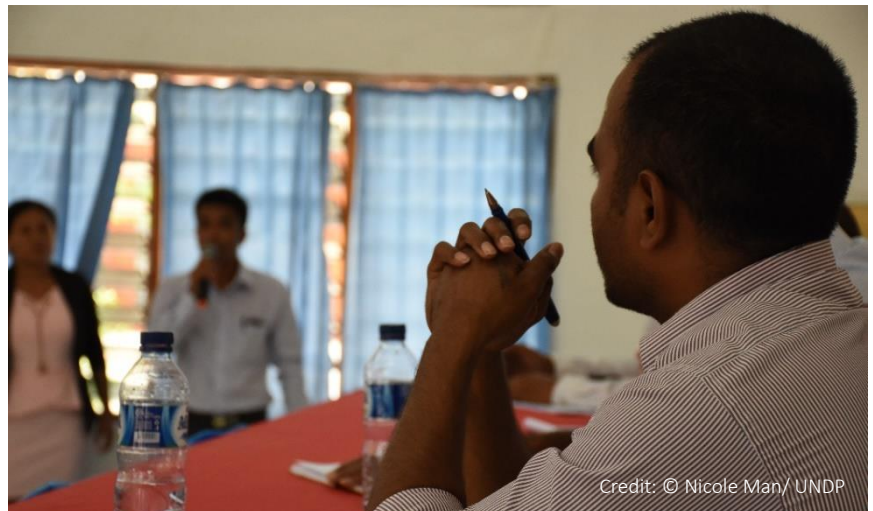
Figure 1 The xefes de sucos were asking questions to the representatives from NGOs.

UNDP's Justice System Programme, together with the Public Defender's Office (PDO), organized workshops in Suai and Manatuto in September, Ainaro and Same in October on the role of Access to Justice Clinics (AJCs). Participants at the seminar included sub-district administrators, xefe de sucos and community policing officers of the PNTL. The participants had the opportunity to hear from the Public Defender Coordinator, the PDO Adviser and representatives from partners (including Belun, the Justice and Peace Commission