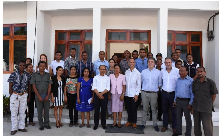
Figure 3 The team travelled to Oecusse to relaunch the Continuing Legal Education Programme to deliver training to legal professionals.

The Legal Judicial Training Center (LJTC) and the Justice System Programme (JSP) travelled to Oecusse to conduct a five-day training on land and property law and the law on combatting drug trafficking. The training was delivered to judges, prosecutors, public defenders and justice officials. The objective of the training was to improve and update the legal knowledge of the participants and to strengthen the capacity and increase the quality and efficiency of the justice institutions in resolving relevant cases.