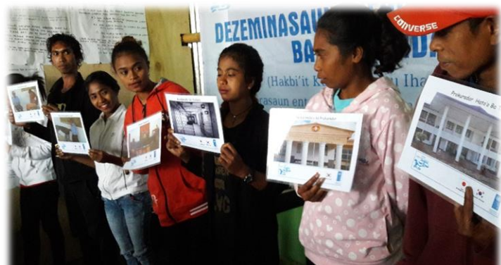
3 Participants from villages of Ainaro Municipality engaged in the session.

JSP has allocated resources to a local CSO, JNJ Advokasia to carry out the dissemination of legal information to remote communities in Timor-Leste. This partnership has operated since April, 2017. The objective is to strengthen the legal knowledge of the communities and guarantee that everyone is entitled to access to justice. In August, the information sessions are being held in villages of Ainaro Municipality during the second phase of the programme. The citizens attending the sessions have been actively engaged in discussions identifying the differences between criminal and civil cases amongst other legal matters.