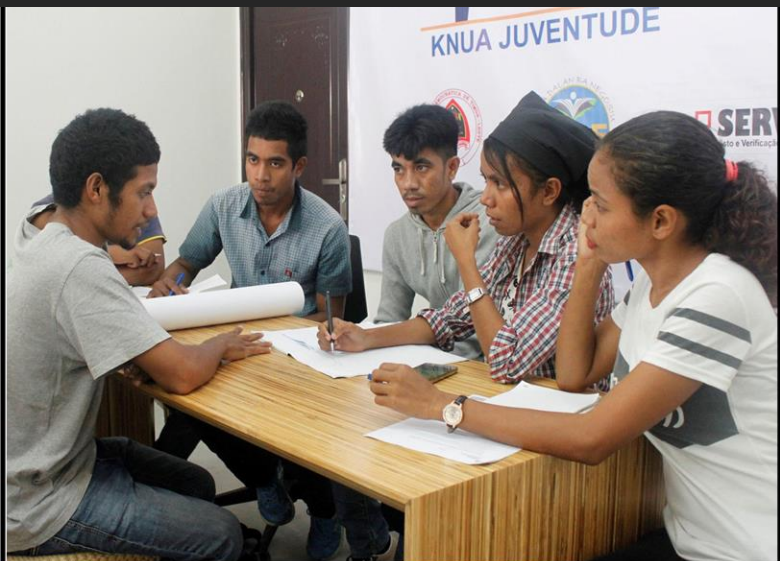
Students participate in a workshop discussion.