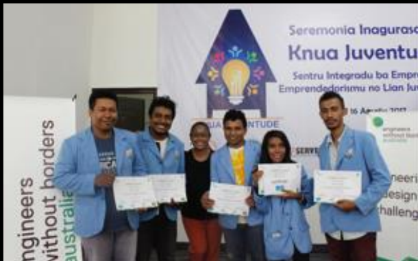
The winners of the competition.