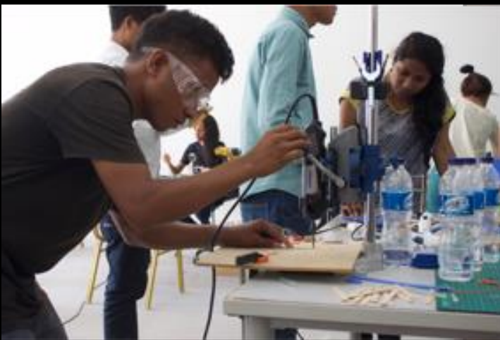
3. Making process