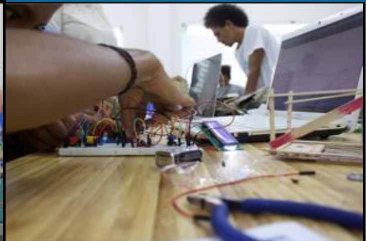
4. Digital programming