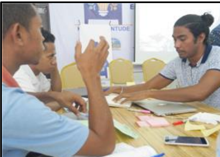
1. Ideation, 'identify the problem'

The products developed will support the downstream industries, particularly the tourism and agriculture sectors, which are areas of development focus and need in Timor-Leste. ASB plays an active role in helping to develop fledgling entrepreneurship communities in Malaysia and the greater ASEAN region. Therefore, bringing ASB closer to youth in Timor-Leste is expected to create entrepreneurs from the capable untapped community.