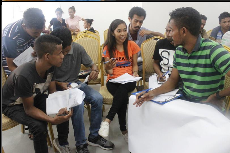
Students participate in a workshop discussion.