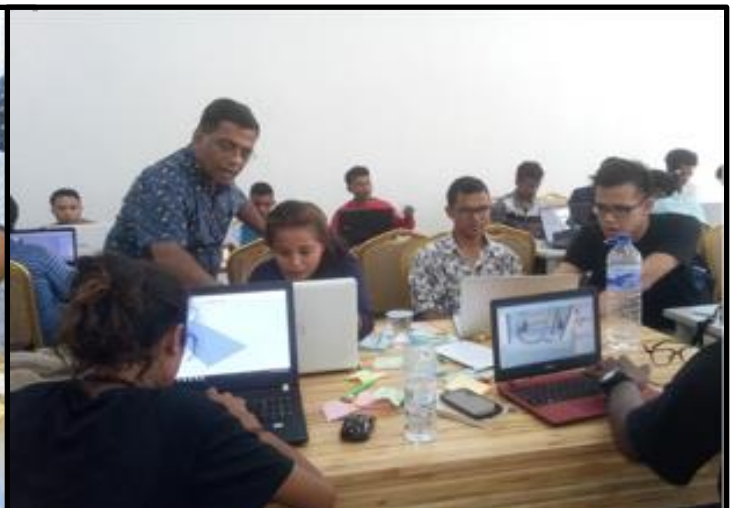
2. Design by using SketchUp software