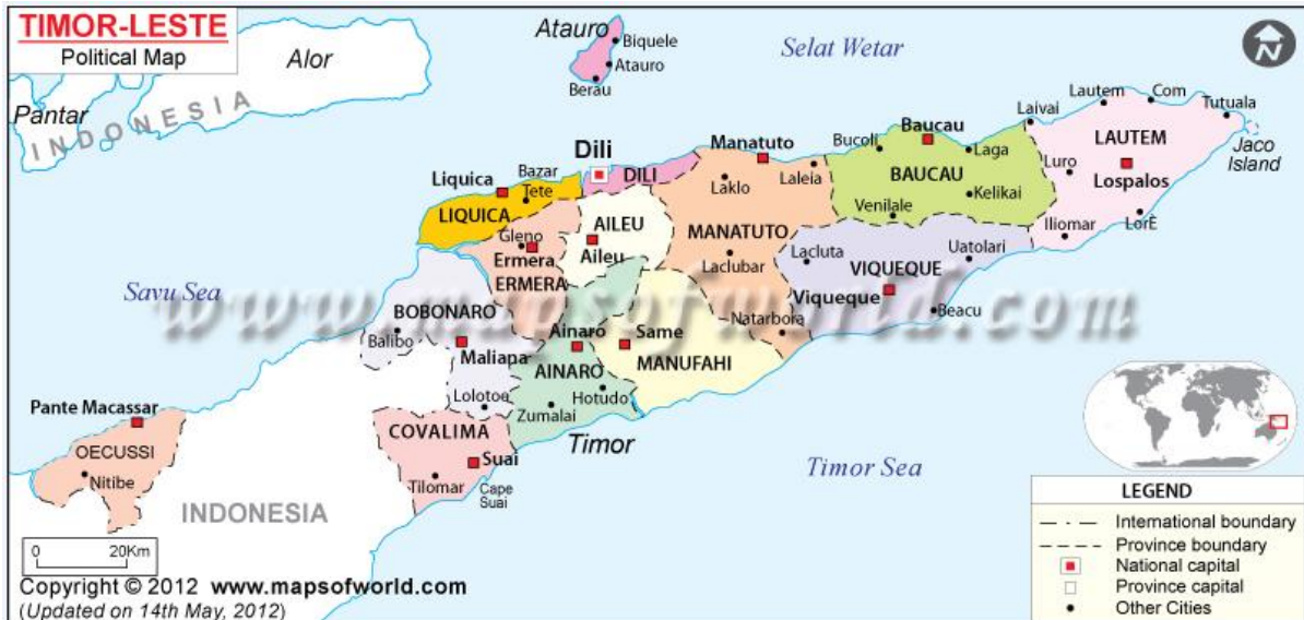
Figure 1: Map of Timor-Leste