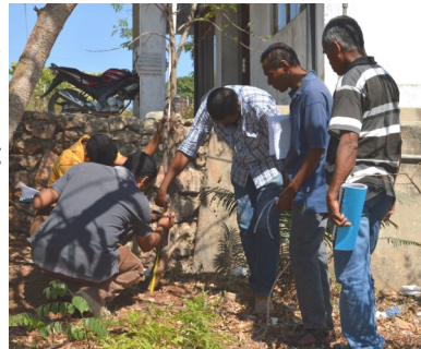
Training in Baucau, 11-10-2013