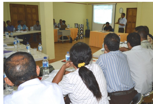
Treinamentu ba KAD iha ETDA-Dili, 30-10-2013

Oecusse district did not participate in that training because at the same time they had just conducted PDID socialization. Training for KAD Oecusse will be held in November 2013.