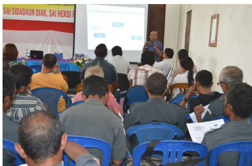
Socialization of PDID in Aileu, 23-10-13

calendar, there is a change also in the Sector Classification in Indicative Menu, that now only classified into 5 sectors such as: 1) Health, 2) Water and Sanitation, 3) Education, Culture and Sport, 4) Agriculture, Food Security and Livelihoods, and 5) Road, Bridge and Flood Control. The other alteration is about the elimination of classification of PDID project into PDD I and PDD II, that district will only present project with budget. One more alteration is about criterion in project prioritization process in district in matrix sector multi-criteria and matrix multi sector multi-criteria.