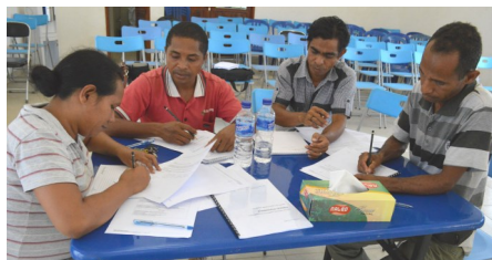
Training in Maliana, 8-10-2013