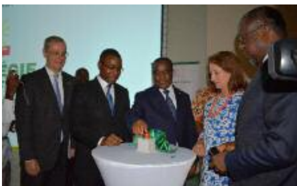
The Prime Minister launched the Togo Electrification Strategy on 27 June. The launching was performed on behalf of the Head of State