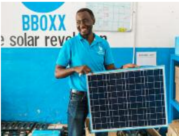
The new electrification strategy builds on renewable energy

In terms of the development of open spaces, 25,557 m 2 of green spaces have been developed in the city of Lomé since 2016. In addition, the landscaping of the surroundings and medians of public roads has been systematized in major cities. With respect to facilitating access to decent housing, 540 social housing units are being built in Lomé, in the pilot phase. In addition, land acquired by the State for construction of social housing has increased from 13 hectares in 2016 to 36 hectares in 2017.