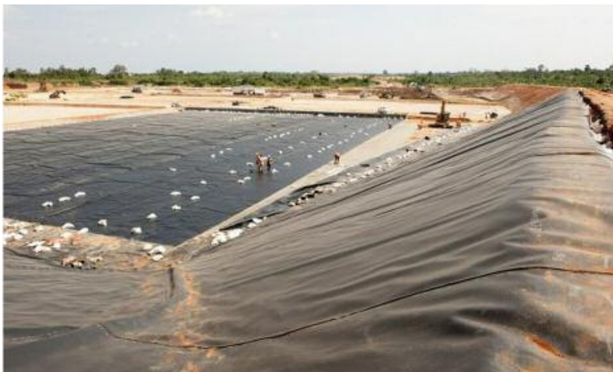
Technical Lanfill center built in Akepe

World Bank over a period of five (5) years in six (06) cities; (iv) update the national housing and urban development policy; (v) develop a green urbanization program in Togo; (vi) operationalize a Housing Bank and an urban land works and construction company; and (vii) the development of an urban transport plan for the city of Lomé.