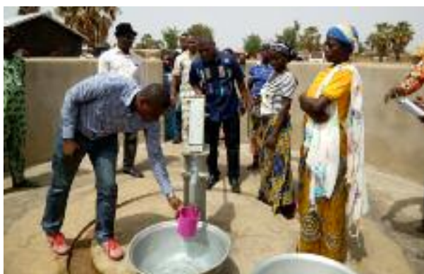
Water supply in the Sanfatoute township in northern Togo

In terms of water resource preservation, the efforts deployed to put in place 17 piezometers, 19 hydrometric stations, 9 automatic weather stations, 3 synoptic stations and 4 climate stations helped to strengthen the national network of hydrological measurements, whose operational stations increased from 33 to 52 between 2015 and 2017. Furthermore, it had been also possible to carry out monthly piezometric measurement and gauging campaigns at 7 hydrological