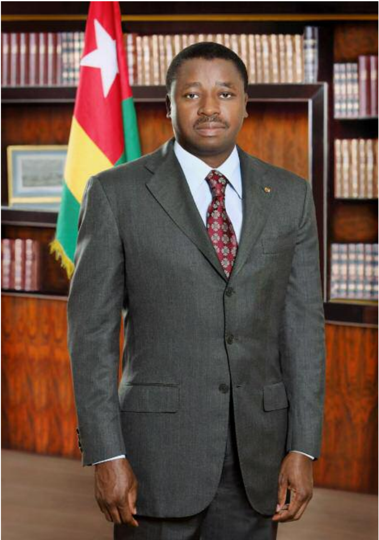
H.E. Mr. FAURE E. GNASSINGBÉ PRESIDENT OF THE REPUBLIC