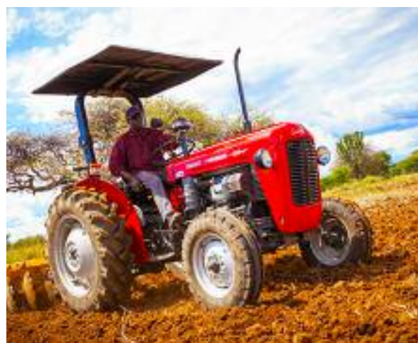
The implementation of Agropoles is a strong incentive for the mecanisation of agriculture

In order to come up with innovative smart fertilization solutions, a fundamental pillar for the improvement of agricultural production, Togo launched the development and the implement of a countrywide fertility map, which covers 3,600,000 hectares of cultivable land with a view to achieving