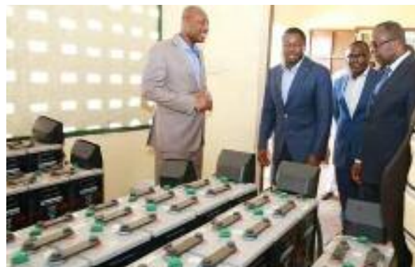
The Head of State inaugurates the photovoltaic power unit in Takpapieni in the Oti Prefecture

Yet still in the context of renewable energy development and promotion of clean technologies, energy conservation and energy efficiency, the government installed in 2017, four (4) photovoltaic solar micro-plants with a cumulative total capacity of 600 KWp in rural areas.