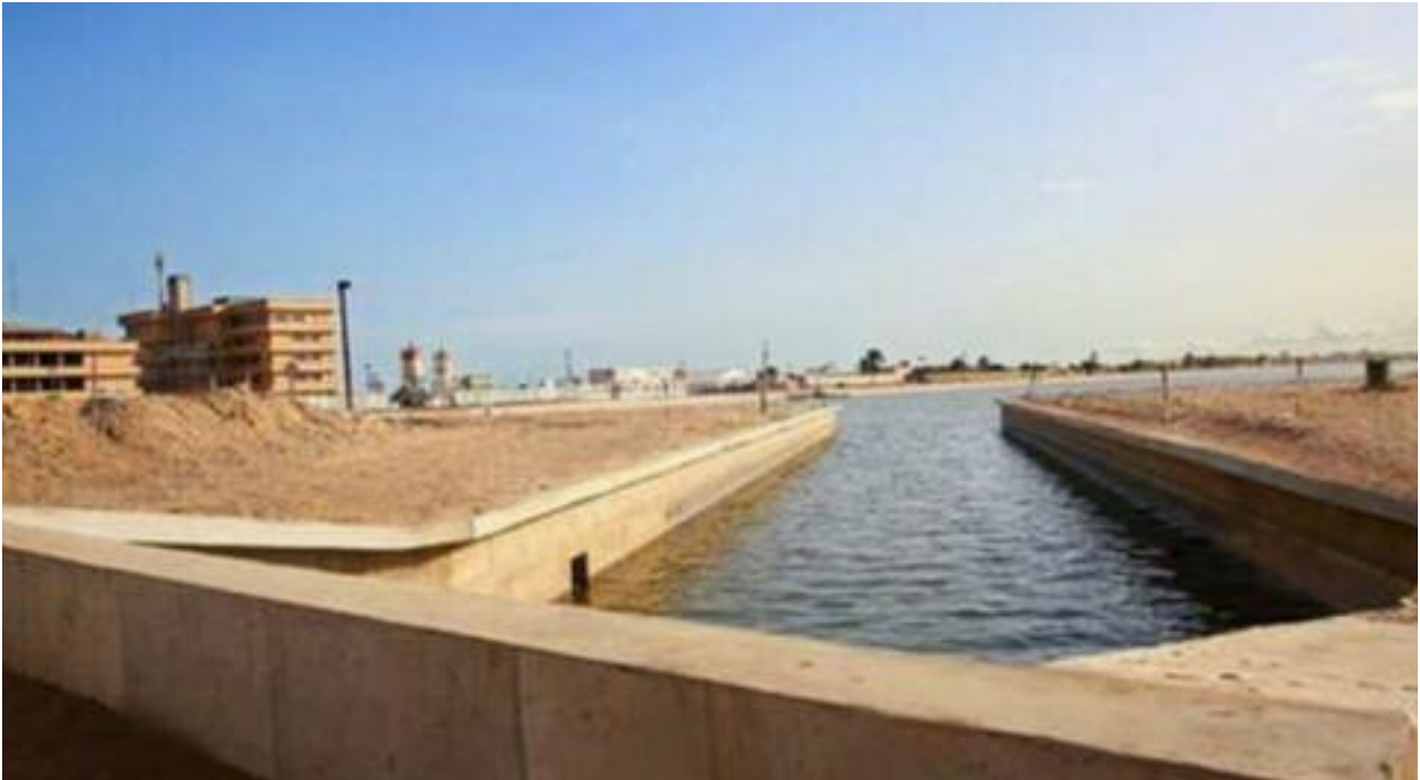
The Head of State inaugurated the 4th Lake of Lome on 31 May 2018 to tackle flood and sanitize the city

stations in Togo's lake basin. It should also be noted that an integrated water information system (SIIeau) has been put in place, 28 permits have been granted to water-conditioned producers, 5 application decrees have been signed relating to the Water Code, the development of the Hydrological Yearbook which provides information on the hydrological balance of the country's river basins (Oti, Lac Togo and Mono) and the participation of Togo in the establishment of the Volta and Mono Basin Authorities within the framework of the cross-border water management cooperation.