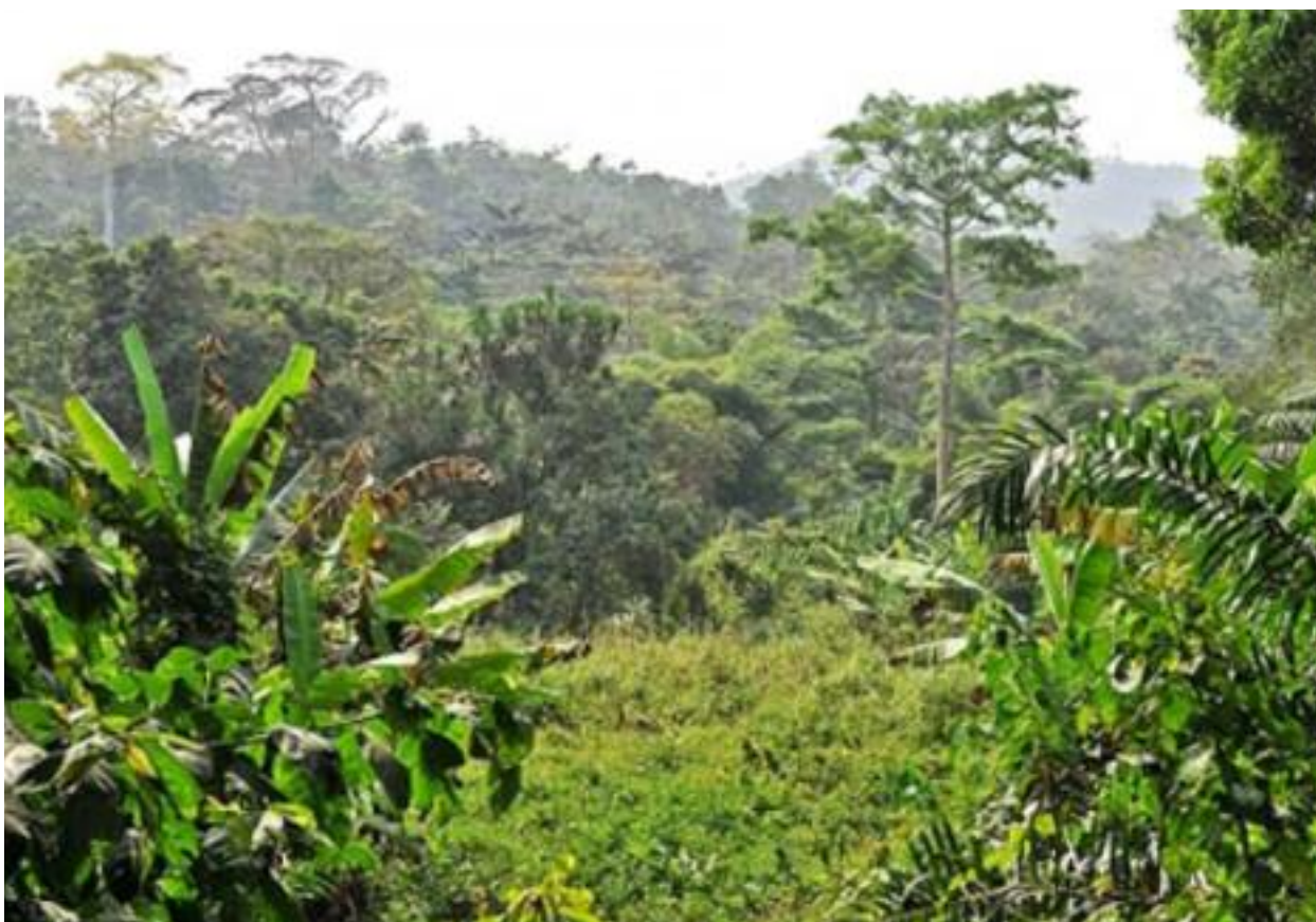
Sacred forest in the Plateaux Region

forestlands placed under protection (“no go” areas), and 382 hives have been distributed for the promotion of apiculture.