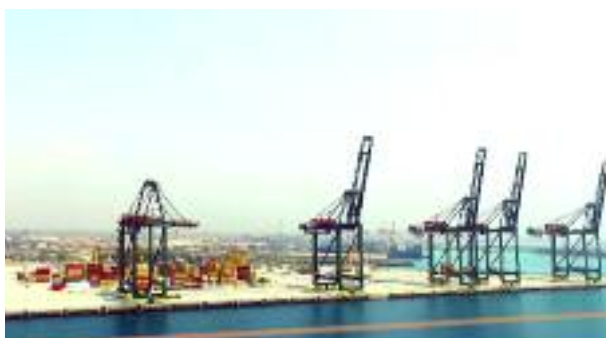
The Lome Sea Port, the only deep-water port in the West African sub region

Through the NDP, Togo has set as priority over the five years horizon to structurally transform its economy to ensure a strong, sustainable, resilient, inclusive growth susceptible of generating decent jobs that will induce improved social well-being . The objective is to achieve a strong and inclusive growth of 7.6% by 2022. Thus, the structural transformation of the economy will proceed through: