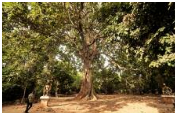
Sacred forest in the Yoto Prefecture

Since 2016, Togo has stepped up efforts against the exploitation and illicit trafficking of wild species, notably through reforms and tightening of its penal framework as well as the revision of its forestry code. As a result, crime observation and control missions carried out on ground by the forestry police enabled, in 2017, to seize 1,705 sawmill products (all products combined), a 40 feet container containing objects of arts from wild animal trophies, 219 kilograms of fresh royal python skins, 1.62 kg of dry sebae python skins and four ivory