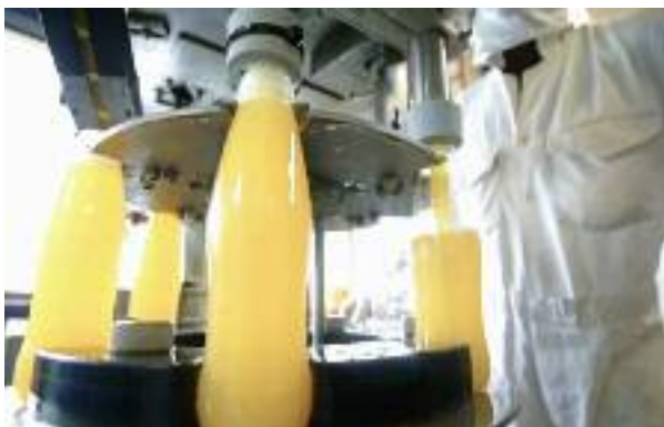
Pineapple juice production unit in Togo

In the area of agricultural production, more than 1,343 hectares of irrigated lands and lowlands have been developed with high geared water control facilities. 20 planned agricultural development zones (ZAAP), covering 1,729 hectares, have also been developed, easing access to land to more than 2,561 producers. In addition, the Government initiated in 2017, a process to develop a soil fertility map covering 3,600,000 hectares of arable lands.