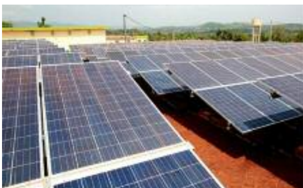
Mini solar power plant in Assoukoko

In terms of access to sustainable energy for landlocked populations, 10,000 solar street lights have been installed in Togo's five regions, including 7,000 standard solar streetlights, 2,000 solar streetlights with 5 outlets for charging appliances and 1,000 solar streetlights with 5 outlets for charging devices and a Wi-Fi "spot" for internet connection. In addition, the support of civil society organizations, through the implementation of the "Togo Smoke Free" programme, has allowed the popularization of more than 2,000 solar lamps.