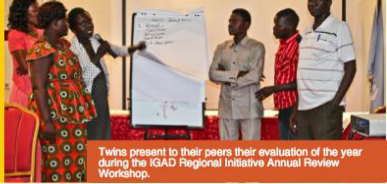
Twins present to their peers their evaluation of the year during the IGAD Regional Initiative Annual Review Workshop.

7 bills and 2 regulations on conduct of government business were drafted;