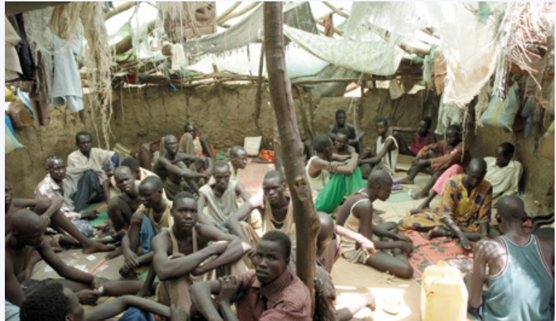
Male prisoners in an overcrowded, cell block without proper coverage to keep out the rain in Wanjok County Prison, Northern Bahr el Ghazal State, South Sudan on 22 May, 2012.

After more than two decades of civil war, official structures such as courts have ceased to function in the south. A 2005 peace deal ended Africa's longest civil war and the south formed an autonomous government. The new authority is still trying to assert itself, and customary law still dominates in many areas.