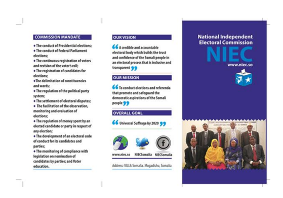
Figure 4: NIEC brochure (supported by JP)