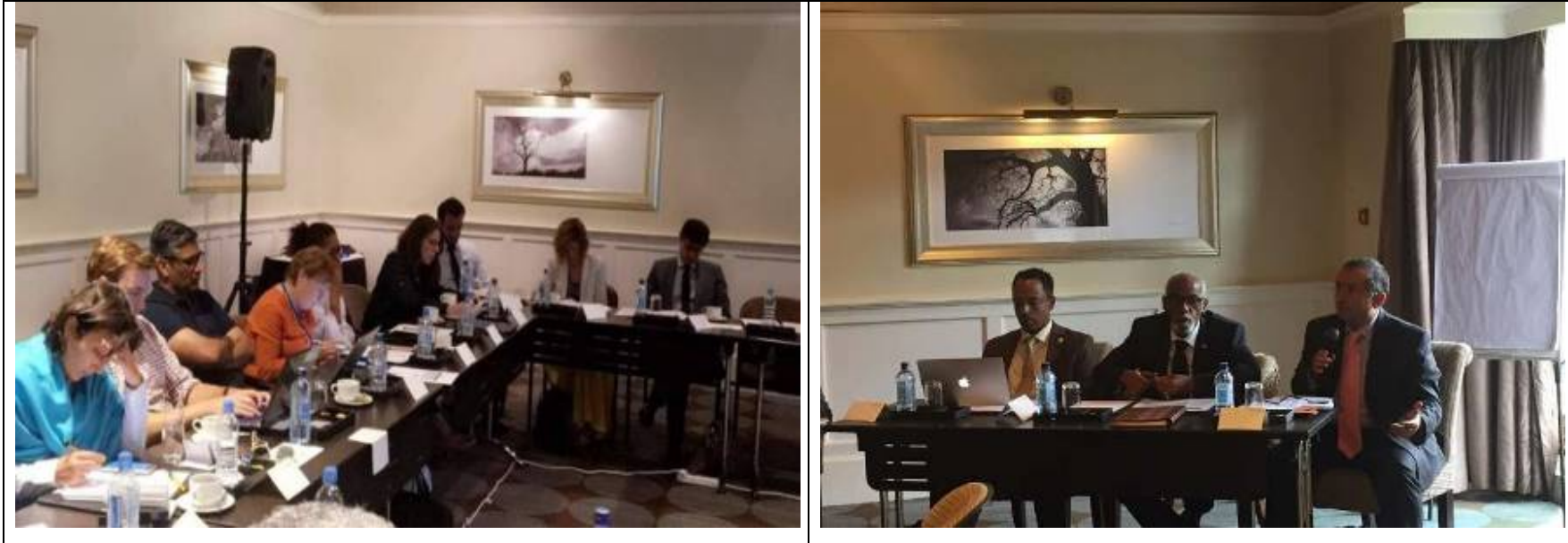
Meetings on Parliament and Constitutional Review, Nairobi (Q2)