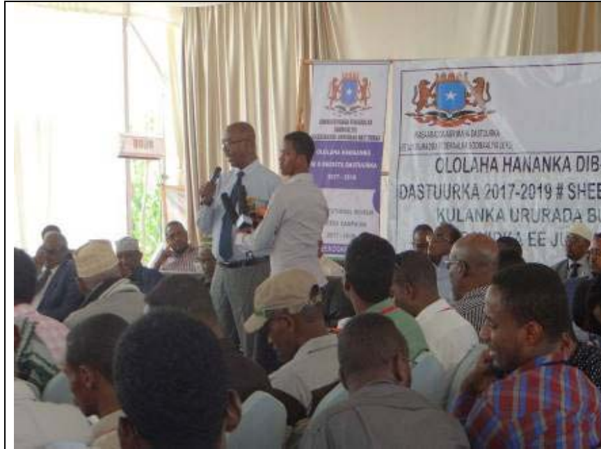
Constitutional Review Process Campaign held in Kismayo by the federal MoCA (Q3)