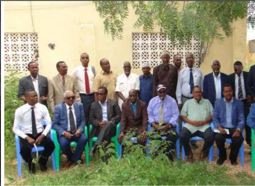
MoCA meeting with Jubaland MPs and Civil Society Organization (CSOs) in Kismayo (Q3)